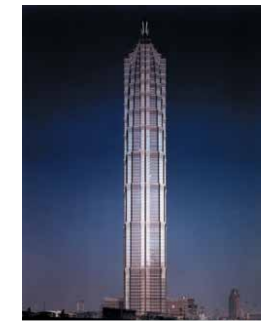
Figure 1. Jin Mao Tower, Shanghai, China. 图1. 金茂大厦,上海,中国。

In this sense, Jim Mao is uniquely Chinese in character and symbol. However, in its use of materials, building systems, the technology used to construct it, and the nature of its spaces and functions, it was a state-of-the-art, international building of the highest quality. And the pagoda-like form is also modern in other ways. The biaxial symmetry of Jin Mao responds to views from all directions, its gently stepping and undulating form ascending in a progressively rhythmic way, increasing the sense of height through the use of a forced perspective (see Figure 2). This also acts as a wind damper to diffuse the lateral wind forces on the mass, which can cause lateral movement in supertall towers that can be sensed by their occupants —a concern that I would also