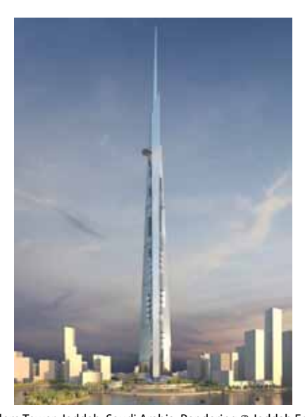
Figure 10. Kingdom Tower, Jeddah, Saudi Arabia. 图1. 帝国大厦,吉达,沙特阿拉伯。

图9. 迪拜1号, 迪拜, 阿拉伯联合酋长国。艾德里安-史密斯和戈登-吉尔建筑师事 务所渲染图, 版权所有