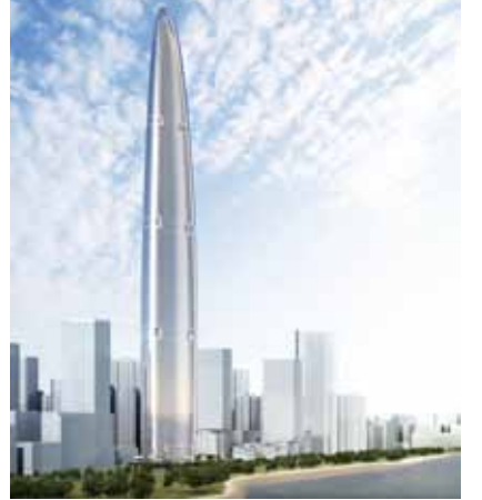
Figure 12. Wuhan Greenland Center, Wuhan, China.

图12. 武汉绿地中心,武汉,中国。艾德里安-史密斯和戈登-吉尔建筑师事务所渲染图,版权所有