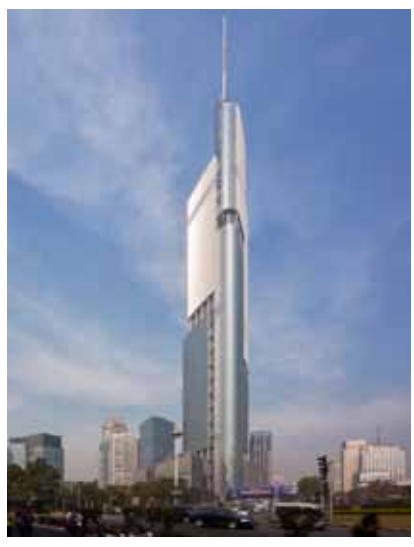
Figure 7. Zifeng Tower at Nanjing Greenland Financial Center, Nanjing, China. 图7. 南京绿地金融中心紫峰大厦,南京,中国。