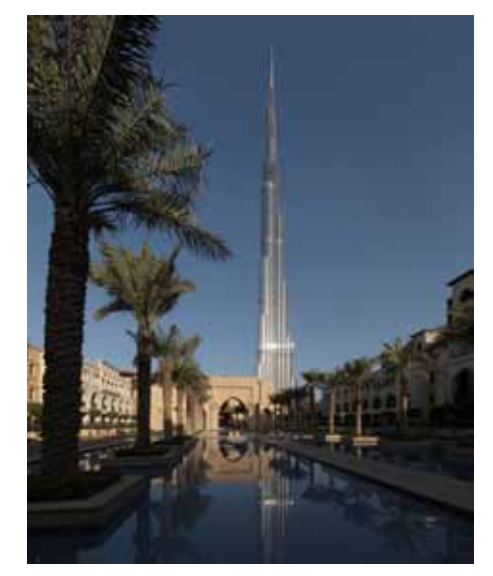
Figure 4. Burj Khalifa, Dubai, United Arab Emirates. 图4. 哈利法塔, 迪拜, 阿拉伯联合酋长国。

埃玛尔地产(Emaar Properties)代表的来访,给了我在建成项目中扩展超高层建筑类型的设计经验的机会,埃玛尔地产是迪拜的重要开发商,他们想组织一个设计竞赛,做世界第一高楼,起名叫哈利法塔(Burj Dubai)(图4),他们见过金茂大厦,是金茂让我们在2003年初得到了竞赛邀请,我们最终赢了竞赛,我们采用几何形平面,基本形状像植物的三个分支加三个角果。