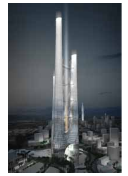
Figure 9. 1 Dubai, Dubai, United Arab Emirates.

The symbolism of the project is obviously important. Our vision for Kingdom Tower is one that represents the new spirit of Saudi Arabia. It