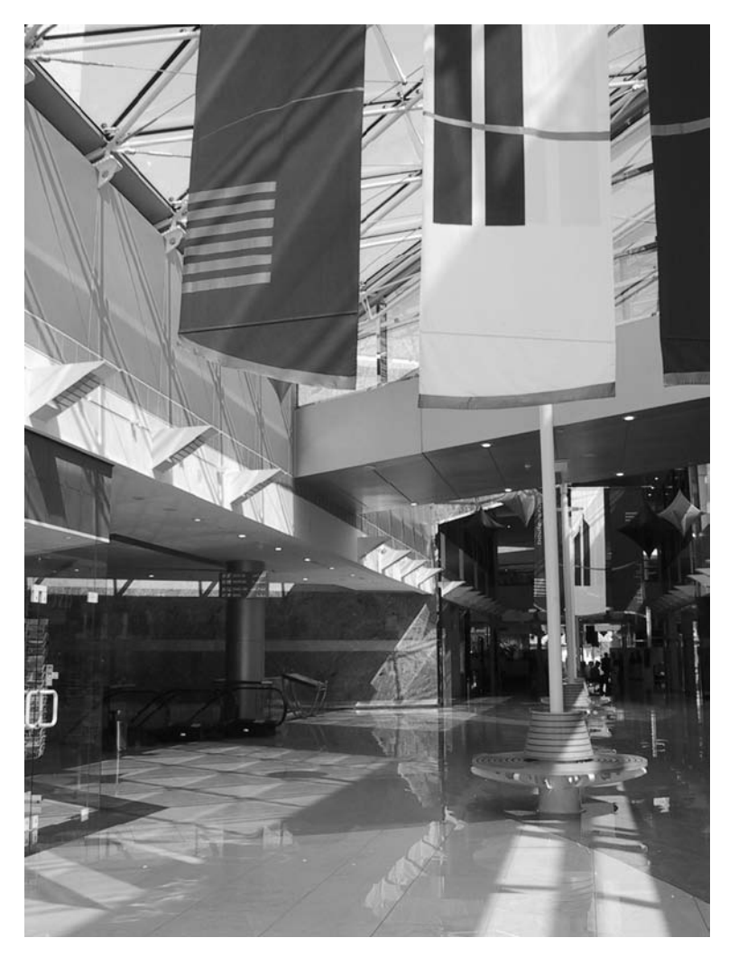
Figure 6 Retail Boulevard.