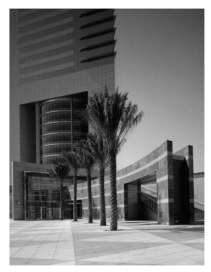
Figure 3 Podium.*

granite walls and the lightness of the stainless steel and glass entrances into the retail boulevard are juxtaposed to create a mediating scale between the towers and the streetscape (Fig. 3). Dune-shaped low-rise parking structures echo the desert landscape of the region.