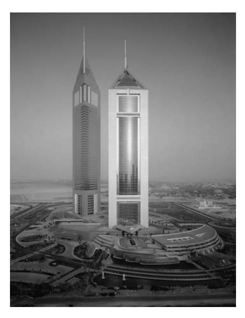
Figure 8 The Emirates Towers.*