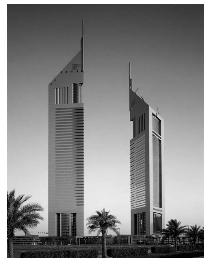
Figure 2 Pas-de-deux.*

tower echo the concept of the circle as the 'timeless whole'. Conceived as pure sculptural forms, the buildings present a dynamic silhouette against the rapidly changing Dubai skyline. As in the poetic movements of a pas-de-deux, the slender triangular towers clad in aluminium panels with copper and silver reflective glass capture the changing light of the desert sun and show off their dramatic integrated illumination at nightfall (Fig. 2).