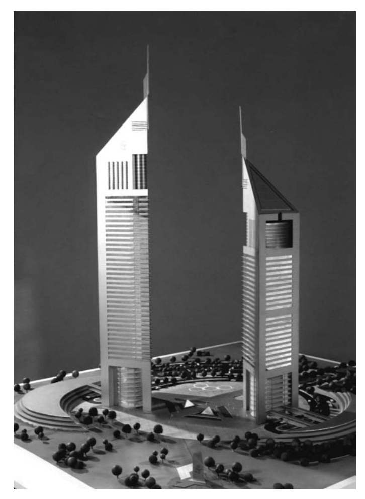
Figure 1 Winning Competition Design.

Beyond the immediate periphery of the building complex, the formal landscaped environment progresses into a natural park-like setting with gentle contours and lush vegetation buffering the roadways around the site perimeter completing the development which represents a major destination point and offers a sense of an oasis amidst an urban concrete environment.