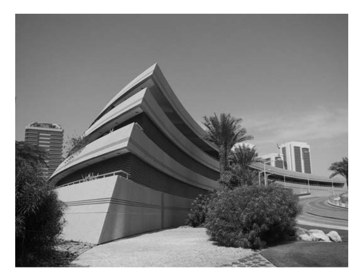
Figure 7 Parking Structure.