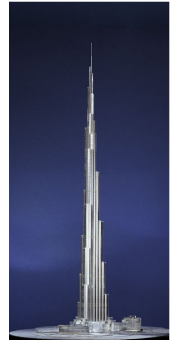
Figure 13. Model shot of Burj Dubai. The Architecture of Adrian Smith , p. 213.

The Burj Dubai is a large scale mixed-use project consisting of approximately 600 luxury condominiums including two spas and meeting facilities, 200 hotel rooms with ballroom and support amenities, 350 hotel condominiums, 50,000 square meters of luxury office space, a grand spa and health club, 7 restaurants, the worlds highest public observatory, three floors for communications, 6 mechanical floors and 3000 parking spaces. The towers gross area is over 300,000 sm above grade with a total of 450,000 sm including below grade levels.