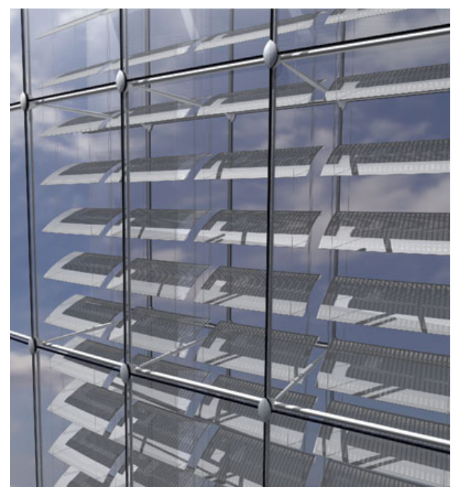
Figure 12. Close-up of tower exterior wall. The Architecture of Adrian Smith , p. 242.

Near the outer points of the three wings of the tower the module of the mullions modify and increase in distance until they reach the maximum width of 2.2 meters, thus enhancing the panoramic view from the tip of the tower. This move also establishes a greater density of activity and materiality near the central spine of the tower that dissipates as it moves out towards the end of the tower.