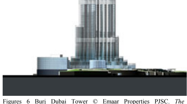
Figures 6 Burj Dubai Tower The Architecture of Adrian Smith , p. 209.