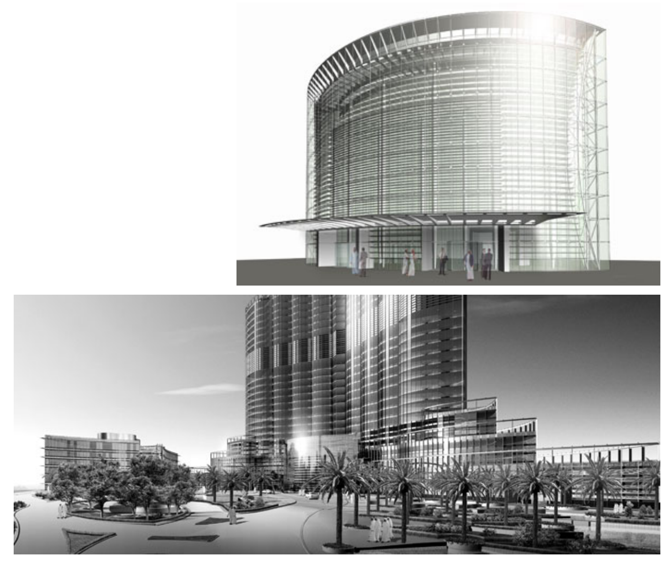
Figures 10-11. Pavilion at Burj Dubai. © Emaar Properties PJSC The Architecture of Adrian Smith , p. 231.

The pavilions are designed as instruments of light.