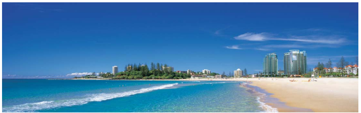
Fig. 1. The two new towers on Marine Pde. Coolangatta R1 and RT2, Developed by Niecon, designed by Omiros One Architecture (O1a). Images provided by O1a.

As you gaze out your 20 storey balcony into the turquoise blue horizon, you can hear the surf breaking right below you. The temperature is a perfect 24° C and yet just two hours ago, in another part of the country, you were braving the elements at a mere 8° C.