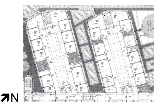
Figure 2: Conceptual and Final design of Classroom wings