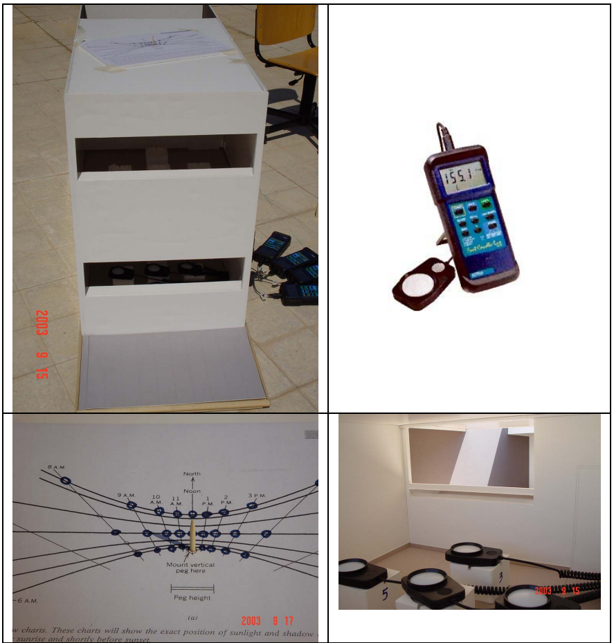
Figure 4: Simulation experiment tools used; physical model of the classrooms, Extech Instruments heavyduty light meter, peg chart used for solar angles and the photo sensors placed inside the model.

The location of the points of illuminance measurements in the classroom has been chosen to be in five different locations. These five locations are then placed where the photo sensors are going to be located for taking the illuminance measurements. These points inside the classroom were placed on the intersection points of a 1.25 meter by 1.25 meter grid of the five meters by five meters floor plan. The location of the five points are arranged in a way that the light distribution measurements will be in two orthogonal axes, one is perpendicular to the windows and the other one is parallel to the windows. The illuminances were measured in this experiment by using five Extech Instruments heavy duty light meter as shown in (Fig. 4).