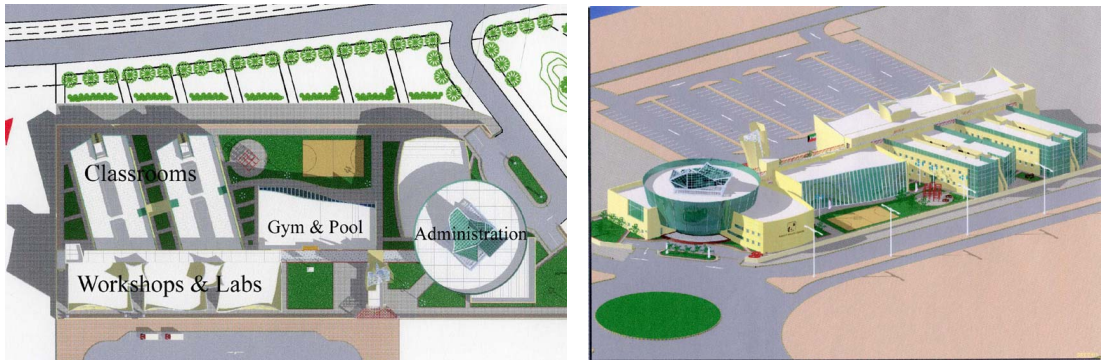
Figure 1: Kuwait Autism Centre components layout and perspective

The new premises of the Kuwait Autism Centre [KAC] comprises three main components; the administrative building, the gymnasium and swimming pool complex, and the autistic school building. The latter comprises two classroom wings for male and female students, workshops and laboratories building, a simulation house, and staff accommodation studios (Fig.1). The KAC accommodates autistic cases from pre-school age till end of high school. KAC also caters for the needs of older autistic cases through training programs in the simulation house. The focus of this paper is on the study of daylighting in the two classroom wings shown below.