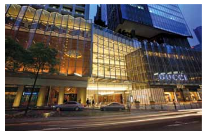
Figure 3. The Landmark, Hong Kong.