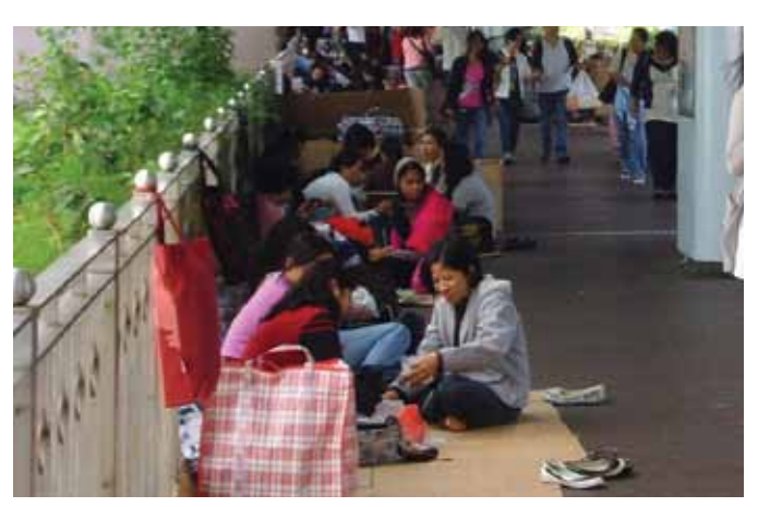
Figure 4. Domestic helpers gathering on the skybridge network in Hong Kong every Sunday.

still different in their retail areas. Alexandra House became a catalyst after we did major renovations 12 years ago. We and our design consultants came up with a strikingly beautiful palette of openness, visual links to the outside with full-height glazed walls, a new mezzanine level with F+B outlets overlooking the main lift lobbies and footbridges, Aurisina limestone floors, Gascoigne Beige limestone walls, great lighting, full-height retail shopfronts, and the warmth of elegant timber veneers.