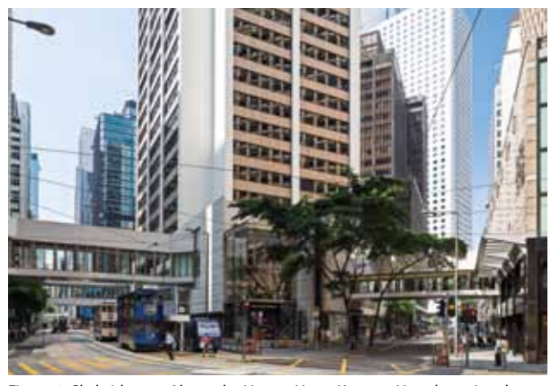
Figure 1. Skybridges at Alexandra House, Hong Kong.

66 Putting in the footbridges and allowing retail to expand both vertically and horizontally across buildings has driven enough traffic that it now comprises at least 30 to 35% of our total annual retail profits in Hong Kong. 99