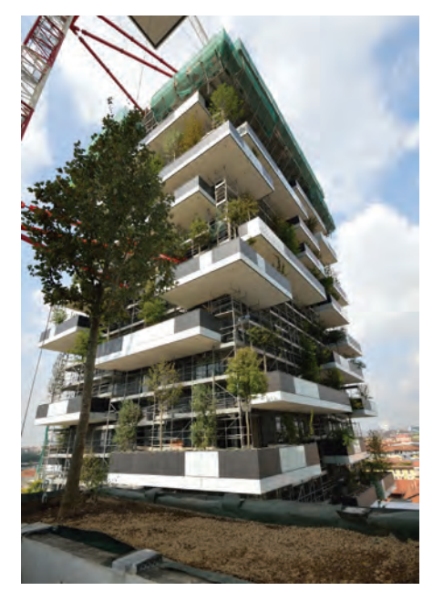
Figure 4. The Tower D Seen from the Tower E The trees species planted on the Bosco Verticale are 23. It is possible to notice that some trees are expected to grow up to three floors which mean 10 meters. 图4. 从E座塔楼视角看D座塔楼

容器的大小取决于所其中种植植物的尺寸:植树容器高1.10米,深 1.10米;灌木和草本植物容器高50厘米,深50厘米。