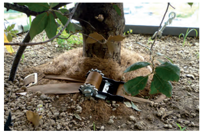
Figure 6. Anchoring System Of The Root Ball The textile belts fix the roots ball of the trees passing through a steel-welded-net positioned on the bottom of the plant container. 图6. 锚定根球系统 植物容器的底部放置三条皮布捆绑的钢网以固定植物的根球。

E座1层至8层种植欧洲榉木(左一);13层到26层种植波斯铁木(左二和左三)。这两个品种非常具有装饰性和外观相似,因为它们具有相似的叶子。木质坚硬,但是前者的体量较大,且修剪不易;而第二个是灌木品种,生长缓慢。