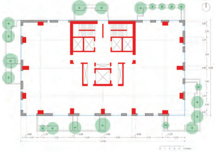
Figure 3. Horizontal section of the typical floor plan of the Tower E The structure of the Bosco Verticale is made entirely of reinforced concrete. The vertical load-bearing structures are formed by 13 pillars, placed on the perimeter of the floor plan, and by the service core, containing two staircases, three lifts and five ducts for the systems. 图3. 塔E标准层平面图

空中森林的结构完全是由钢筋混凝土组成。垂直承重结构包括放置在建筑平面边界 上的13个柱子,核心筒包含两个楼梯、三部电梯、和五管道系统。