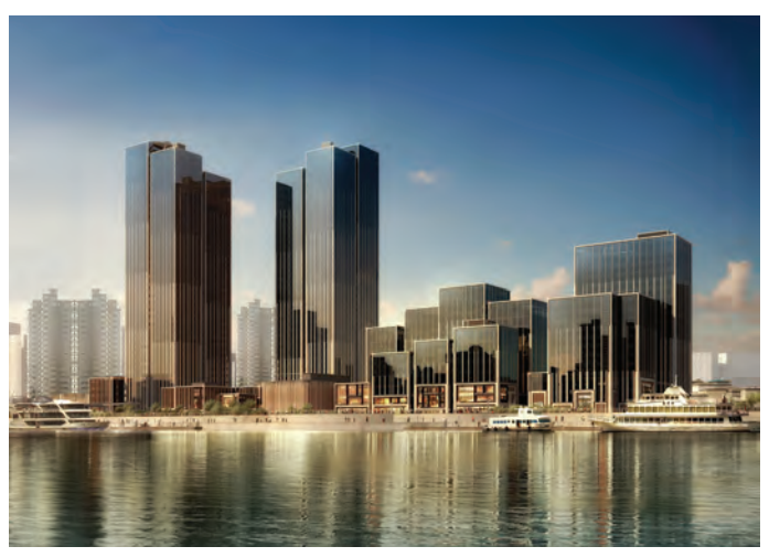
Figure 3b. Skyline 图片3b. 天际线