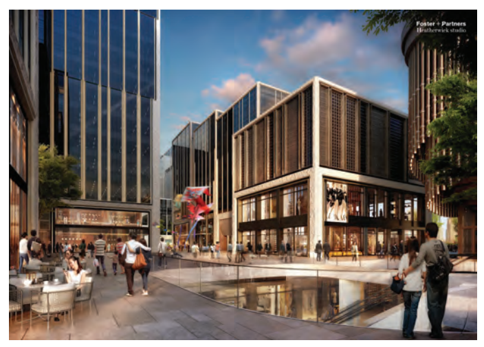
Figure 3a. Commercial Street 图片3a. 商业街道