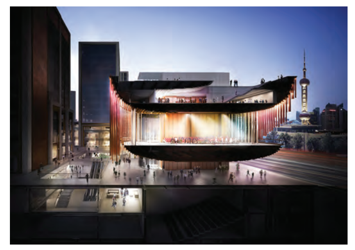
Figure 5. Project Rendering 图片5. 项目效果图