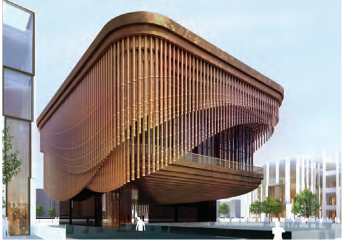
Figure 4. Art Center 图片4. 艺术中心

综上所述,我们要在尊重历史文化的根基上,从可持续发展的 观念上杜绝"千城一面"的发生。创新城市开发理念,BFC正从"硬 件、软件及内容"上注入文化的力量,丰富城市建筑的内涵,通 过"五感"使人们体验文化的注入,"停留"因此成为可能,营造出 一个能够同时满足人们"精神文化需求和物质商品欲望"的"城市会 客厅"。BFC将通过平台运营机制,有机地整合平面与垂直立体空 间中各种资源,使之产生互动增值并创建富有活力的生态圈,赋 予建筑持续发展的生命力,让生活在城市中的人们与建筑文化发 生"化学作用",这种"作用"一定会产生奇妙的心理体验,真正感受 到城市带给我们的美好。