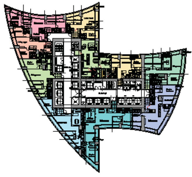
Figure 1. Typical residential floor plan © Studio Daniel Libeskind

The project maintains efficient floor plates and repeatable construction for about two-thirds of the height of each tower. The extruded footprints change shape only at the tops of the buildings, when they taper up, culminating in the tower tips. Even when the tops of the buildings do taper, about half of the floor plate remains the same (see Figure 3). One half of the floor plate is extruded directly to its maximum height with no tapering. The same tower footprint is used in each residential tower, one being a mirror image of the other two, to create the same footprint which eases the efficiency of the development while creating a unique, S