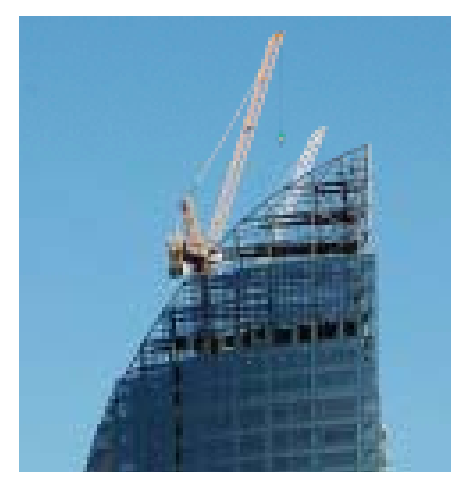
Figure 6. Tapered tip © Studio Daniel Libeskind

Additional vertical steel was provided in the core walls to maintain the effective wall \pounds