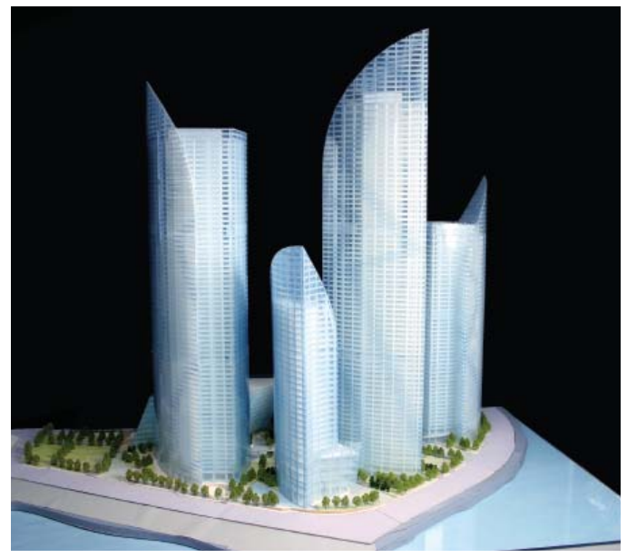
Figure 2. Haeundae l'Park, Busan © Studio Daniel Libeskind