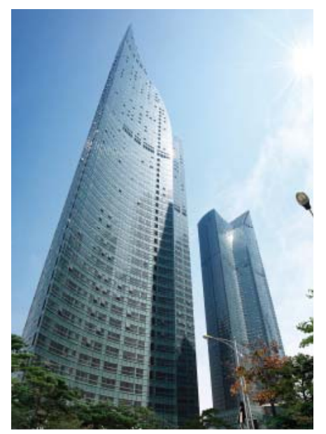
Figure 5. Curved façade © Studio Daniel Libeskind

from natural disaster. These systems perform at the highest level in terms of environment, economy and human life. Energy-saving technology such as a cogeneration system generates electricity and heat simultaneously to achieve efficiency of energy consumption in the complex, minimizing the impact on the environment. Also, combined with the cogeneration system, the central hot water supply system allows for a sustainable and livable residential development. Further, given that this site is on a coastline and is prone to the effects of typhoons, flood proofing has been incorporated into the design to prevent significant property damage and loss of critical building systems for extended periods of time.