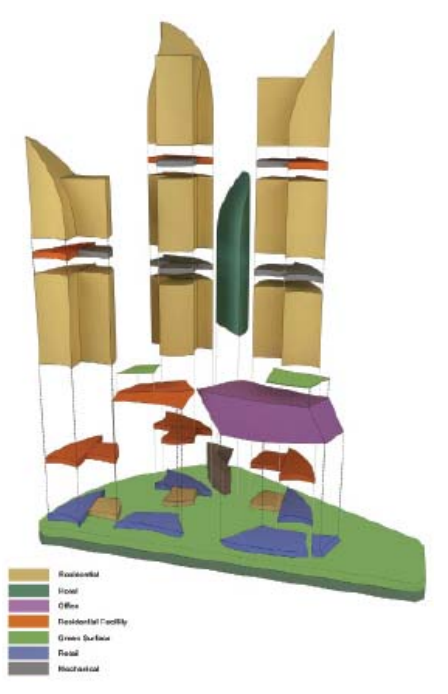
Figure 3. Site mass diagram © Studio Daniel Libeskind

varied design composition and dramatic image on the skyline.