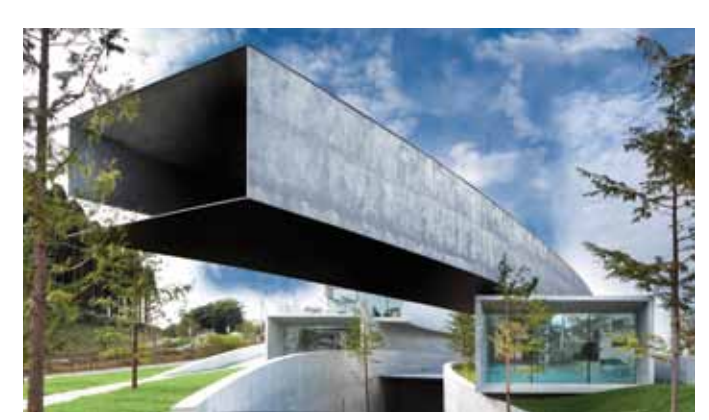
Figure 7. Hoki Museum, Chiba.

In this design, the team fashioned the steel structure itself into the building's internal and external finish (see Figure 7). By deploying the costly steel structure as both interior and façade, further savings could be made beyond the elimination of the need for a frame structure.