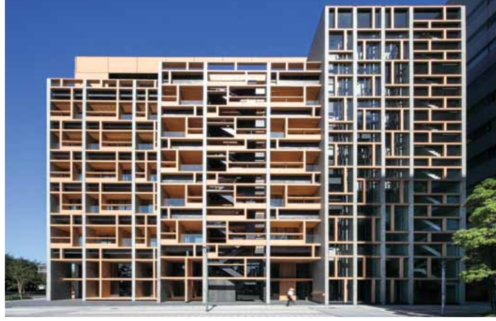
Figure 9. Mokuzai Kaikan, Tokyo.

The combination of extending the slab, placing the pillars along the balconies, and extending the wooden eaves acts not only as a façade that has well-defined features, but also as a shade that blocks the strong western sun. In normal situations, this provides a place for office workers to relax, but in case of emergency, it also acts as an extremely safe