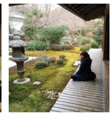
Figure 2. Multi-purpose Japanese engawa (veranda).