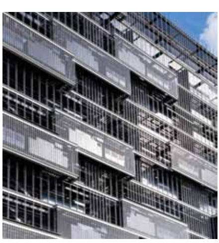
Figure 11. Lazona Kawasaki Toshiba Building – façade system. © Gankosha

exhaust efficiency of the external airconditioning unit, the shade of the buildings in the neighborhood, and the angle of the sun. The project also included a façade system that resists rapid heating in sunlight, easily cools down with minimal airflow, and suppresses the heat island effect of the building, by way of a third key element (see Figure 11). A heat sink is formed by the combination of extremely thin metal louvers, perforated with holes, and concrete panels with relatively high heat storage capacity placed behind the louvers.