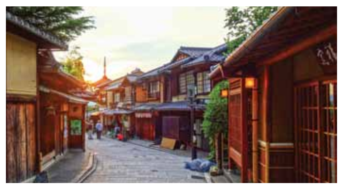
Figure 3. Tategu – façade in traditional Japanese architecture, which consists of exposed pillars, beams, and fittings.