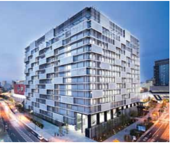
Figure 10. Lazona Kawasaki Toshiba Building, Kawasaki.