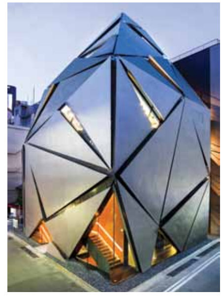
Figure 6. Jinbocho Theater Building, Tokyo. © Nikken Sekkei

Here the steel plate composes the façade as arawashi , and simultaneously serves both an