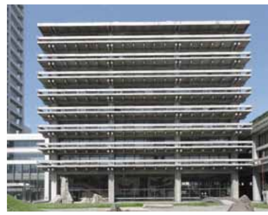
Figure 5. Kagawa Prefectural Office, Kagawa.

In general, the pattern of joists used on the underside of the eaves, reflected in the reinforced-concrete (RC) structure, is often treated as an architectural aesthetic inspired by the joinery used in traditional wood architecture. Although it is polished to be extremely thin, the joist is actually not a cosmetic feature. It is in fact the arawashi of the physical structure, and also communicates the theme of "internal and external continuity." Moreover, the balcony surrounding the exterior of the joist bridges the exterior and interior of the building as a modern engawa ,