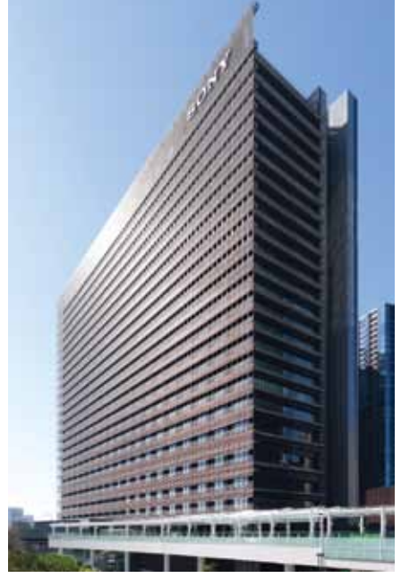
Figure 12. NBF Osaki Building, Tokyo.

The pattern of the exterior is determined by multiple parameters, including the heat-