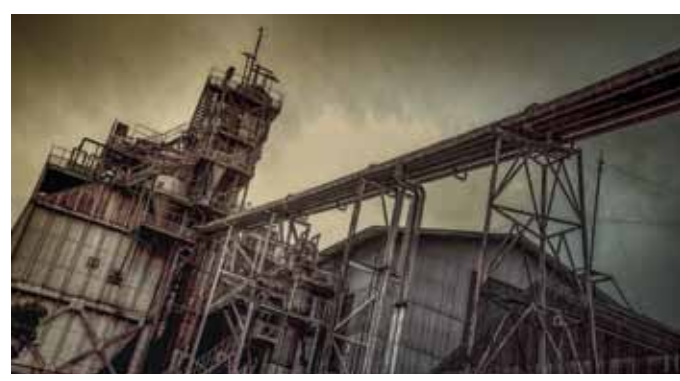
Figure 4. Kojo-moe (factory infatuation) in action.

prevents heat in the room from escaping to the outside (see Figure 2). On the other hand, during summer, both fittings are opened to let the air in. Eaves that cover a large section above the corridor block high-angle sunlight. This is a Japanese aesthetic, in which the exterior has multiple purposes, not only as a boundary between the internal and external space, but also as a circulation path and furnished place of repose. Contemporary Japanese architects aim to imbue this aesthetic in large-scale architecture.