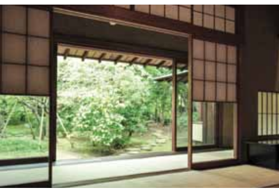
Figure 1. Engawa (veranda) in traditional Japanese architecture.

A belief that architectural elements should serve multiple purposes is at the core of Japanese design culture. For example, the engawa (veranda) acts not only as an interface that physically connects the internal and external space, but also as a bench where people can sit. Furthermore, it forms a kind of transition space that connects to the back corridor. During winter, it becomes a double skin by closing both the fittings facing the exterior corridor and the fittings facing the rooms. It