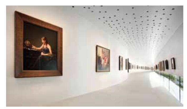
Figure 8. Interior of Hoki Museum showing the computer generated lighting pattern. \ensuremath{\mathbb{C}} Nikken Sekkei