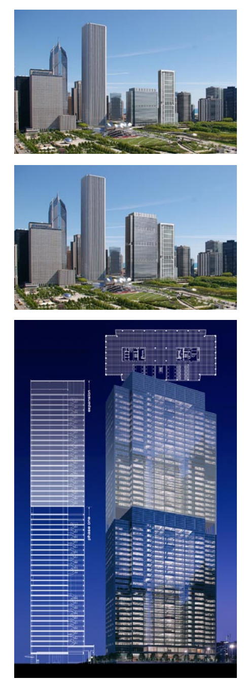
Figures 3/4. Blue Cross BlueShield of Illinois Headquarters, Chicago, Illinois, USA, 1997/2010

Client: Health Care Service Corporation Architect: Goettsch Partners