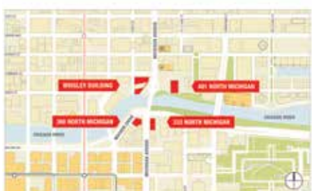
Figure 1. Two maps of downtown Chicago. The top map highlights the main downtown Chicago shopping district. The Four Corners is central to the district. The bottom map is an enlarged view of The Four Corners.