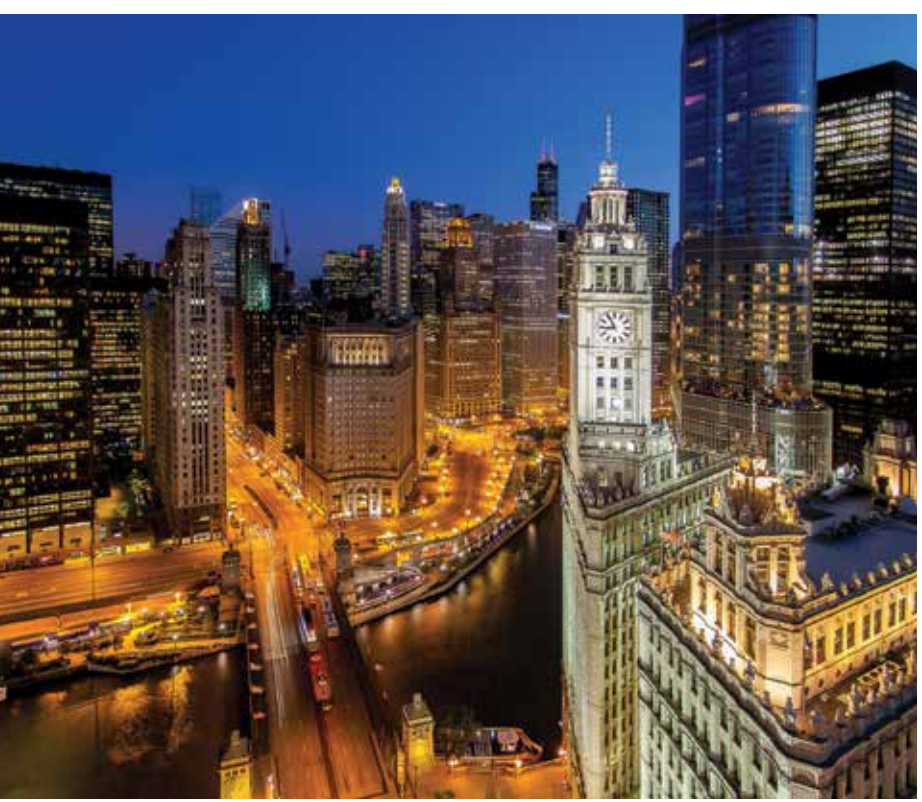
Figure 2. View of The Four Corners looking south.