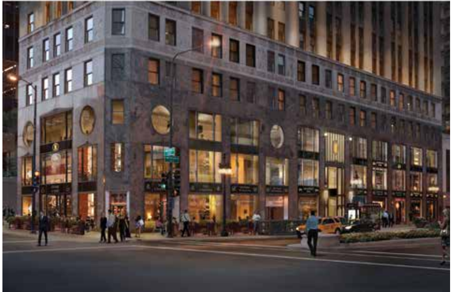
Figure 12. (Top) 333 North Michigan before renovation; (Bottom) Rendering of 333 North Michigan after renovation.