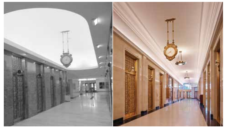
Figure 6. (Left) View of Wrigley Building elevator lobby before renovation; (Right) View of restored Wrigley Building elevator lobby.