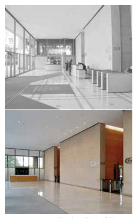
Figure 15. (Top) 401 North Michigan building lobby before renovation; (Bottom) 401 North Michigan building lobby after renovation.

virtually unobstructed city and lake views, the changes from the exterior are imperceptible except when lit at night.