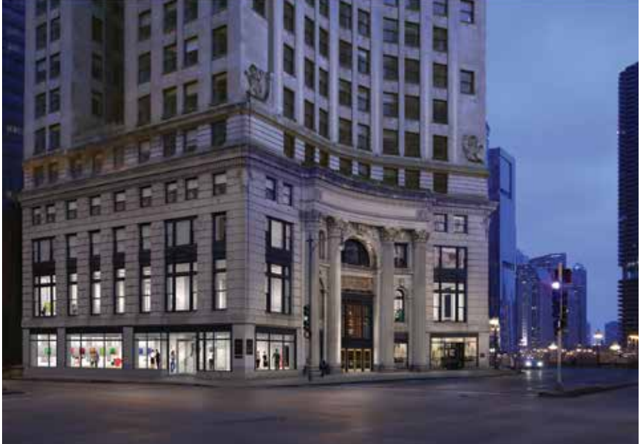
Figure 11. (Top) 360 North Michigan before renovation: (Bottom) Rendering of 360 North Michigan after renovation. (Source: Goettsch Partners)

and interior storefronts. With a modern twist, the original artwork was scanned into CAD drawing files to create composite photo renderings, as well as detailed drawings for the pattern makers use in accommodating foundry shrinkage.