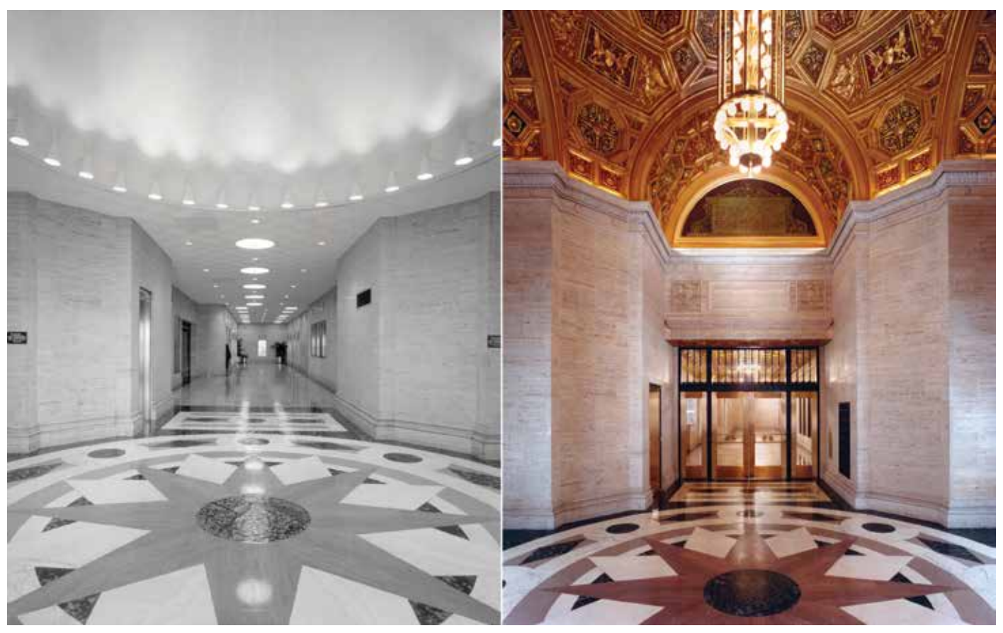
Figure 9. (Left) 360 North Michigan lobby before restoration; (Right) 360 North Michigan lobby after restoration.