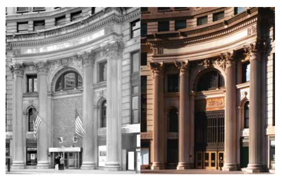
Figure 8. (Left) View of 360 North Michigan entry before restoration; (Right) View of 360 North Michigan after restoration.

Elevator cabs were renovated and all new hall lanterns and controls were installed.