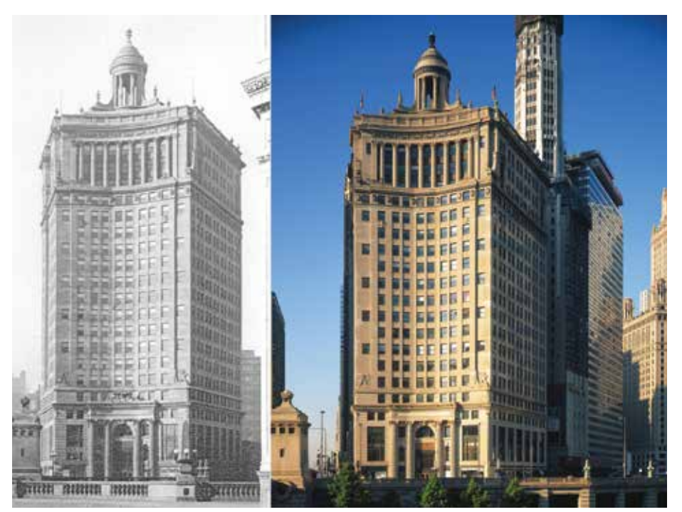
Figure 7. (Left) Overall historic view of 360 North Michigan; (Right) Overall view of 360 North Michigan after restoration.