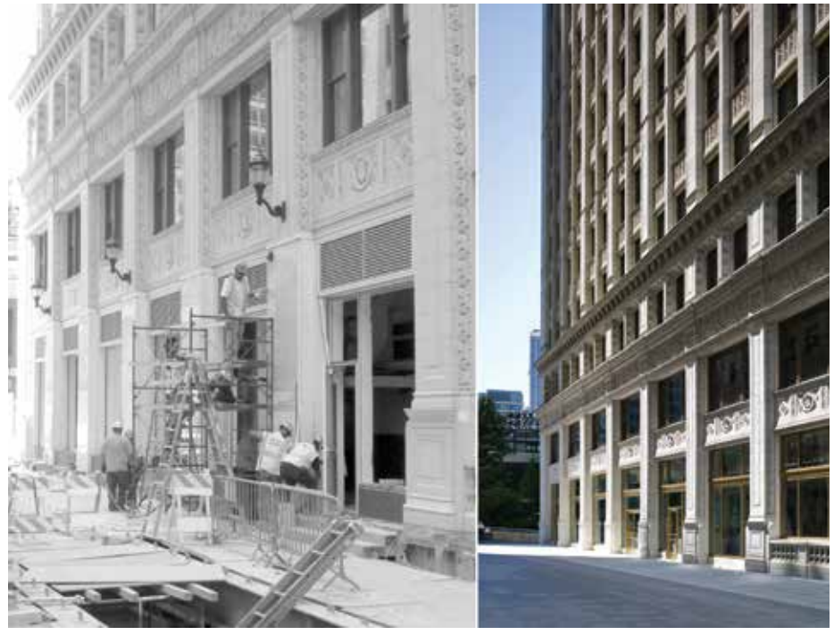
Figure 5. (Left) View of Wrigley Building facade before renovation; (Right) View of Wrigley Building facade after renovation.

cotta overhangs did not allow for an efficient exterior window cleaning solution. Four manufacturers created mock-ups on a floor in the courtyard space, providing both a visual mock-up and a test case for each mock-up to ascertain if the cleaning methodology was efficient. A full upgrade of all mechanical, electrical and low voltage systems, plus the creation a fully sprinklered building was accomplished. All toilet rooms and public corridors were renovated. This was completed in the building while partially occupied.