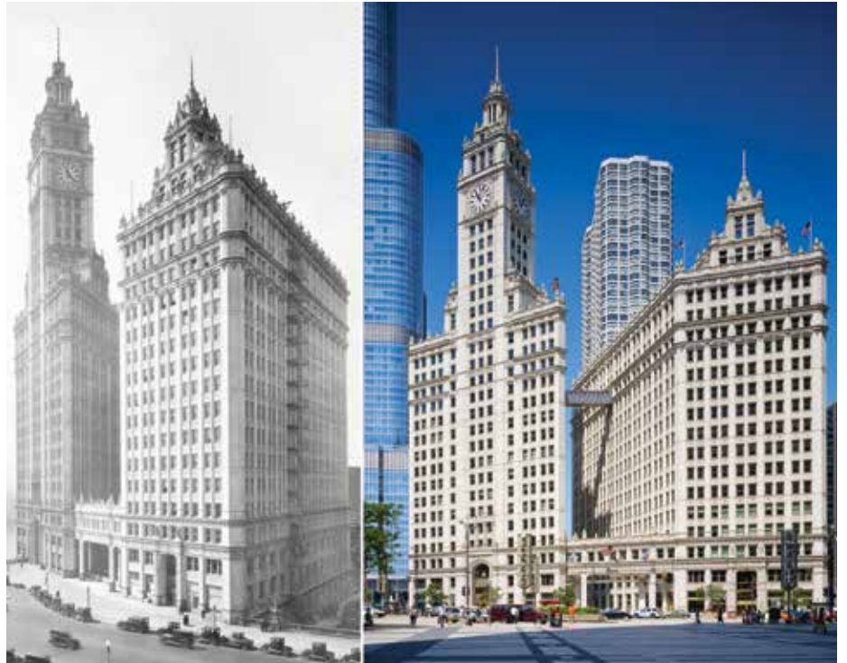
Figure 3. (Left) Historic photo of Wrigley Building overall; (Right) Photo of Wrigley Building, restored.

in 1921, with the North Tower following in 1924. The two buildings comprise a total of 502,000 square feet (see Figure 3).