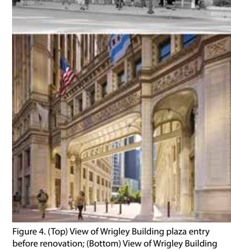
plaza entry after renovation.

Inside the towers, all major public areas were renovated. The building lobbies in both the South and North Towers and the lobby ceilings were removed and replaced with modern interpretations of the original designs (see Figure 6). On the upper floors, work involved replacing over 2,000 windows with efficient thermally isolated, insulated glass units in a historic profile to meet Landmark standards. The unusual requirement for these windows was that they had to be capable of being cleaned from the inside as the terra