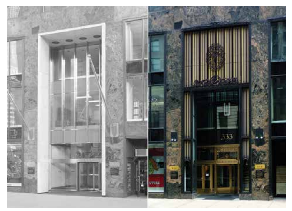
Figure 13. (Left) 333 North Michigan main entry before renovation; (Right) 333 North Michigan main entry after renovation.

terraces, new exterior enclosure and amazing views up and down North Michigan Avenue.