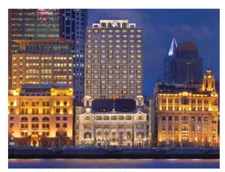
Figure 9. Waldorf Astoria Shanghai on the Bund from across the Huang Pu River.

图9. 上海外滩华尔道夫酒店面向黄浦江