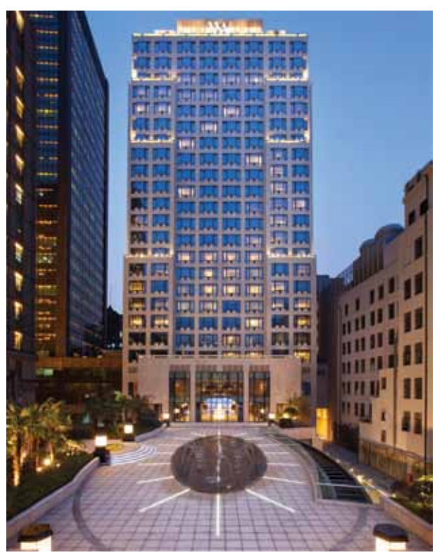
Figure 10. New courtyard and guestroom tower of the Waldorf Astoria Shanghai on the Bund

As the client, Shanghai New Union Building Co., Ltd., wished, the design rejuvenates the Bund experience with appropriate contemporary functions and active pedestrian venues, while taking care to preserve and restore the original architectural character, resulting in a two-building complex - the century-old heritage building, dubbed the "Waldorf Astoria Club" in remembrance of the building's original historical identity as the Shanghai Club, and the Waldorf Astoria Tower, a newly-built guestroom annex that rises to offer amazing vistas of the Huang Pu River. The new tower design complements the historic club, but does not attempt to mimic its grand neo-Classical style. Transitioning from one building to the other, quests will notice similarities through design motifs, patterned textiles and even the furnishings selected by interior design firm, Hirsch Bedner Associates. The project team was successful in creating a seamless progression in ambience and design that honors both the heritage of the historic club as well as the modern classic spirit of The Bund today (see Figure 10). The biggest challenge was to design and position the tower so it did not dominate the heritage building.