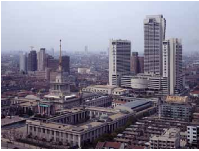
Figure 5. Shanghai Centre dominated the Shanghai skyline in 1991.

Beijing Yintai Centre, (see Figure 7) is a comprehensive mixed-use project providing hospitality, residential, office, retail and entertainment spaces. The three towers, square in form, are studies in simple, straightforward design — a taller residential tower flanked by twin office towers. The residential tower features a five-star Park Hyatt hotel that includes residences. The hotel registration area and other public functions, such as a specialty restaurant, are located on the uppermost floors, providing spectacular views of Beijing. A podium base grounds the three towers and includes retail, restaurants, event facilities, and fitness center.