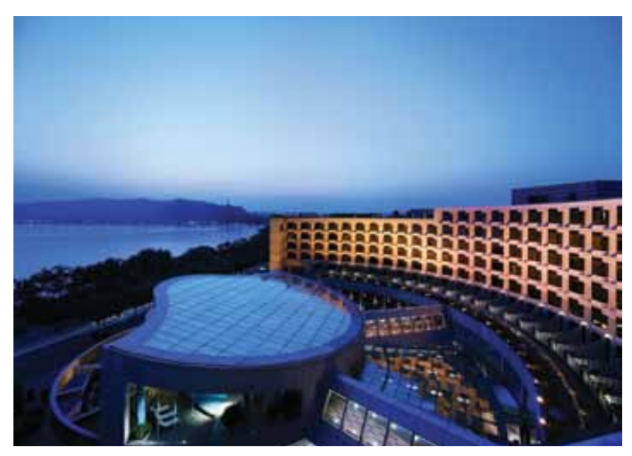
Figure 8. Figure 8, The design of the Hyatt Regency Hangzhou takes full advantage of the beauty of its setting on China's West Lake. 图8. 杭州凯悦酒店的设计充分利用了基地位于中国西湖美景中的优势

The site for the Hyatt Regency in Hangzhou directly faces the beautiful West Lake (see Figure 8). For more than 800 years, this scenic area has inspired writers, poets and artists to immortalize it in their works. Being respectful of the setting and enhancing the experience for guests, the design also builds business advantages for the owners/operators. The hotel's concave shape both embraces the historic lake and sets the building back from the lakefront while also increasing the number of guestrooms with views to the water.