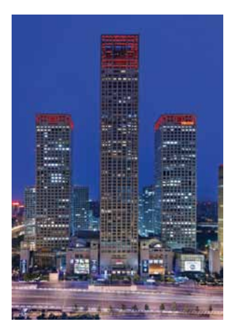
Figure 7. The tower tops of Beijing Yintai Centre are inspired by traditional Chinese lanterns.

图7. 北京银泰中心塔楼顶部的设计灵感来源于中国传统的灯笼