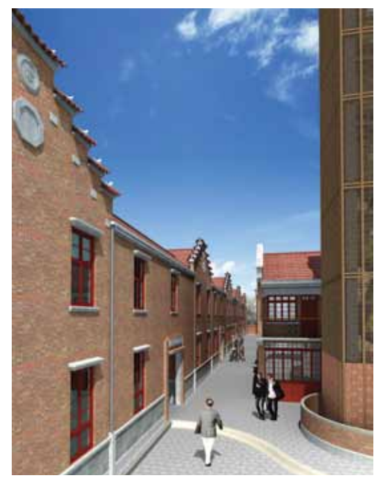
Figure 11. Traditional "Horse Head Wall" at Portman House | Jian Ye Li

China will continue to be the story for years to come – for Portman and many firms; domestic and foreign. As international hotel companies pursue growing their brands here, hotels of all service levels and price points are being developed, making hotel design an extremely competitive field. Mixed-use developments will remain popular;