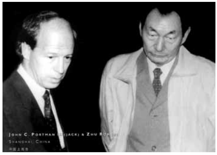
Figure 1. Jack Portman with Zhu Rongji – Shanghai's then-Mayor – Circa 1990.

图1. 杰克·波特曼与上海当时的市长朱镕基 - 约1990年