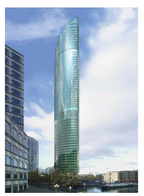
Figure 10. Columbus Tower, London. © MWA+D

locations for economic clusters of related activities, or acted as catalysts for regeneration. He added that he would take into account the benefits of public access to the upper floors. Rafael Viñoly's 20 Fenchurch Street, for instance, will have sky gardens at the top and will provide free public access. The Shard has a public viewing platform on the 72<sup>nd</sup> floor, although there has been some criticism that the £25 entry fee restricts the level of public accessibility.