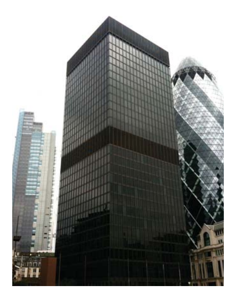
Figure 3. Aviva Tower, London.

to 24 meters – the length of the Fire Brigade's ladders. Although it was increased to 30 meters in that year, the London County Council, which administered the Acts, increasingly granted waivers permitting some structures higher than this limit. The erection of a number of buildings that blocked views of St. Paul's caused a public furor at the time. As a result, in 1938 the Corporation of the City of London – the historical core and financial center of the capital – adopted controls known as St. Paul's Heights, which protected views of Wren's dome from the river and adjoining streets. These controls remain in place to this day, and together with the London View Management Framework, are key to the control of tall buildings.