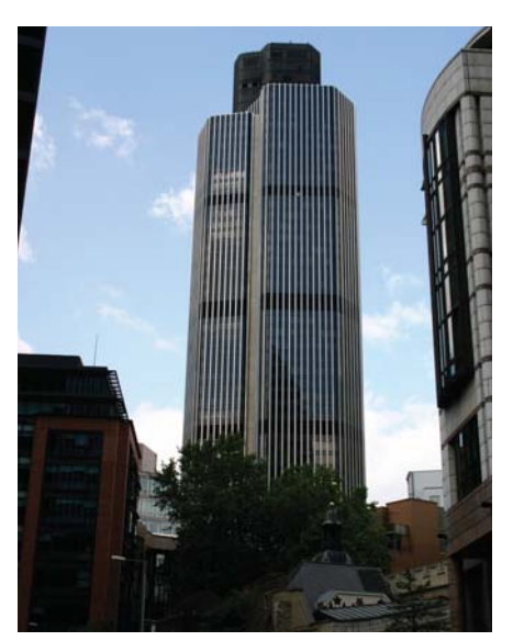
Figure 4. Tower 42, London.

The redevelopment of London in the postwar period was driven by County of London Plan 1951 which set floor-to-area ratios (FARs) with the aim of restraining the physical bulk of buildings and reducing congestion. In the City of London the ratios ranged from 2:1 to 5.5:1. While they limited the total floor space on a site, they did not control the form of development, and so did not restrict the height of buildings.