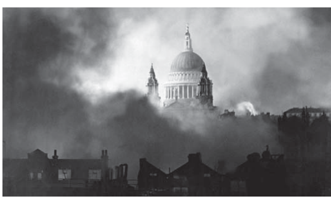
Figure 2. St. Paul's Cathedral after the German Blitz on December 29, 1940.