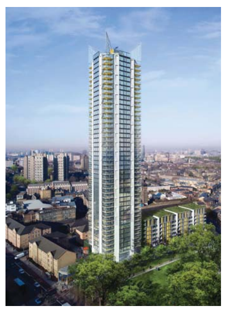
Figure 11. 360 London, Elephant and Castle. © Rogers Stirk Harbour and Partners

There is currently a new spate of taller buildings going through the planning system. This time they are largely residential. London's population is growing, and more than 30,000 new homes are required each year to cater to the increase in households. The limited supply of brownfield land in London, protection of the development-free green belt around the capital, and the London Plan's "compact city" policy that development for London should take place within the GLA boundaries, means that new residential development will have to be built at higher densities. Building tall is one way of achieving this. Although height is not an essential ingredient of higher densities, it can provide a greater sense of space than