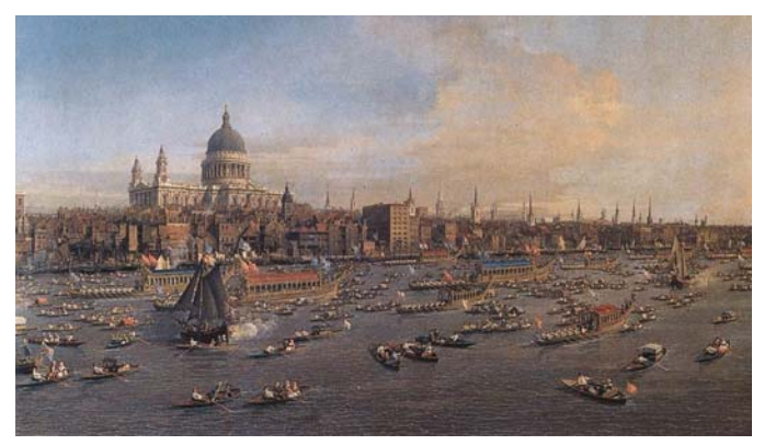
Figure 1. Canaletto's painting of River Thames with St. Paul's Cathedral in the background. © Canaletto

Until 1930 the height of buildings was controlled by the Building Acts and restricted