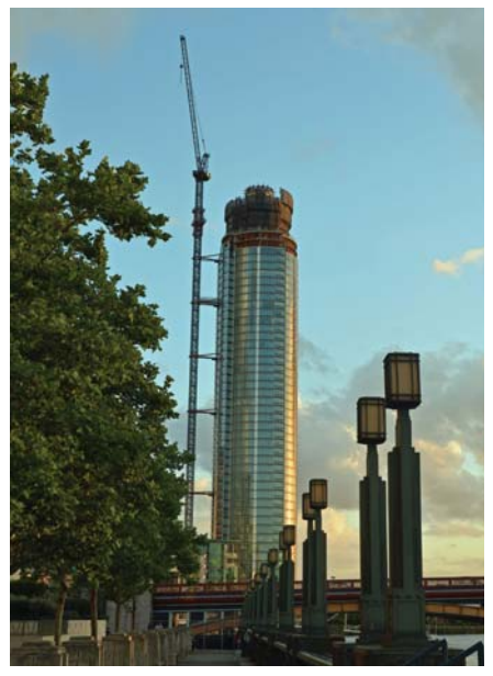
Figure 12. St. George Wharf Tower, Vauxhall.

In its true pragmatic tradition, London continues to respond to circumstance and to the market. Architects experienced in delivering residential projects in the Far East are in demand, because the market for high-end London residences often comes from Singapore and Hong Kong. Somehow it works. London has never been a coherent or tightly planned city; rather, it reflects a wide range of styles and periods. It is a patchwork, a fabric that accepts change and new