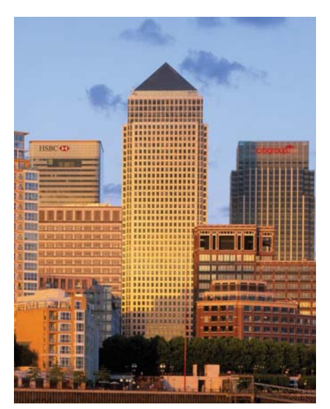
Figure 5. One Canada Square, London. © Pelli Clark Pelli

In the 1960s and 1970s some 2,000 tall buildings were built in the London area, the majority of them public housing projects erected as replacements for homes destroyed by German bombing in World War II, and as a response to national Government policies which aimed to build up to half a million new homes a year. Industrialized building systems were encouraged and local authorities were given subsidies to build high. The higher they went, the bigger the subsidy. The most economical height at the time was 22 stories. Thus, today views of London outside the central area are characterized by a generally low-rise city dotted with 22-story concrete blocks, many of them of questionable architectural quality.