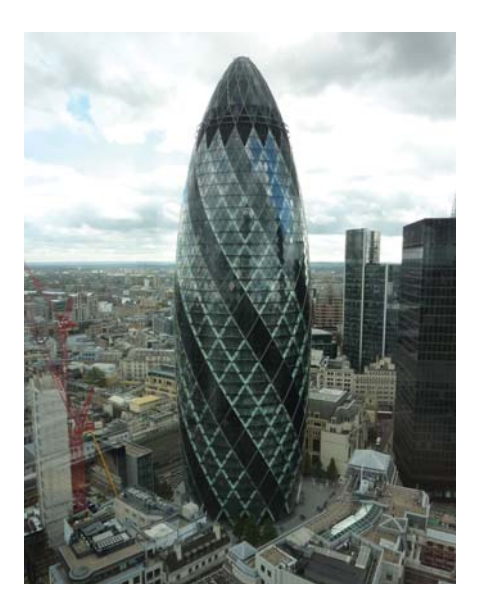
Figure 6. 30 St. Mary Axe, London.

rise of the heritage lobby and a public distaste for tall buildings, engendered by the concrete monstrosities of the post-war period, and partly because of the perilous state of the UK economy.