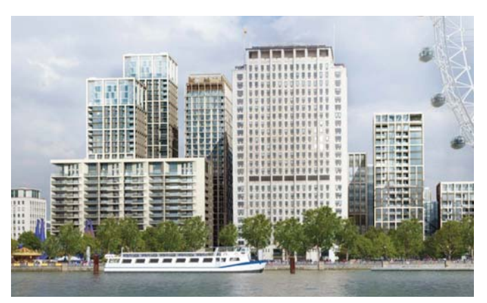
Figure 9. Shell Centre, London.