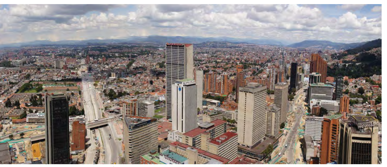
Figure 3. Downtown Bogotá in 2012.

and of financing. Currency risk and political uncertainty in Bogotá have resulted in a superfluously high interest rate environment that has precluded the development of skyscrapers in Bogotá for the past 35 years (see Figure 3). All of this has continued to take place despite the overwhelming demand for housing in downtown Bogotá. Skyscrapers, and hence, vertical densification and urban development, are not financeable through traditional means in Bogotá (i.e. bank financing). This is the reason crowdfunding was the only way to make the project happen in an effort to improve the city.