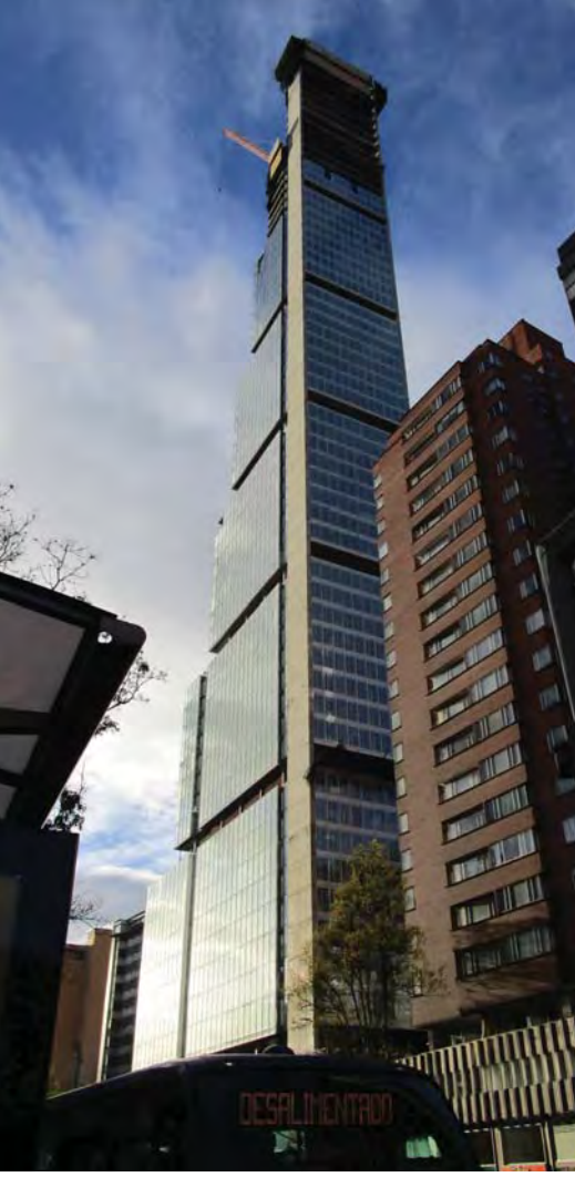
Figure 1. BD Bacatá in July 2015.

The challenges mentioned above highlight the main reasons we did BD Bacatá – it presented an opportunity to fix many of these problems through a simple solution: reduce the distance you travel to work. Basically, make your commute shorter.