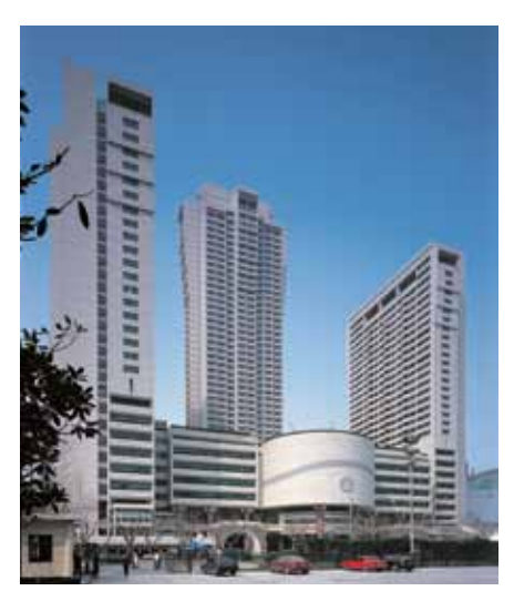
Figure 3. Shanghai Centre.