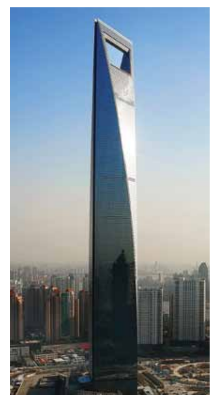
Figure 4. Shanghai World Financial Center.

Two new patterns emerged in this period that are worthy of more in-depth comment: regional clusters and different building