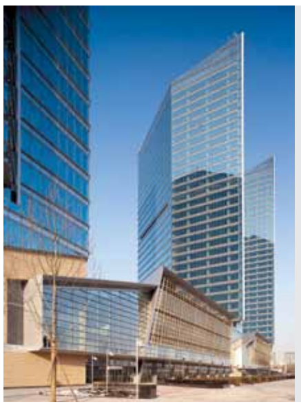
Figure 7. China Central Place Hotel, Beijing. © ECADI

During this period structural technology became more mature with the introduction of pure steel plate shear walls, steel supporting tubes, a tube-in-tube structure system, and a mega structure system. Steel - concrete composite structures became mainstream. For foundations, long pile and post-grouting techniques were used, along