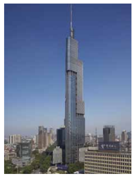
Figure 6. Zifeng Tower, Nanjing. © ECADI

The China Central Place in Beijing has more than 30 million square meters of space and cover more than one million square meters, including three super-5A intelligent office