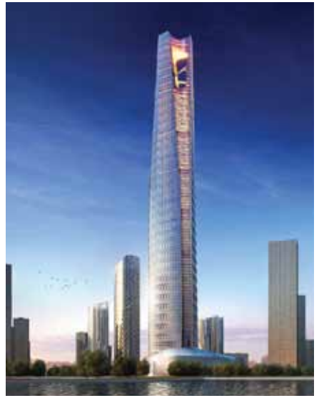
Figure 9. Dalian Greenland Center. © ECADI

66 Guided by commercial demands, urban infrastructure and intensive land uses, supertall buildings will further explore the new concept of a 'city in the sky.' 99