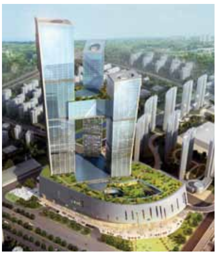
Figure 8. West Golden Eagle Plaza, Nanjing.

platform modular system and an automatic hydraulic climbing formwork system were used with other systems.