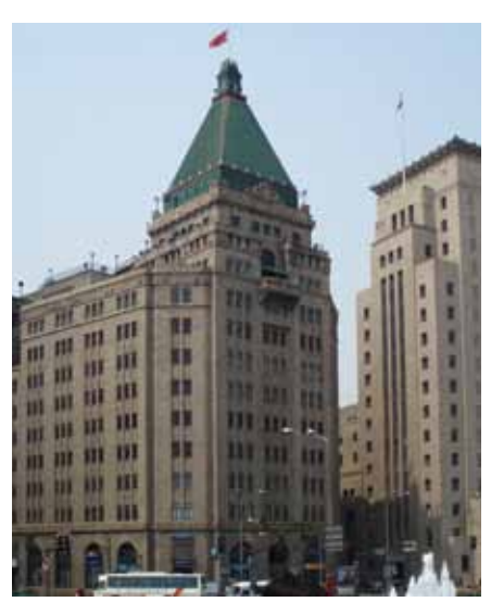
Figure 2. Fairmont Peace Hotel Shanghai.

Shanghai was the largest and most prosperous industrial and commercial city in China at this time. Shanghai was also the most developed construction region in China. The main construction projects included the Peace Hotel, also known as Sassoon House (see Figure 2). The 77-meter art deco building is topped by a pyramid, making it a distinctive part of the Bund. Built by Victor Sassoon, a member of the Sassoon banking family, it was the tallest building in China when it was completed in 1929. Today it is the Fairmont Peace Hotel Shanghai.