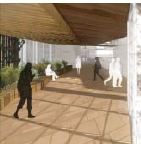
Figure 9. Cox Rayner's sky lobby view