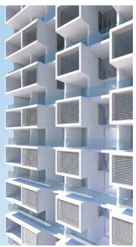
Figure 2. QUT Detail of articulated façade

humidity, but the effects of wind at upper levels of tall buildings can make crossventilation difficult and use of balconies uncomfortable.