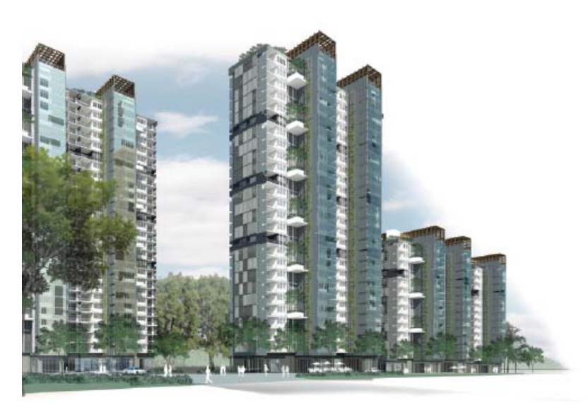
Figure 5. Cottee Parker's north facing towers © Cottee Parker Architects

Cox Rayner Architect's single-loaded tower over a podium introduces a significant conceptual departure with an external core, and an emphasis on integrated planting and water systems based on the theme not just a landscape, but an ecosystem (see Figures 8, 9, and 10). Apartments all face north, and the city-facing sky lobbies are re-imagined as \mathscr{P}