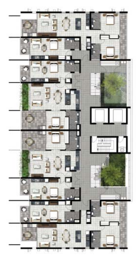
Figure 3. DBI's Typical part plan © DBI Design