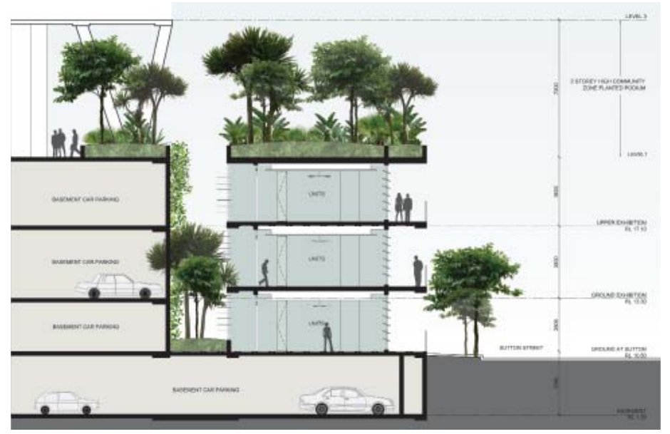
Figure 10. Street-facing apartments to podium edge

CO<sub>2</sub> emissions, are also implicated in significant long term cost imposition on occupants as the costs of energy rises inexorably. Residential tower developments are often procured through the investor marketing process. Thus, many occupants of high-rise apartment buildings are likely to be renters, and the lack of choice as to whether living costs can be kept down by choosing to control thermal comfort and ventilation through passive systems may become more and more influential on the feasibility of a tower development.