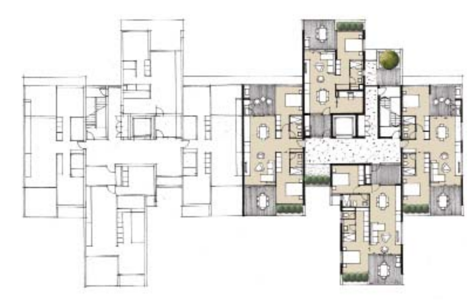
Figure 6. Cottee Parker's typical plan © Cottee Parker Architects