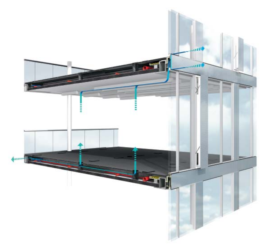
Figure 6. Integrated heating and cooling system inside the new office wings' floor slab

provided with full service climate control facilities. The floors of the new office wings have been rendered thermally active by means of a water network system that has been cast in the concrete slab components of the floors (see Figure 6). Through this network, the structure is kept at a constant temperature. In