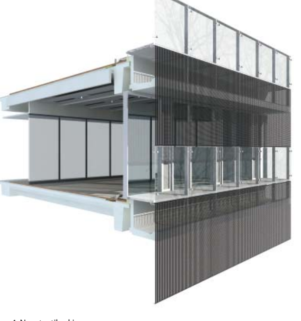
Figure 4. New textile skin

Four different climate zones have been developed in order to adjust the climate concept to the actual day-to-day use of the building. The offices and workspaces are