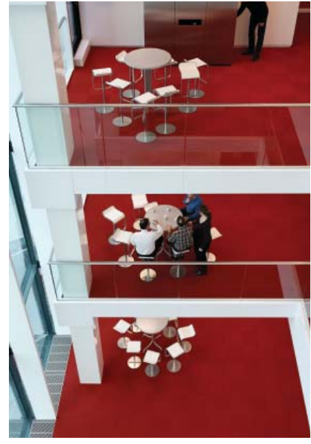
Figure 3. Newly created voids

open-weave fiber-glass textile. The soft turbulence behind the textile would neutralize the forces of the wind, so that the cavity between the textile and the thermal façade would be relatively tranquil and would enjoy a constant supply of fresh air. As a result, it S