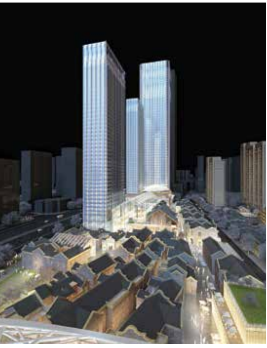
Figure 9. Suzhou Creek Ankang Yuan – showing the insertion of the towers into the lines established by older villas.

be a forward thinking, futuristic project that would also reveal, upon closer inspection, a wonderful cultural experience and stories from the past. The team conceived of a "secret garden" in the city that can provide an "upside-down" experience, in the sense that major anchors are placed underground, and "inside-out," bringing the old buildings' exterior architectural expression into the interior space as storefronts.