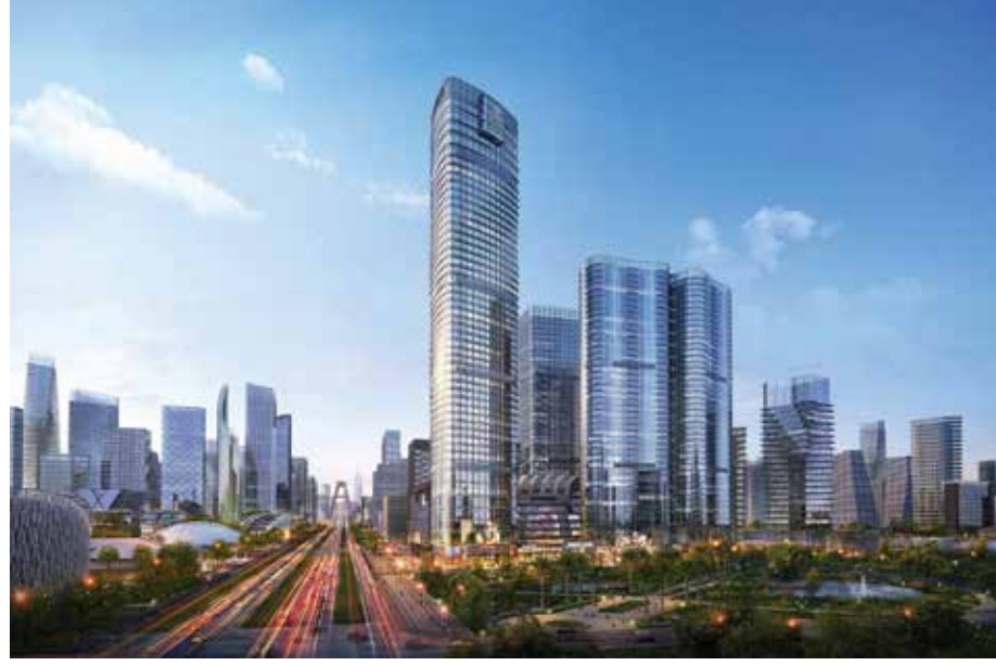
Figure 4. Chengdu Yintai Center – view from southwest.