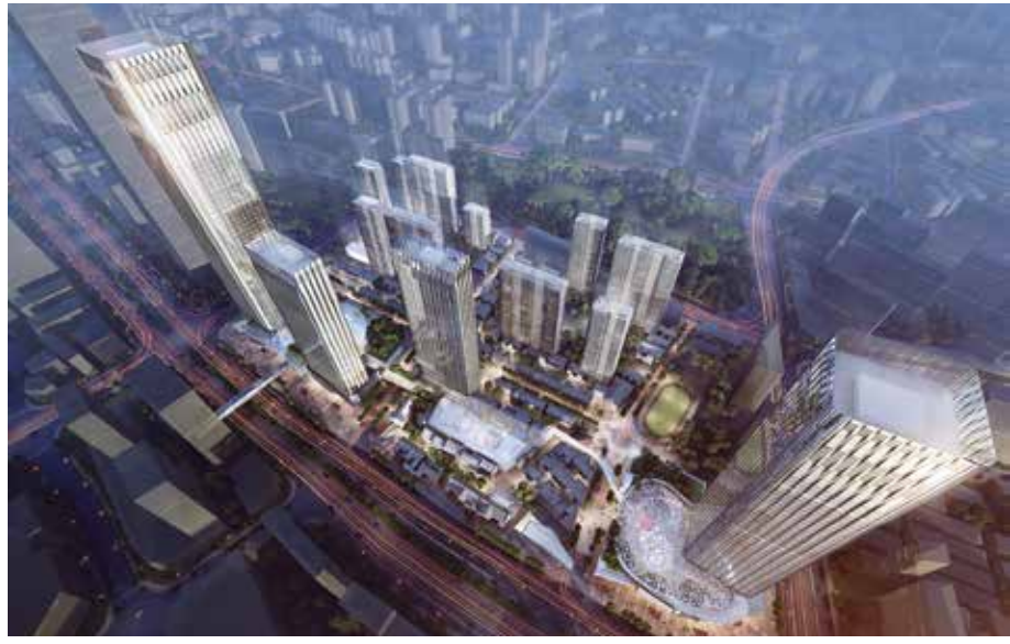
Figure 5. Suzhou Creek Ankang Yuan, Shanghai.

Like the others, this project also has a large-scale retail component: a 150,000-square-meter retail shopping area. As with the other project examples, the retail planning comes first, albeit with an additional set of preservation considerations. Here, it was not a simple case of finding the best frontage for the retail project. Instead, the negative impact a big retail podium mass would have on old villa buildings had to be reduced. The project also needed to fully utilize available space for its underground retail area, for this would not be counted against the total FAR limit. As a result, two small roads separate the three parcels along Haining Road, breaking up the mass of the project.