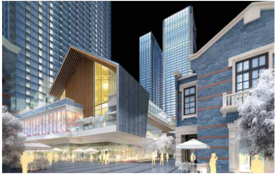
Figure 13. Suzhou Creek Ankang Yuan – contemporary designs and preserved historic buildings mesh at a human scale against a backdrop of sleek new towers.