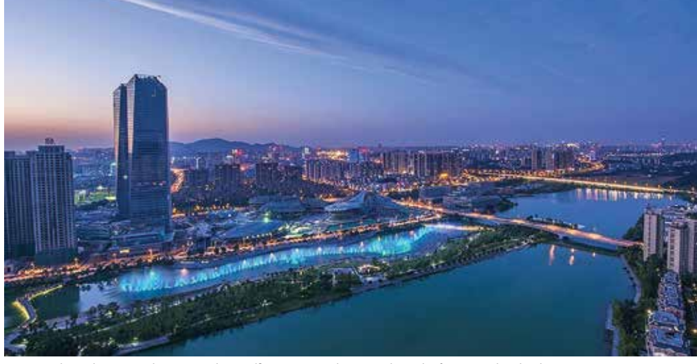
Figure 2. Changsha Meixi Lake Jinmao Plaza's office towers, with Meixi Lake in the foreground and Culture Center to the right.

While the two preceding projects reflect new-build conditions and thus the