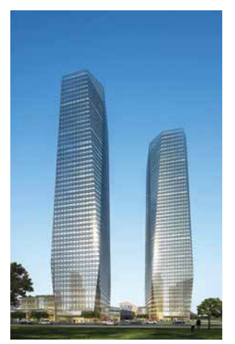
Figure 10. The final positioning of the Jinmao Plaza towers was the result of extensive site study and negotiation.

Often in the project's early planning stages, the regulations and planning requirements