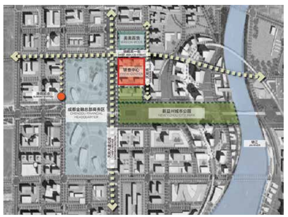
Figure 3. Chengdu Yintai Center, Chengdu – location map and circulation connections.