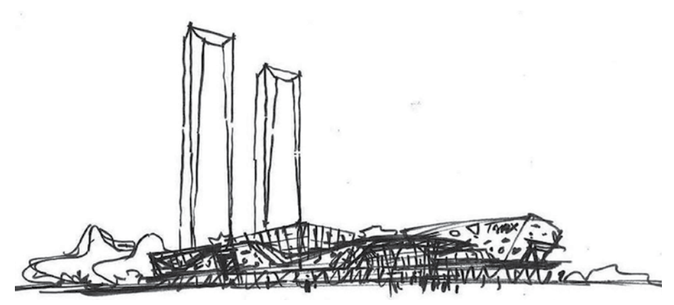
Figure 7. Meixi Lake Jinmao Plaza, Changsha – conceptual "sand crystal" drawing.

Figure 6. Suzhou Creek Ankang Yuan, Shanghai.