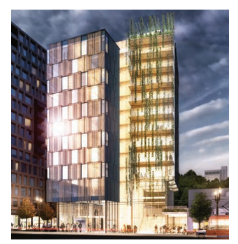
Figure 11. Framework, Portland. © LEVER Architecture

In contrast, existing European buildings such as Sweden's Limnologen in Växjö and Strandparken in Stockholm; and the US project Framework in Portland use systems of cross-laminated timber (CLT) shear walls in conjunction with continuous steel ties (see Figures 9, 10, and 11) (Robinson et al 2016). These ties thus form the primary tension force path of the lateral load resisting systems; thus, these are timber-steel composites. The Strandparken and Framework buildings are therefore considered to be timber-steel composite buildings under this classification