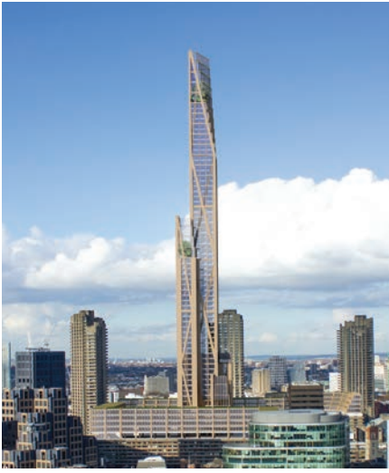
Figure 4. Oakwood Tower, London. © PLP Architecture