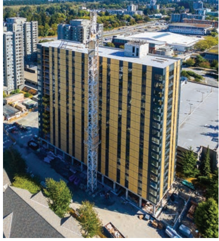
Figure 2. TallWood at Brock Commons, Vancouver. © Acton Ostry Architects & University of British Columbia

The opportunities for better, more sustainable tall buildings afforded by new materials, new construction technologies and new architectural forms bring with them a range of