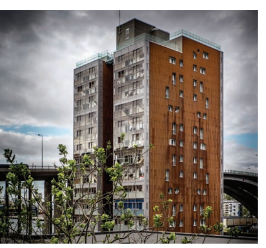
Figure 6. Treet, Bergen.

Definitions of height are objective and are largely independent of context, provided