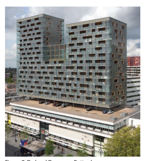
Figure 7. De karel Doorman, Rotterdam.

The difference between the height to architectural top and the highest occupied floor can impede meaningful comparison between buildings. The measurement to the highest occupied floor or "net height" is of greatest practical interest for tall buildings in terms of their utility, and thus the measure of greatest interest for meaningful comparison. Although a net height of approximately 14 stories or 50 meters is indicated by the CTBUH criteria as a