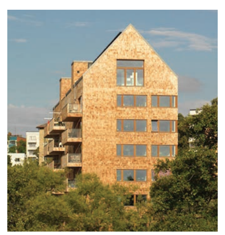
Figure 10. Strandparken, Stockholm.

As with any attempt at systematic categorization, some examples will present challenges. Rather than looking to the extrema, the authors have adopted the maxim that "... hard cases make bad law" (Shapiro 2006). Therefore, categorization has been carried out with reference to the basic principles discussed above, rather than introducing an ever-more complex system of classification.