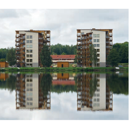
Figure 9. Limnologen, Växjö. © Arkitektbolaget Kronoberg AB

which a single function occupies 85% or more of the building height or floor area. Adopting this approach for building material, a "single-material building" might be taken to be a building in which a single-material structure occupies 85% or more of the building height or floor area. This provides a sensible compromise between accuracy and simplicity, and is consistent with the commonly encountered case of buildings having a change in structural arrangement associated with a change in function after the first few stories.