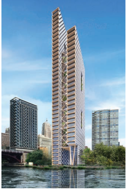
Figure 3. River Beech Tower, Chicago. © Perkins + Will

Height relative to context acknowledges that a building's surroundings play an important part in assessments of tallness. A 14-story residential building sited in a suburban neighborhood might be described as tall, while the same building situated in a high-rise cityscape might not be.