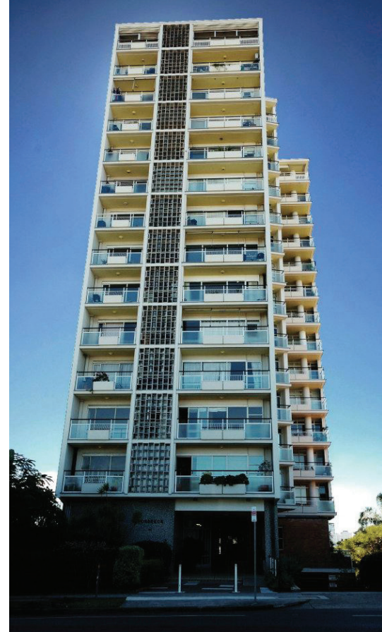
Figure 2. Case 16: Torbreck, Brisbane (Job and Froud Architects, 1961).

The city's Multiple Dwelling Code (MDC) (BCC 2014) calls for "development that ensures an attractive streetscape interface that contributes to Brisbane's character and identity, high-quality subtropical streetscapes and public space network" and "a high level of amenity for occupants and adjoining residents, including access to sunlight and breeze to support outdoor subtropical living." The MDC's inventory of 53 performance outcomes (POs) and extent of detail indicate that these are significant aspects for citywide outcomes. Twenty-one POs are directly relevant to the impact on streetscapes; most are concerned with amenity, aesthetics, and climate-responsive architecture. All are accompanied by acceptable outcomes (AOs) that provide numerous and detailed metrics, some which refer to diagrams for further guidance. Prescriptive requirements regarding parking