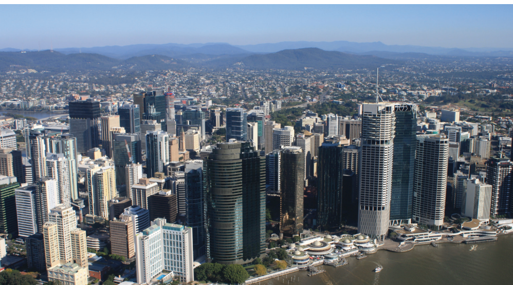
Figure 1. Brisbane's transformation from low-density single-family homes to high-rise apartment living is underway. Apartment towers and office buildings are indistinguishable from each other in the city's new skyline.

Brisbane is also a low-density car-dependent city. In 2002, during its corporate visioning process, Brisbane City Council (BCC) differentiated the city's identity with the aspirational value "city designed for subtropical living" to clearly link sustainable city planning with climate-based urban design and architecture. The strategy underpinned policies to encourage urban consolidation and keep urban sprawl in check as the population grew. The urban context would be framed by buildings and subtropical vegetation working together to support the city's transformation from car-oriented to a denser, more sustainable, pedestrian-oriented urban form. These values have now been embedded in the