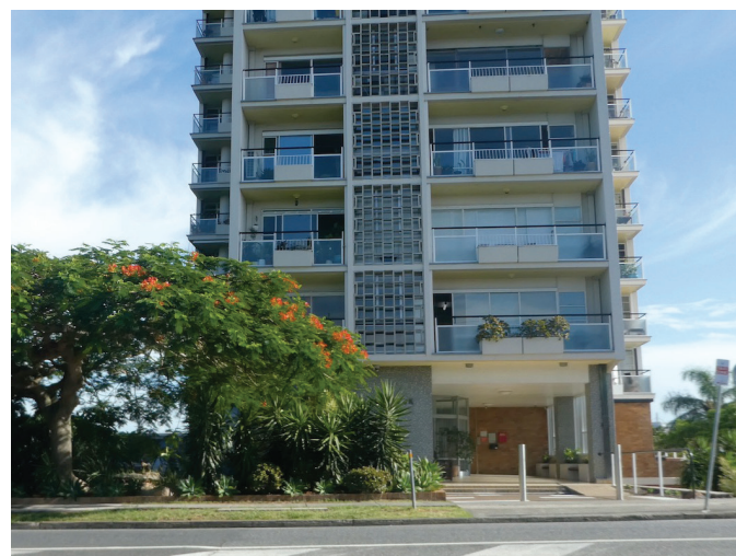
Figure 4. A shade tree spreads out in front of Torbreck's Dornoch Terrace frontage.

metrics for both streetscapes and dwellings used in this analysis, and compares the desired design characteristics of the climate-responsive approach for streetscapes and dwellings with emerging development outcomes. Currently, not all new residential and mixed-use developments are achieving the expected standards. Some cases demonstrated high-quality street interface, yet performed less well as towers for subtropical living. Others showed some climate-responsive formal credentials in the towers and individual dwellings, yet did little to enhance the quality of the subtropical public realm. The historic case (Torbreck, Case 16) was exemplary and set a benchmark for both climate-responsive dwellings and street interface.