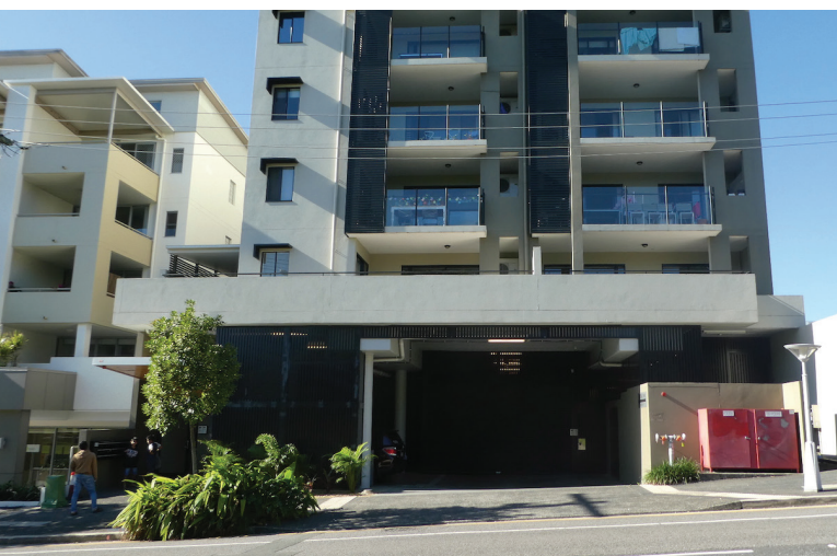
Figure 3. Case 9: Utilities and driveways create voids in the streetscape.