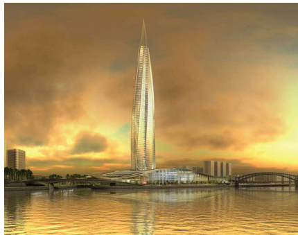
Okhta Center © RMJM

discussion. By nature, achieving general consensus is impossible, especially when it comes to issues of high-rise developments in the buffer zones of historical cities.