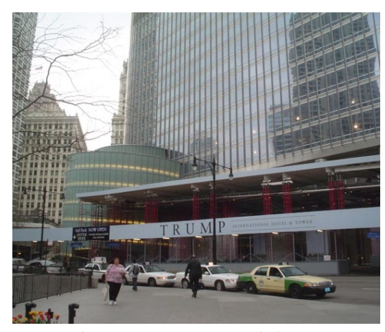
Figure 1. Hotel entry at Trump Tower on upper Wabash

tower. Building the first, then the second or third can be described as Vertical Expansion. While the concepts are the same as other master planned projects, the construction takes place within one structure as opposed to many structures within the same site. Some examples include: