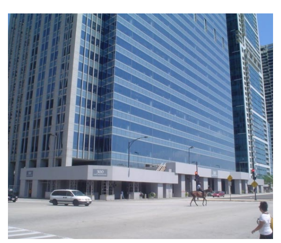
Figure 5. Blue Cross Blue Shield entry canopy on upper Randolph

5. Utility connections by the contractor cannot interrupt tenants utilities. Each use is separated so that one, under construction, does not affect another that is