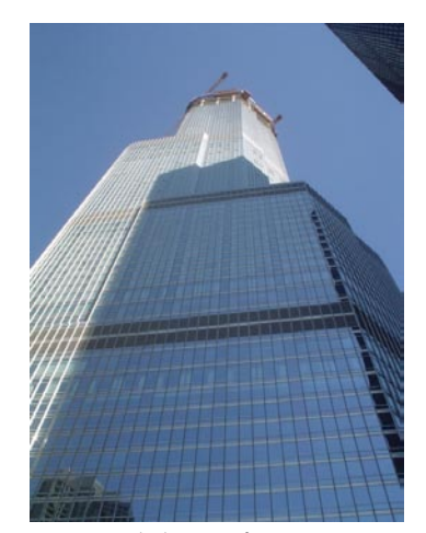
Figure 2. North elevation of Trump Tower over hotel entry

Large-scale multi-use Tall Buildings are complicated structures involving an army of stakeholders. They require vast resources, multi-year planning and multi-year construction scheduling. Besides the large quantities of materials required for construction, financing a project of this magnitude is a major accomplishment. Many risks are inherent in any construction project.