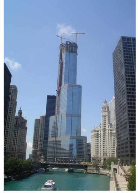
Figure 9. East and south elevations of Trump Tower during construction

6. Neighbors can also influence the project. Construction projects always affect the neighbors. Height limits, obstructing established views, and unwanted construction traffic are all neighborhood