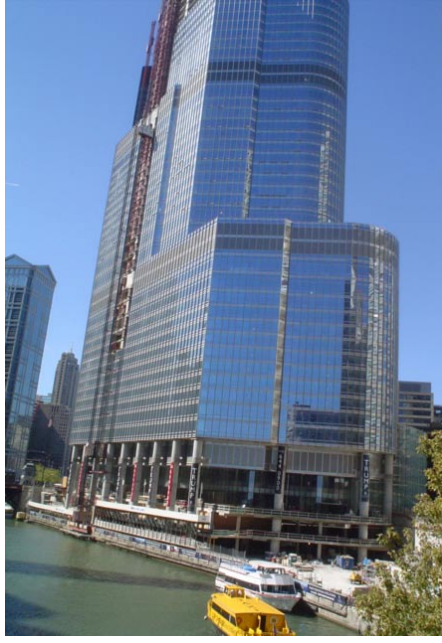
Figure 7. South crane and construction elevator of Trump Tower with lower Wabash access

1. Safety of the tenants as the construction work proceeds. Whether this includes additional netting or barricades around the work platforms, the safety of the occupants is paramount. Any construction accident can affect the overall project, especially if a tenant is hurt. Enforcing safe procedures,