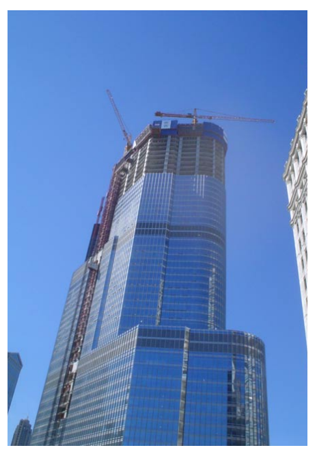
Figure 8. Trump Tower south elevation crane and construction elevator access