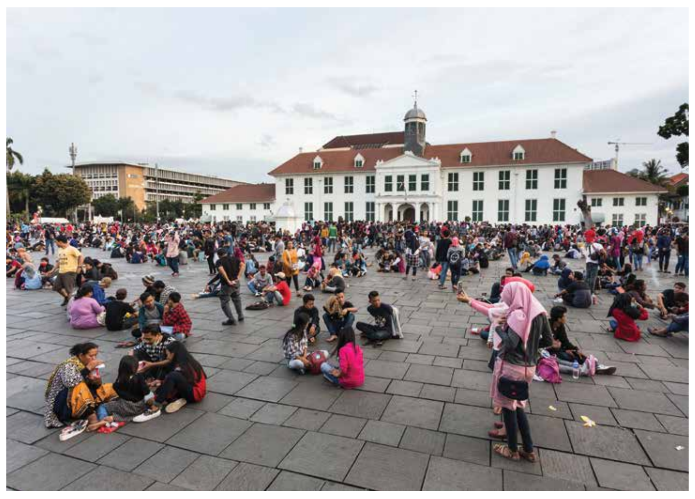
Figure 11. Fatahillah Square, historical center of the old Batavia.

air-conditioning condensation water will be recycled through the building and further cleanse the river water. Ultimately the ground plane of the Pertamina Headquarters and the river become one co-beneficial system.