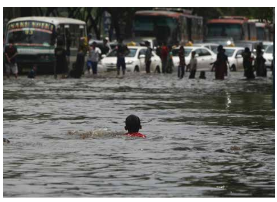
Figure 1. Urban flooding is a persistent problem in Jakarta.

As the population continues to grow, unchecked development has meant the decrease of upland forest