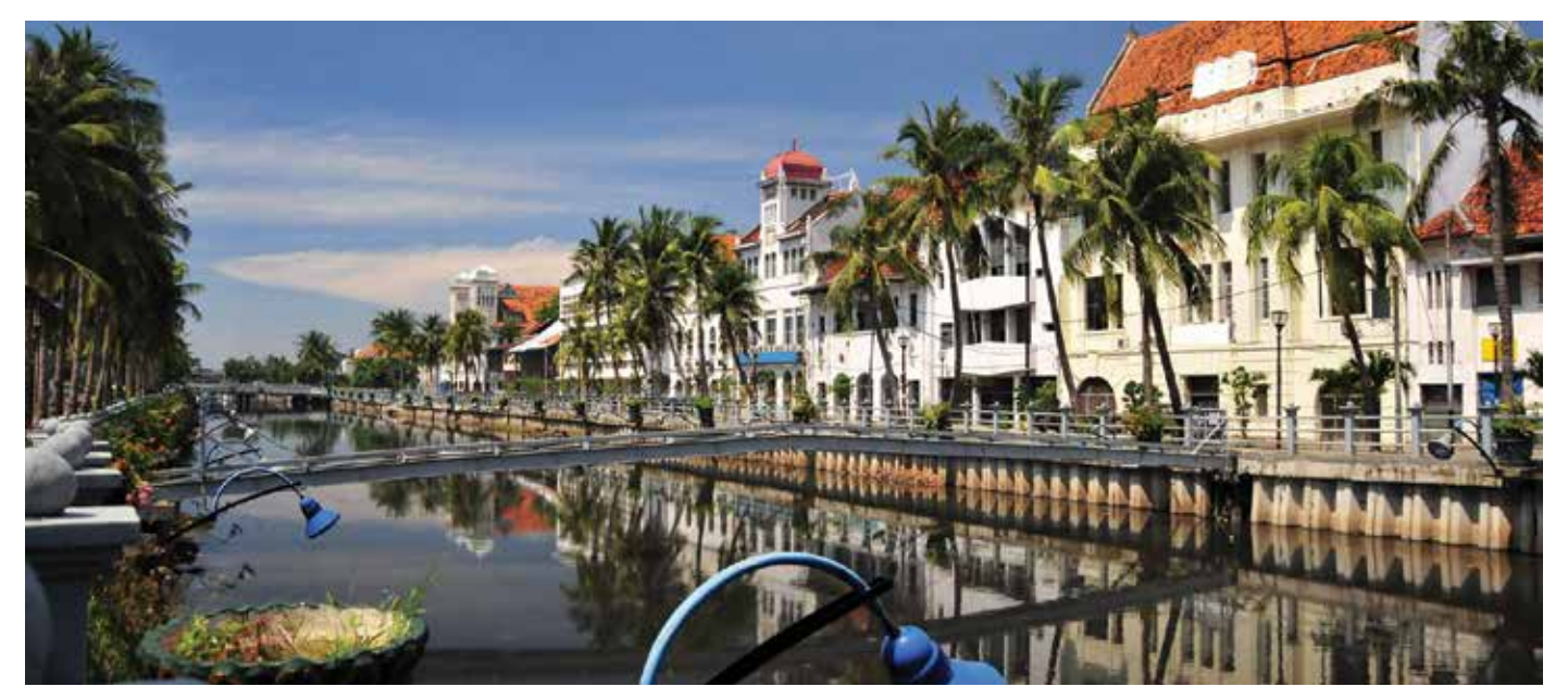
Figure 6. Waterways along Ciliwung River.