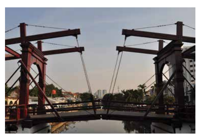
Figure 9. Kota Intan bridge along Ciliwung in Kota Tua (old town).

straight into canals and rivers, flows can aggregate across sites to form successively larger drainage ways. The water will then run through a series of low-impact development (LID) storm water management facilities, green streets, and wetlands, then into larger treatment areas before being discharged into the rivers.