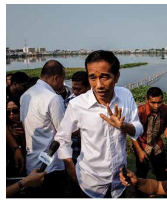
Figure 2. Indonesia president Joko Widodo.