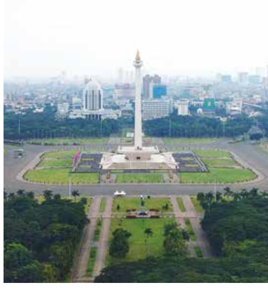
Figure 4. National monument Monas in Merdeka Square, © Healza Kurnia Hendiastutiik / EveEm