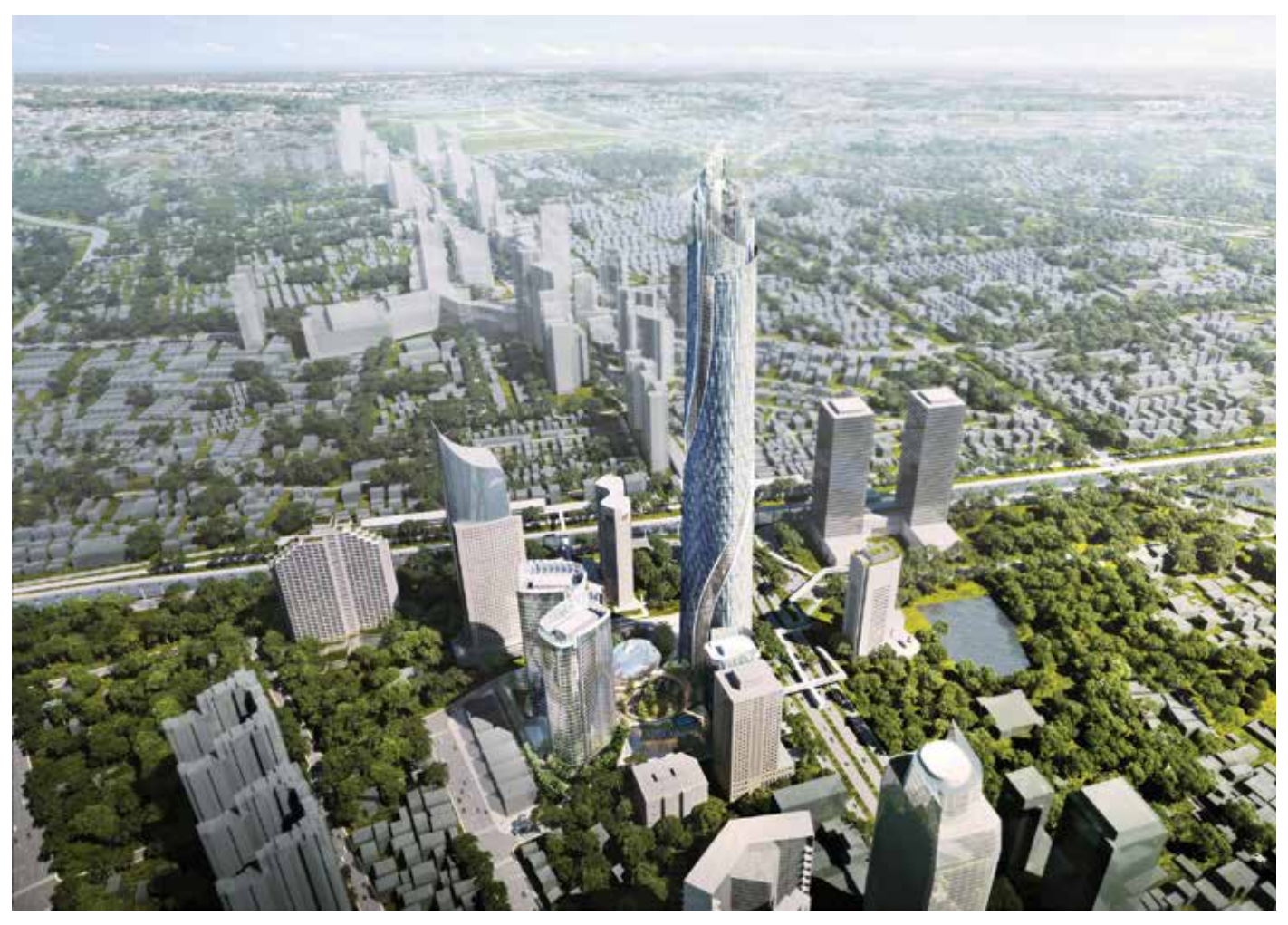
Figure 12. Menara Taspen project aerial rendering. © Woods Bagot

The Menara Taspen/BUMN City strategy entails a landscaped hub, which will become the exemplar for a transit-first, dense urban development (see Figure 12). This government-endorsed strategy represents the best of Jakarta through world-class design and first-rate public space, whereby the development becomes the center of civic and cultural activity in Jakarta.