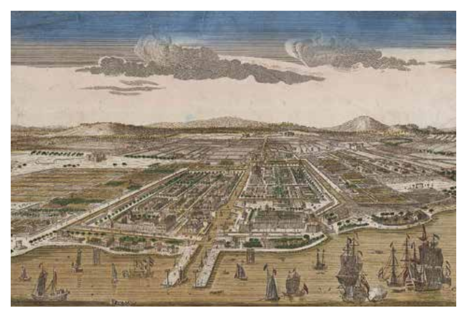
Figure 3. Historical Jakarta (then called Batavia) circa 1780.