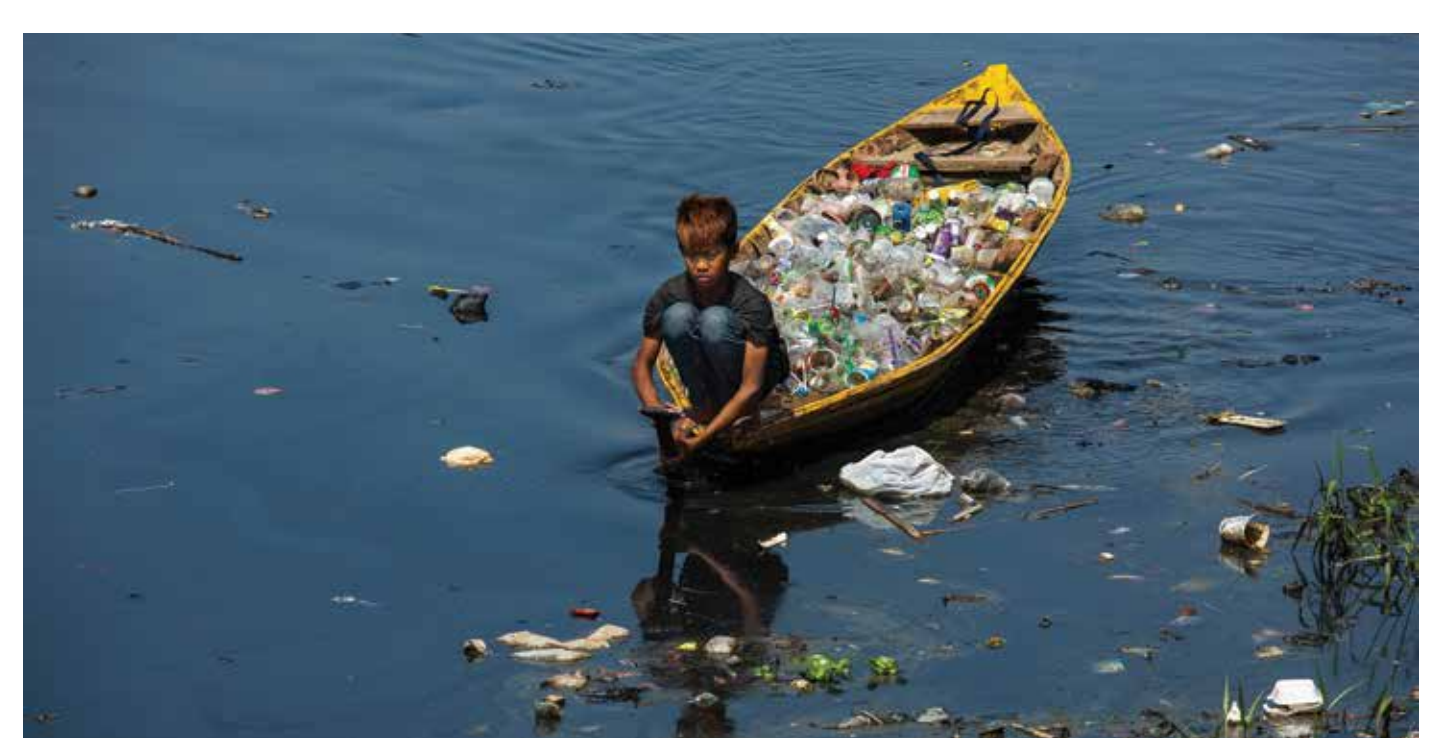
Figure 7. Pollution in waterways.

of wetlands and blueways would be introduced throughout the city to capture, filter, and return water to the aquifer or above-ground water channels.