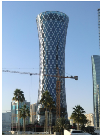
Figure 6. Tornado Tower.