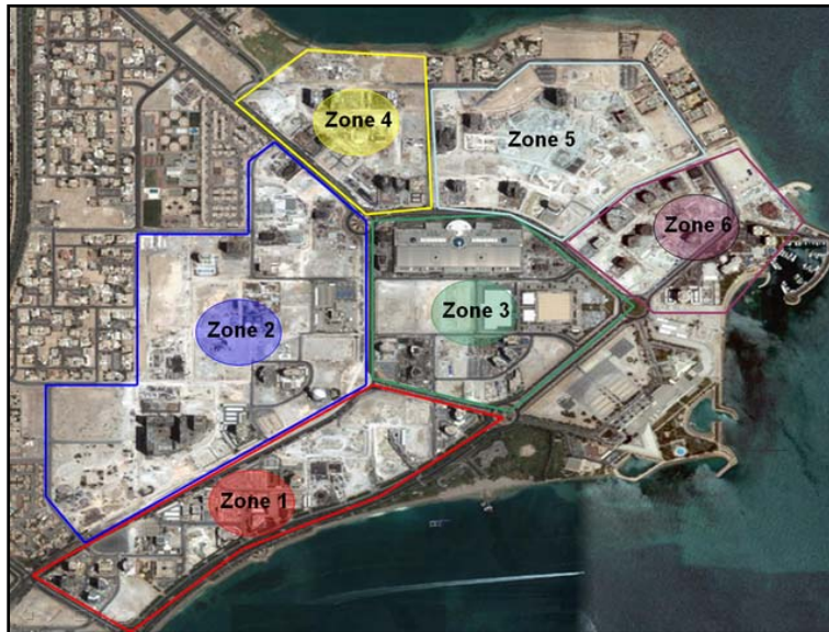
Figure 4. Location of West Bay towers, Qatar