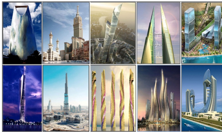
Figure 1. GCC Tall buildings.