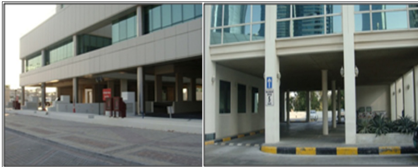
Figure 8. Commercial Bank Entrance.