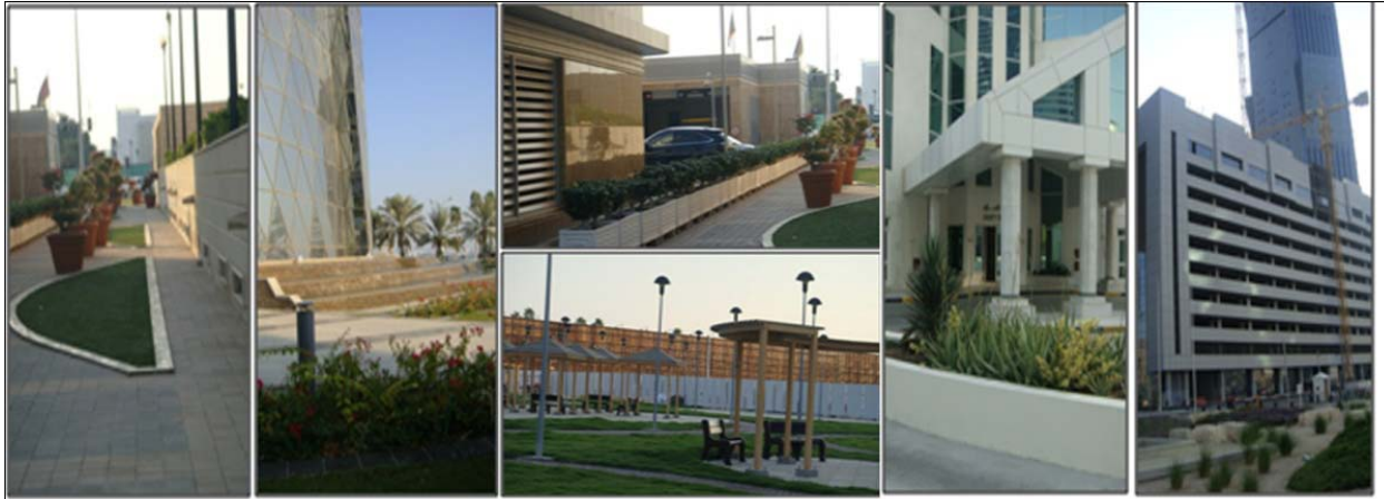
Figure 9. Commercial Bank entrance.

Types of shading devices attached to the exterior envelop of buildings include projected porch entrance, external detached canopy, and external building skin working as a shading device. It has been noticed that some towers use a projected porch to provide shading and define the main entrance of the building; such as Al-Nasir Twin Towers, Barzan Tower, Al-Bida Tower, and Al-Mirqab and Al-Salam Twin Towers. On the other hand, some towers have an external canopy that allows for more interaction on the urban scale, such as Barzan Tower and Al-Zaji Tower. As for the rest of the towers, there was no consideration for the usage of shading devices, such as Tornado and Palms Towers. The urban and landscape connectivity between towers is observed in several towers, such as the Commercial Bank, Al-Jazi Tower, Al-Bida Tower, Al-Mirqab and Al-Salam Twin Towers, Tornado Tower, Palms Towers, where landscaped green areas allow a degree of interaction as well as connectivity to each other. (Figure 9)