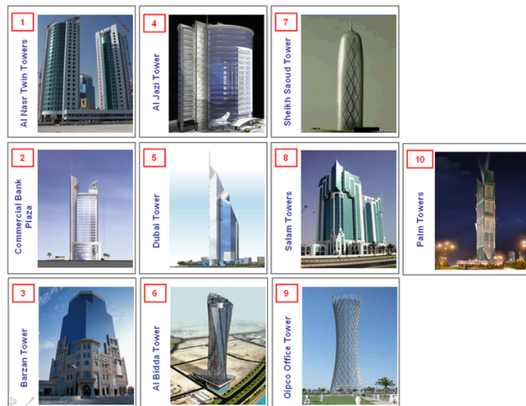
Figure 5. West Bay Zone 1 towers.