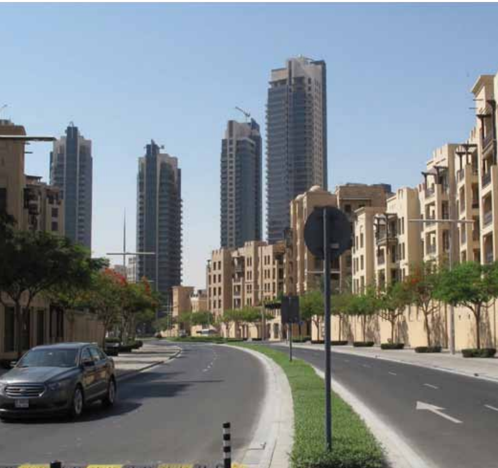
Left: A view of the main boulevard in Downtown Dubai separating the Old Town and Souq Al Bahar developments.