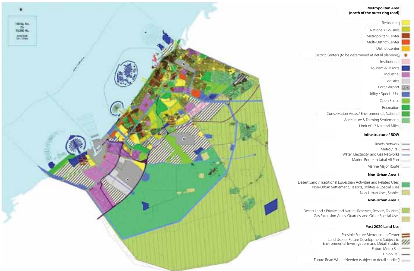
Dubai Masterplan 2020

million tourists each year, and is expected to rise to 20 million in the year 2020. The socio-cultural composition is an array of over 100 nationalities with various lifestyles, religions, and ethnic backgrounds.