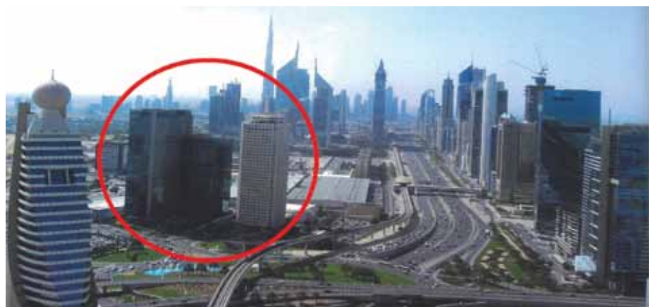
Opposite Top: Dubai skyline 1940. Source: Dubai Municipality Opposite Bottom: Dubai skyline 1950. Source: Dubai Municipality Top: Dubai Skyline 1970. Source: Dubai Municipality Bottom: Dubai Skyline in 2011 with developments from 1970 circled in red. Source: Dubai Municipality