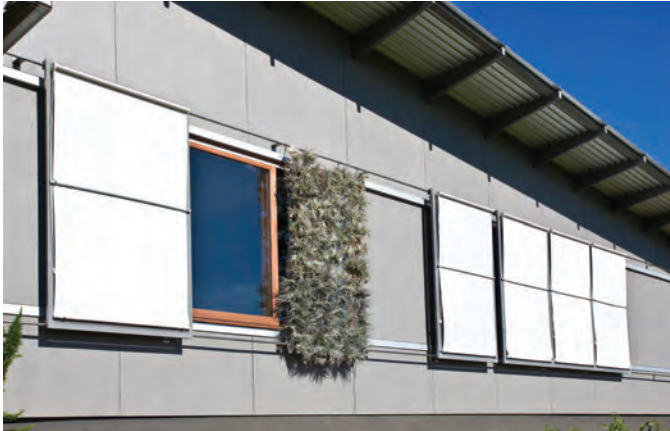
Figure 9. Example of Tillandsia screen.