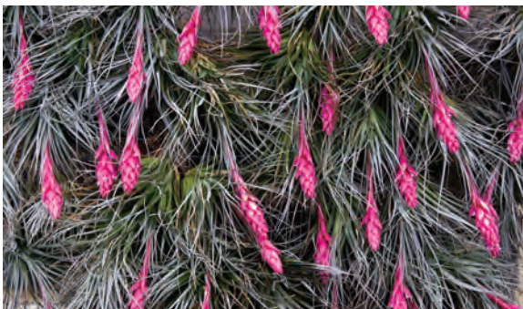
Figure 2. Tillandsias , the "air plants" chosen for the experiment.

Based on previous installations, the weight of a Tillandsia screen is estimated to be 3 kg/m 2 , which is minimal in comparison to adaptive systems that require plant growth substrates and supporting structures. The light weight of Tillandsia means they are perfectly suited for use on screens (Pérez 2011) and can be placed in arbitrary shapes on the building