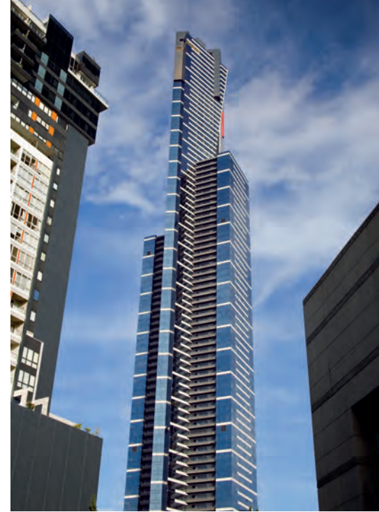
Figure 1. Eureka Tower, Melbourne.

One adaptation of Tillandsias to the epiphytic life-mode is the modification of the role of the roots from that of moisture and nutrient absorption to that of "hold-fasts" that function only to attach the plant to the substrate (Benzing 1990). The leaves of the plant replace the role of the roots and sequester moisture and nutrients directly from the atmosphere,