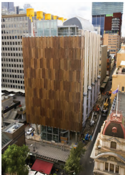
Figure 5. CH2, Melbourne.

Buildings within the urban environment are essentially pieces of refined geology, so when endeavouring to integrate plants into high-rise buildings, one must first observe plants that inhabit similar hostile environments in nature. Basically, buildings are high vertical cliffs of rock with no humus, often no water retention, and extreme temperature changes, which is the type of environment to which some species of Tillandsia have adapted and thrive in. Plants on tall buildings are subjected to high wind speeds and limited soil volumes, which places great pressure on irrigation systems to provide water to counteract transpirational losses. Such demanding ecophysiological environments mean that, for some plant species, no matter how much water is provided to the root system, they are simply not able to uptake water at the rate of transpiration. For adaptive systems the functioning of the irrigation is critical, and there have been high-profile cases of green walls dramatically failing (Klettner 2009). The advantage of selective systems is that they are insulated from this threat.