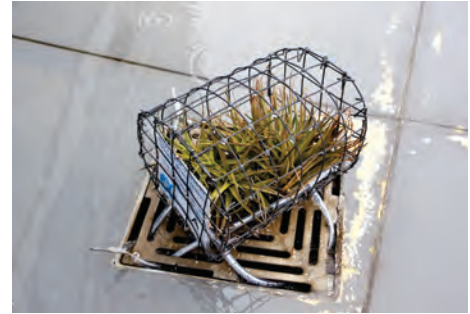
Figure 3. Tillandsia plant cages installed at Eureka Tower.

exterior (Wang et al. 2011). Plant screens have demonstrated effectiveness as passive energy-saving systems (Pérez 2011).