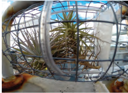
Figure 4. The Tillandsias at Level 92 of Eureka Tower on May 20, 2015. Pups can be seen on the rightmost plant.