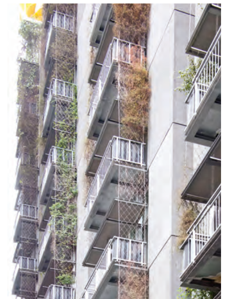
Figure 7. CH2 north façade in February 2015 shows the climbers with less growth than in 2011.

After 13 months, the growth habit of the plants had changed. They were more compact in structure, with shorter, harder leaves, and more silver in color due to increased levels of trichomes. However, pup production was more prolific, with seven or eight per plant, many more than in a less stressful location, where pup production