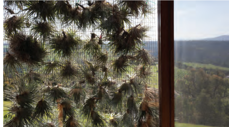
Figure 10. View from inside of experimental movable living Tillandsia plant screens.

Tillandsia screens (see Figures 9 and 10) could be: