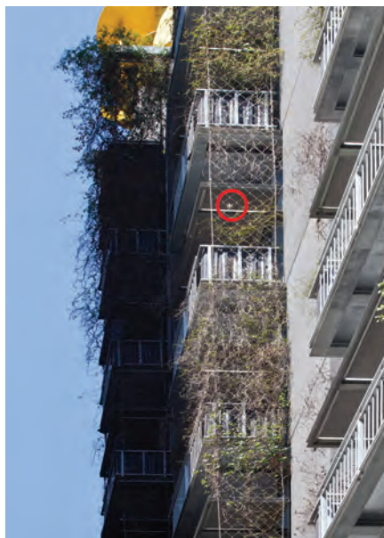
Figure 6. CH2 north façade in 2011. The location of the Tillandsia is marked with the red circle. Note the inconsistent growth of the climbing plants.

In 2011, the opportunity arose to stage a demonstration of the Tillandsia in a vertical urban condition. Collaborating with Ralph Webster, senior architect of the Melbourne City Council, the opportunity came to experiment with a few air plants in a demanding location on the new CH2 building located at 240 Little Collins Street (see Figures 5, 6, and 7). Existing climbing plants had struggled to thrive along the north wall, which is subject to very hot, dry winds, with the wind tunnel effect of a narrow alley exacerbating the dehydration. After 18 months, the Tillandsias proved that, while they grew slowly, they could thrive solely on their adaptive biological systems, requiring no soil