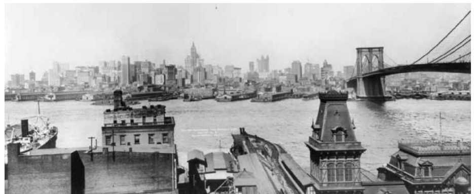
Figure 1. A 1911 view of Manhattan's skyscrapers looking west from Brooklyn. While the waterfront was full of active piers, much of the high-rise development was inland.

Manhattan's streetscape has been punctuated with tall buildings since the late 1880's. A time when the waterfront was an active port, the Brooklyn Bridge was just opened, and the Statue of Liberty began greeting immigrants as they sailed to the City through the Upper Bay. The towers were built near the center of the island (see Figure 1) – far from its bustling docks; and used the latest innovations in structural and mechanical system design. After more than a hundred twenty-five years of growth, the City today is radically changed. No longer a major port, still a hub of commerce, the skyline is the icon that defines Manhattan, and waterfronts throughout the City's boroughs are the focus of new development. Buildings and infrastructure confront different risks and take on new responsibilities in an era where sea level rise and storm surges influence habitation at the water's edge. Now, the challenges posed by high-rise development in New York City are not primarily structural, instead they are functional and economic.