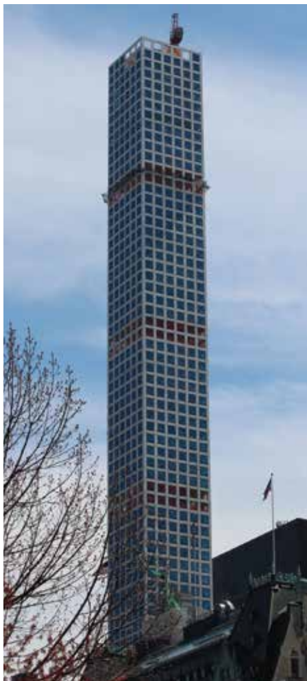
Figure 10. 432 Park Avenue includes 12-story clusters of apartments, separated by mechanical floors that act as gaps to reduce the wind pressure on the building.

runs of ductwork and piping, leaving more room for occupiable floor space. Other space on these intermittent floors could be multi-purpose: providing opportunities for integrating amenity and green space, energy generation with wind turbines or solar panels, and interconnectivity or bridging points between towers in the case of a fire or flood that limits ground-level ingress and egress. Inevitably, some waterfront towers will have to radically engage their sites to address sea level rise and storm surge levels, which will rise as well. If buildings have to adapt to change, let's build that flexibility into them from the beginning.