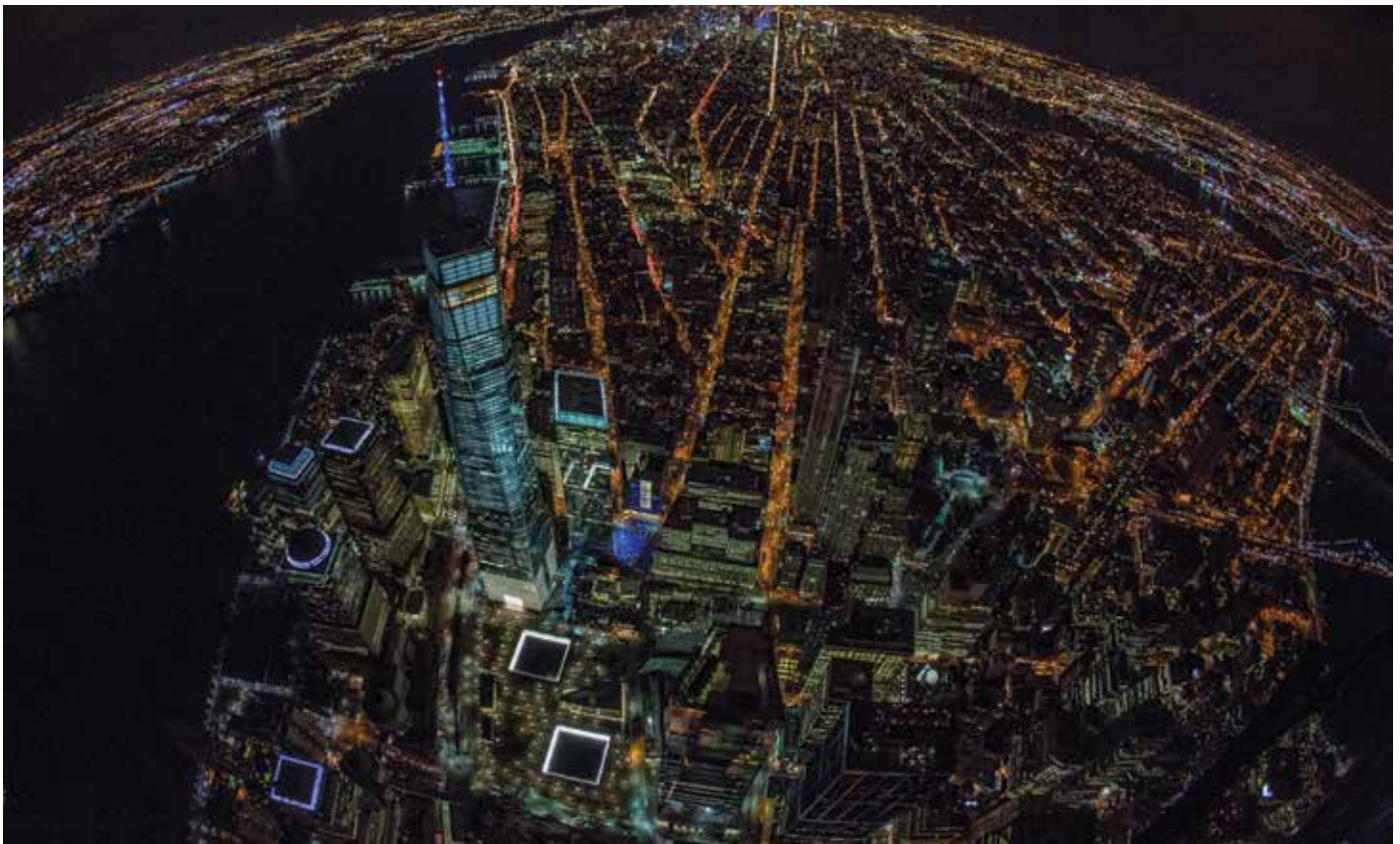
Figure 8. A night view looking north from Lower Manhattan. A large portion of this photo experienced extended utility outages during Hurricane Sandy.

Urban Green's Study, "Baby It's Cold Inside", looked at utility outages impact on New York City's residential buildings, and the results show that the performance of all-glass high-rise buildings is significantly less beneficial to sheltering-in-place during an outage than the traditional, brick high-rise skyscraper typology. However, creating a high-performance building solution by bettering the thermal resistance of the envelope, reducing solar heat gain and visible light transmission, providing less conductive envelope assemblies,