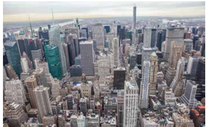
Figure 5. A view of Midtown looking north toward 432 Park Avenue. Many of these structures have potential for efficiency upgrades and repositioning.