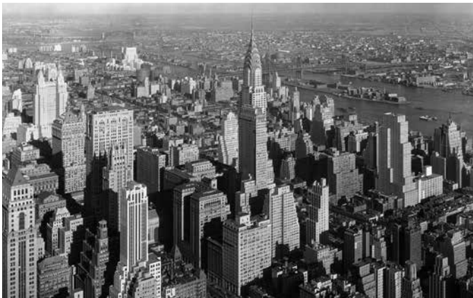
Figure 3. The Chrysler Building (photo center) has the world's tallest brick façade and operable windows, emblematic of commercial buildings in the first half of the 20th century.