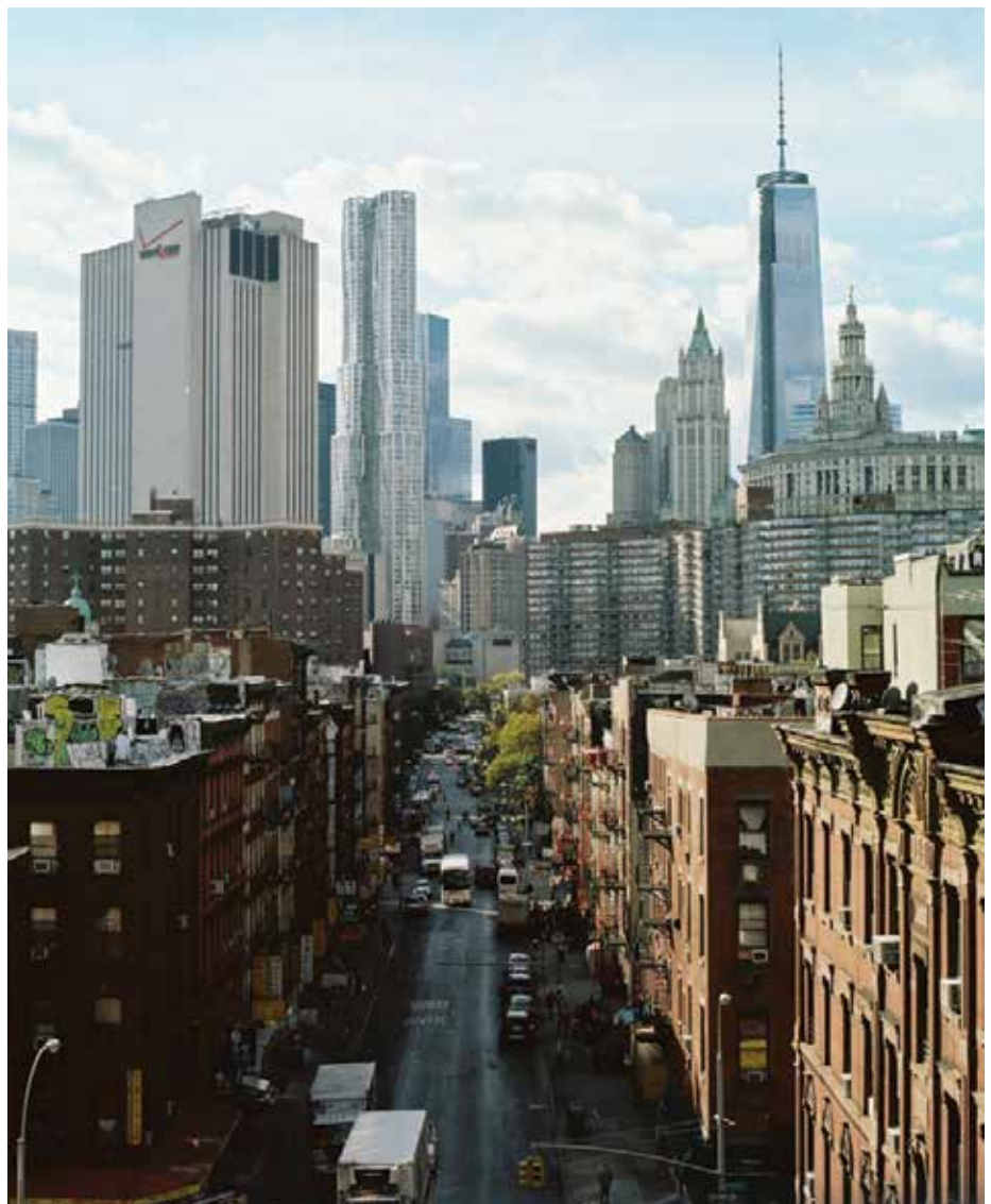
Figure 2. This 2013 view of Lower Manhattan from the Manhattan Bridge Walkway looks over an area which may partially flood in a major storm. The waterfront edges of New York's boroughs are susceptible to 100-year floods and increasing frequency of storm surges.

Where sustainability innovation in New York skyscraper typology is happening, it's often been driven by mandates. Battery Park City's dozen LEED-rated buildings likely would