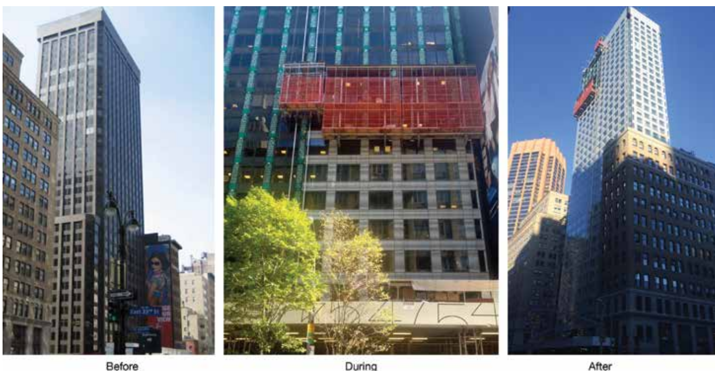
Figure 6. Views before, during and after construction of an over-clad renovation at 475 Park Avenue South.

When initiating a new construction or significant renovation project, the developers are in the driver's seat. They have an opportunity to establish the proposed program and project goals, and to hire the design team that will execute their vision. To capitalize on this opportunity and engage a more informed design process, they should incorporate assistance from specialty consultants with building envelope and sustainability expertise to assist with establishing the program requirements. Knowledgeable consulting practices can assist developers with identifying a site or building's potential for solutions that maximize the value of their investment dollars. While major projects require branding and a vision for the property, an informed developer's program which specifies key metrics and integration strategies will enable the developer, design team, and project consultants to clearly execute cross-disciplinary project goals. As the marketplace shifts toward near zero and energy positive buildings, an integrated approach to envelope, structure, and systems