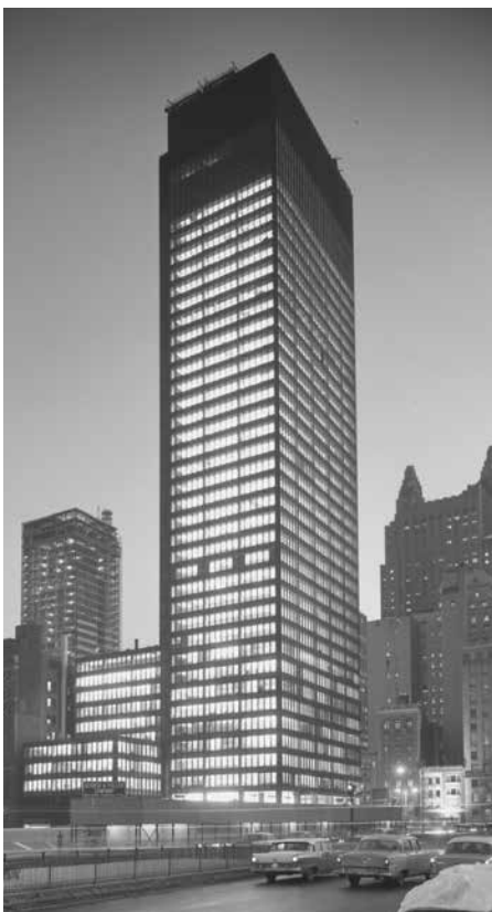
Figure 4. The Seagram Building, while an icon of modern skyscraper design, has three times the energy use intensity (EUI) per square foot than the Chrysler Building, according to 2013 Local Law 84 Benchmarking Data.

not be as innovative if it were not for the requirements of the Battery Park City Authority Green Guidelines. Although many of the buildings incorporate innovative energy systems: from combined heat and power to building integrated photovoltaics; water efficiency and water recycling; indoor air quality improvements and healthy building materials, these technologies have not been widely adopted in other Manhattan high-rises. Even the sustainable initiatives and LEED certification pursued at the current Hudson