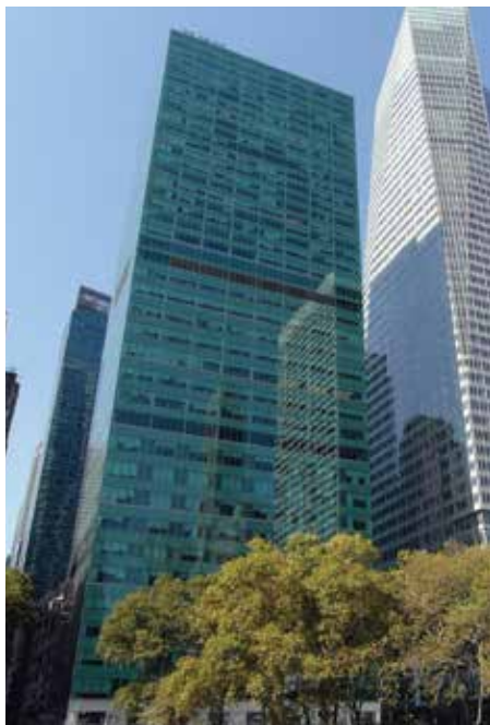
Figure 7. 1095 Avenue of the Americas is a 1970's office building that renovated its office space to Class A and re-clad its façade.