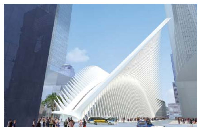
Figure 10. World Trade Center Transportation Hub

arts center at the northwest corner of Fulton and Greenwich Streets, separated at grade from One World Trade Center by 18 meters (60 feet). There is an operable skylight running the full length of the structure. Surrounding the multi-level transit hall and concourses that connect the hub with the towers will be 46,500 square meters (500,000 square feet) of retail. The retail extends three stories into the base of the towers. Funding details for the project, which is currently under design by Gehry Partners, have yet to be worked out.