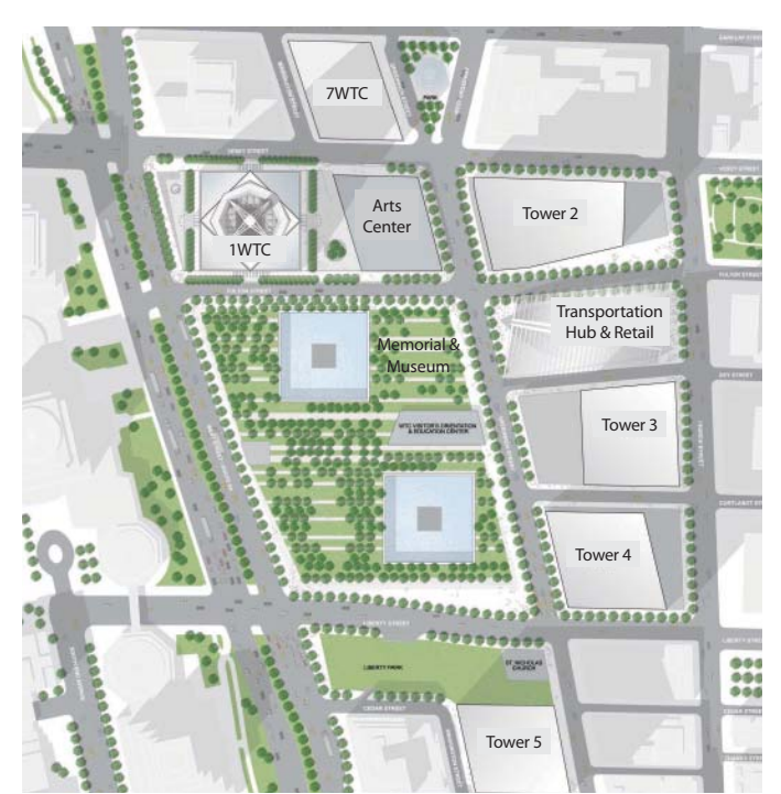
Figure 1. World Trade Center Site Plan © SOM

An important element in the scheme for the site is the restoration of the linear thoroughfare of Greenwich, Cortland, Day, and Fulton Streets. As a result, the World Trade Center site will be more integrated with its surrounding area compared to the raised plaza concept that was laid on top of 12 demolished city blocks in the former World Trade Center.