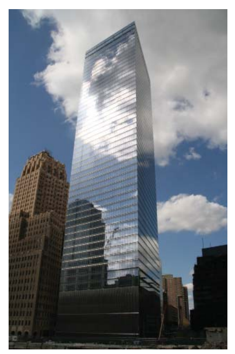
Figure 7. 7 World Trade Center

architect Fumihiko Maki and broke ground in January 2008. When completed in 2013, the 64-story tower will house, amongst other tenants, the Port Authority of New York and New Jersey. Safety systems will be designed to exceed the New York City building code. Designed in accordance with the highest energy efficiency standards, the tower will seek to achieve LEED Gold Certification by the U.S. Green Building Council.