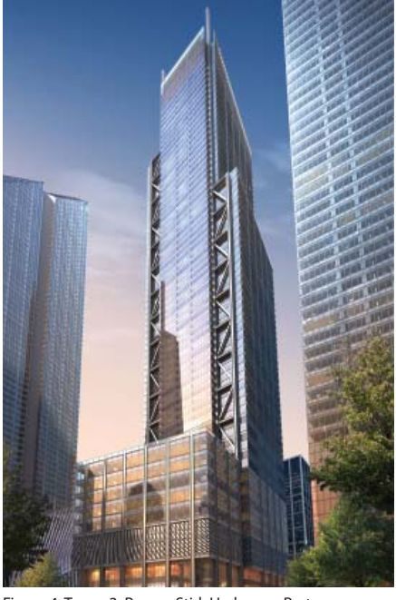
Figure 4. Tower 3, Rogers Stirk Harbour + Partners

progress of developing Tower 3 depends on the ability to finance the project.