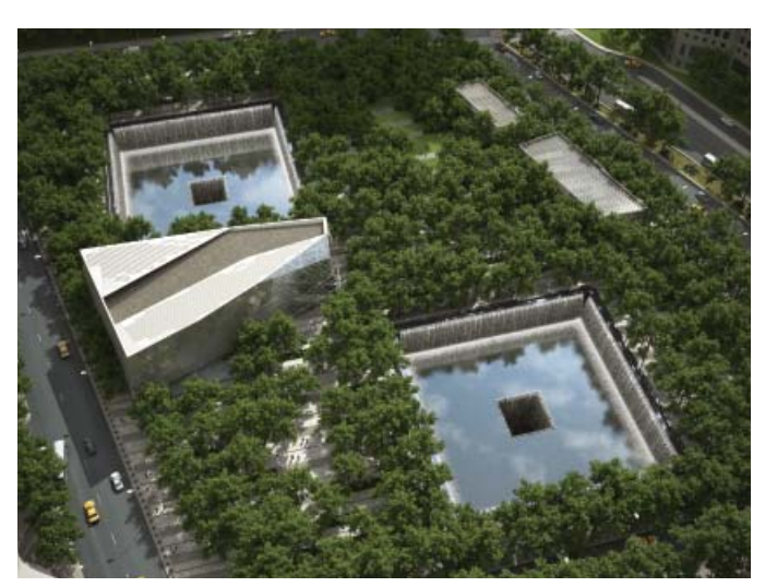
Figure 8. National 9/11 Memorial and Museum, Michael Arad & Peter Walker

Located in the center of the World Trade Center site is the National September 11 Memorial & Museum. The memorial is called "Reflecting Absence" and it honors the victims of the September 11 attacks and the 1993 World Trade Center bombing. The Memorial design is defined by two reflecting pools, a grove of trees and the names of every person who died in the 1993 and 2001 attacks inscribed in bronze panels edging the Memorial pools (see Figure 8). The reflecting pools are nearly an acre in size and sit within the footprints of where the Twin Towers once stood. Selected from a global design competition that included more than 5,200 entries from 63 nations, architect Michael Arad and landscape architect Peter Walker created the final design. The Memorial will be