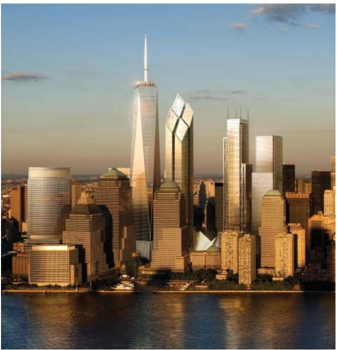
Figure 2. World Trade Center Towers