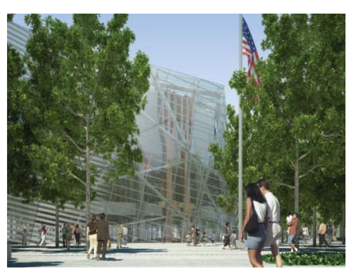
Figure 9. National 9/11 Museum Pavillion, Snøhetta