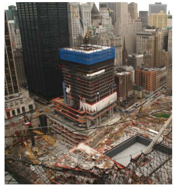
Figure 6. Tower 4 under construction

With a height of 298 meters (977 feet), Tower 4 is the lowest projected tower in the site (see Figure 5 and 6). The building was designed by the Japanese Pritzker Prize-winning &