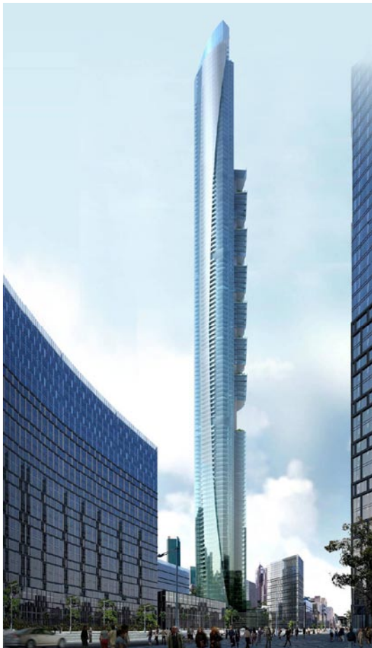
Figure 3. Pentominium Tower, Dubai UAE.