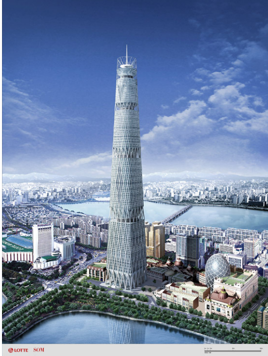
Figure 2. Lotte Tower, Seoul, South Korea.