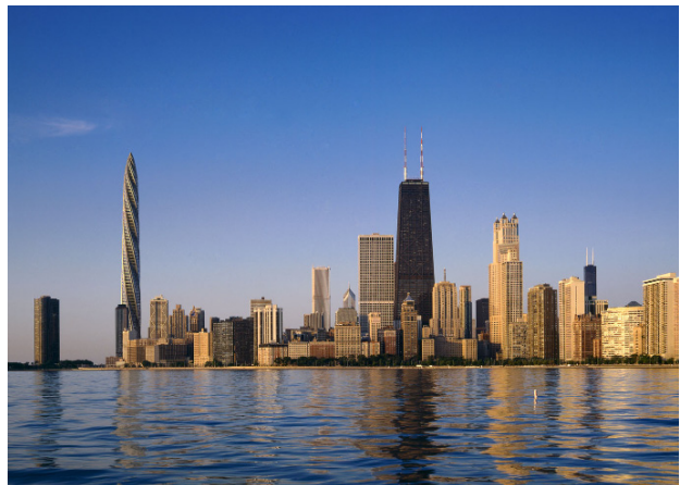
Figure 1. Chicago Spire, Chicago USA.

city's skyline. Designed by world renowned architect Santiago Calatrava, these luxury condominiums will be marketed to an international clientele.