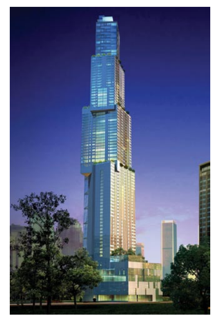
Figure 3: Competition Scheme for India Tower, designed by FXFOWLE

larger urban fabric. Ideally, the project does not become just another disconnected, singular statement in the sea of competing egos that often characterize the landscape of many emerging cities that lack a master planning strategy. A holistic, sustainable approach to design is also an argument for setting a precedent, or corner stone, for what could eventually be a master strategy for building a healthy community. Similar to the way a well-designed, efficiently functioning building is composed of interdependent parts, a tower must also be a harmonious and congruous part of the larger organism, the city. The goal is a cohesive architectural concept that expresses the character and quality of an organization whose identity also reflects membership in a larger community. This means refraining from embellishing the design with elements that fail to use less, do more and relate better to their surroundings than their conventional counterparts effectively, finding an essential expression, using proportion, light and materials. Emerging from the philosophical framework that eventually produced the design vision that will be India Tower is arguably the greater accomplishment in having achieved harmony between the client, user, site and community.