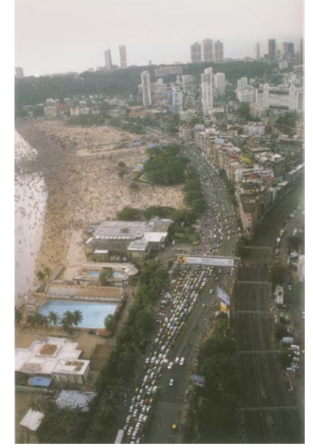
Figure 1: Mumbai

Tower combines a high level of architectural design excellence, environmental responsibility, and high-end