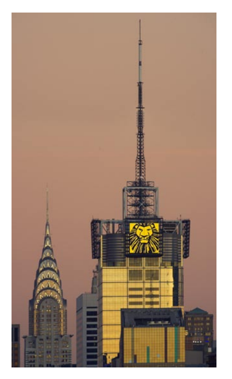
Figure 2: Conde Nast Building, designed by FXFOWLE

responsibly developed into a cornerstone for this project, which, in turn, became a benchmark for sustainable commercial development in America. The Conde Nast project set high standards for indoor environmental quality and energy efficiency, and, when it was designed in 1995, it was the first commercial project in the United States to integrate photovoltaic panels and fuel cells. This is important because of the environmental ramifications, and, even more significant, because of the project team's recognition that to build as before is simply not good enough; the effort needed to revitalize Times Square and, in the process, attain a higher level of development, one more meaningful and one that could demonstrate greater potential for a sustained change into the future.