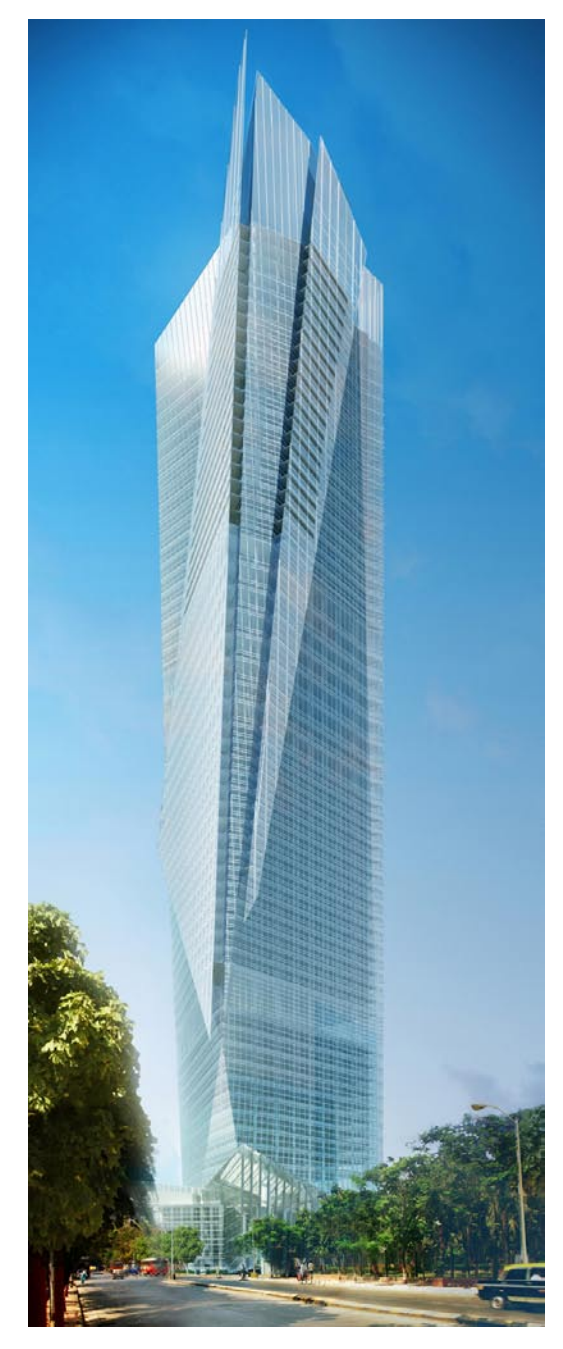
Figure 4: Final Scheme for India Tower, designed by FXFOWLE

bone of the vertebrae – is paradoxically able to be very flexible when the body's individual components function