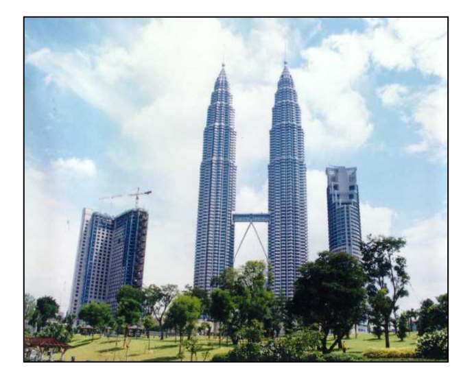
Fig. 1. Photograph of the completed towers