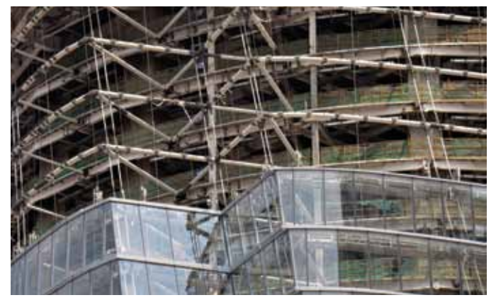
Figure 8. The double-façade system of the Shanghai Tower. The system encloses multi story atrium spaces that sit outside of the primary structural system, which is composed of megacolumns combined with outrigger floors.