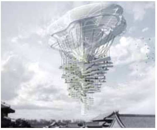
Figure 1. Light Park Floating Skyscraper , Evolo 2013: 3<sup>rd</sup> place. © Ting Xu/Yiming Chen. Source: http://www.evolo.us/category/2013/

66 The Evolo Skyscraper Ideas Competition winning entries have become increasingly fantastic... the lack of basic material and structural concerns makes such competition results more suited to a digital industry such as film, and limits their applicability to the practice of architectural design. 99