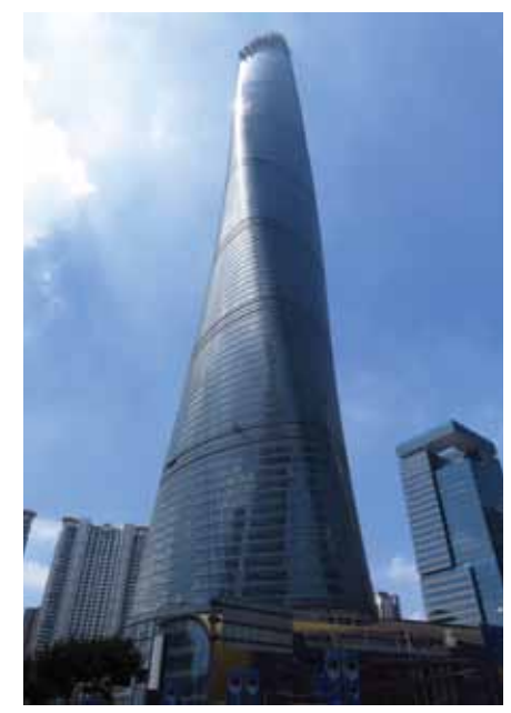
Figure 14. The Shanghai Tower's double façade system adds a lightness and complexity of geometry through its structural layering.

important lessons that need to inform the positioning of tower types in order to allow solar access in cold climates and provide shade in hot ones. Dense urban environments will also modify the wind regime, which can result in spaces that can be either too windy or stagnant. The nature and width of the roadways adjacent to towers will impact the viability of street life. Car-oriented cities and elevated roadways adjacent to towers can serve to negate their connection to pedestrian life. Visions of density often deny the realities of density.