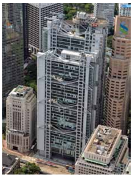
Figure 9. In 1985 the Hong Kong and Shanghai Bank by Foster + Partners launched the use of highly expressive structure and prefabricated components into the realm of tall building design.

interoperability of software systems that allow geometries to be translated from the design office to the engineer, and ultimately to the fabrication equipment. Within this, it becomes important to reconcile structural and material realities with digital dreams. The exciting opportunities of the diagrid and other steel structures lie in understanding the fabrication