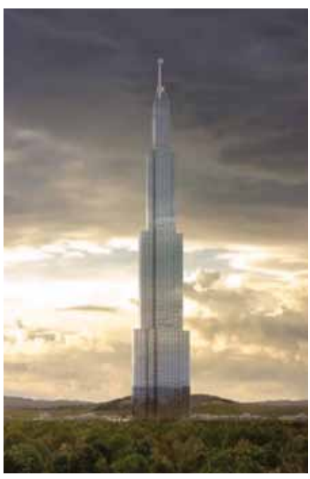
Figure 6. Sky City, Changsha.

The towers constructed to date represent the limitations of the technology of our time, as the height of the tower is directly connected to the tensile capabilities of materials, in conjunction with the understood best arrangement of the gravity and lateral-load