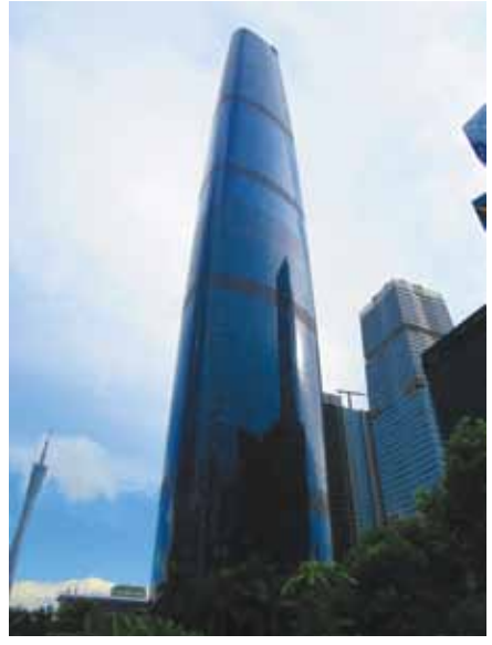
Figure 12. The tubular steel diagrid sits elegantly behind the sleek glazed exterior of Guangzhou IFC. The toroidal geometry of the gently curved tower was made possible only through the use of advanced computer systems.