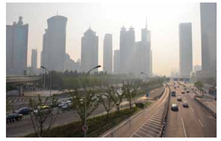
Figure 16. The perceived density presented by the skyline denies the significant impact of the car-oriented spaces that separate the buildings in Shanghai's Pudong District.