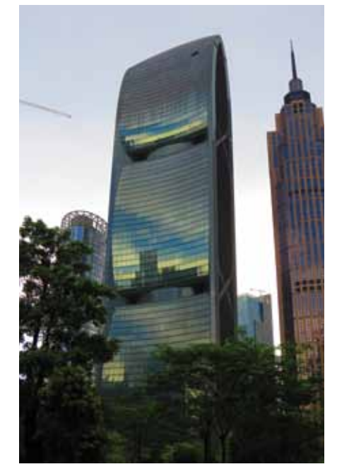
Figure 4. Pearl River Tower, Guangzhou uses its sculpted form to direct wind toward turbines situated at the recesses in the façade.

Recent stylistic and structural changes in tower typology have potentially made the tall building a more engaging building type, as well as perhaps a more contentious one. This provides an interesting opportunity for debate,