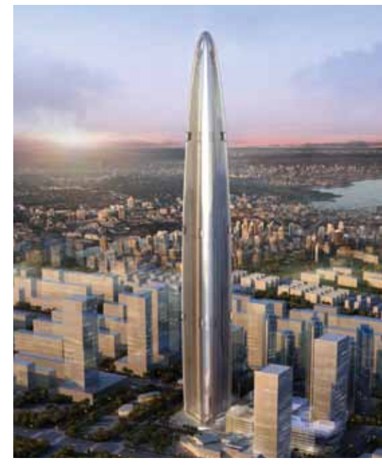
Figure 5. Wuhan Greenland Center's distinctive floor slots help to reduce the vortex shedding. © AS + GG Architects

Many of these blur the lines between digital design, technical aspirations and present realities. A great number of the most speculative skyscrapers have a "green" agenda. Sustainable themes include the incorporation of wind turbines and vertical farms that push the limits well beyond what has been accomplished to date in projects such as the Pearl River Tower in Guangzhou by SOM or the Wuhan Greenland Center by Adrian Smith + Gordon Gill Architecture (see Figures 4 and 5).