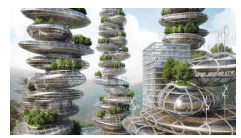
Figure 2. The Dragonfly urban vertical farm concept in New York. © Vince Callebaut Architects. Source: http://inhabitat.com