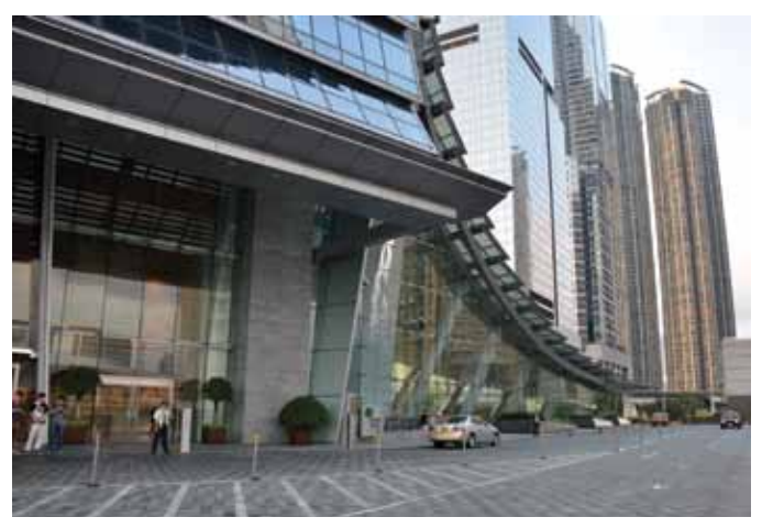
Figure 19. The new International Commerce Center in Hong Kong is not located in a retail district. Even the glazed nature of its base condition cannot create street life.