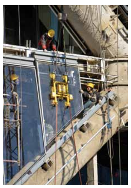
Figure 13. Workers install the glazing that will form the double façade system on the Poly International Plaza. The coordination of such complex geometries is possible only through the advancements of BIM systems.

Although many visionary skyscraper designs purportedly support a sustainable agenda, few choose to tackle the difficulty of the impact of tall towers on the increasingly dense urban environment. This increase in density is inevitable and desirable as a means to preserve agricultural land and limit urban sprawl. However, not all density is supportive of a rich urban life. Beyond issues of the relationship between the height of inhabitation and its relationship to the landscape, described as "Biophilia" (Wilson 1986), the height and spacing of buildings impacts the climatic condition at grade. There are extremely