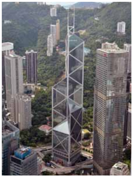
Figure 10. The use of the diagonal as a form-giving device transforms the Bank of China into an iconic tower that is visually distinct from the surrounding, more traditional skyscrapers in Hong Kong.

Building to extreme heights has literally put a lot of pressure on façade design. Sustainable,