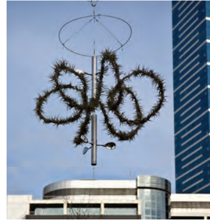
Figure 8. The Airborne project, Melbourne.

might normally be two or three. The authors attribute the increased production to the plants' biological "insurance" – if one or more pups die, then the plant has more reserve shoots from which to prosper. Also, a clump of plants creates greater shade, protecting other plants in the colony. Of several thousand individual Tillandsia used on the eight sculptures, only two plants died during the 13-month installation.