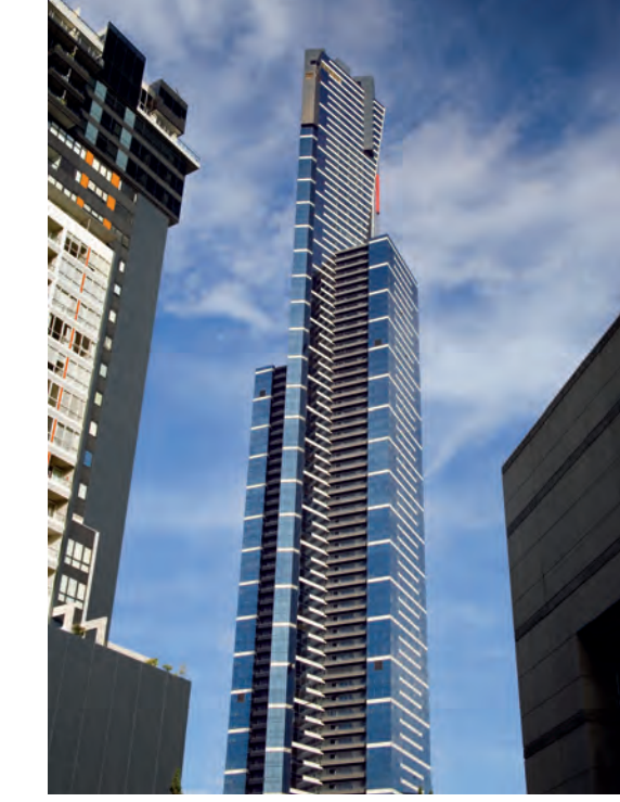
Figure 1. Eureka Tower, Melbourne.

One adaptation of Tillandsias to the epiphytic life-mode is the modification of the role of the roots from that of moisture and nutrient absorption to that of "hold-fasts" that function only to attach the plant to the substrate (Benzing 1990). The leaves of the plant replace the role of the roots and sequester moisture and nutrients directly from the atmosphere,