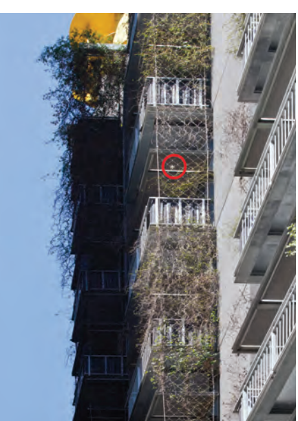
Figure 6. CH2 north façade in 2011. The location of the Tillandsia is marked with the red circle. Note the inconsistent growth of the climbing pants.

or reticulated (pressurized) watering system, whereas the climbing plants originally installed continued to struggle. By February 2015, the climbing plants were still in place, but covered much less of the netting than in 2011, suggesting the effort to replant and maintain them had exceeded the environmental reward. The simple experiment offered a model for a larger project with City of Melbourne – Airborne .