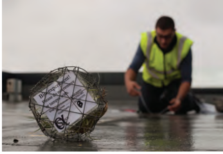
Figure 3. Tillandsia plant cages installed at Eureka Tower.

exterior (Wang et al. 2011). Plant screens have demonstrated effectiveness as passive energy-saving systems (Pérez 2011).