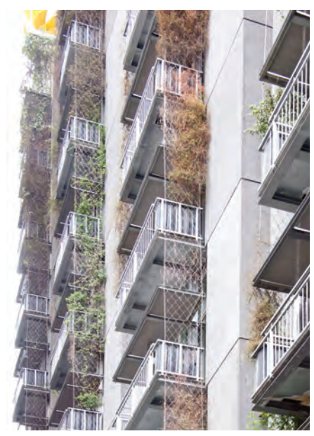
Figure 7. CH2 north façade in February 2015 shows the climbers with less growth than in 2011.

After 13 months, the growth habit of the plants had changed. They were more compact in structure, with shorter, harder leaves, and more silver in color due to increased levels of trichomes. However, pup production was more prolific, with seven or eight per plant, many more than in a less stressful location, where pup production