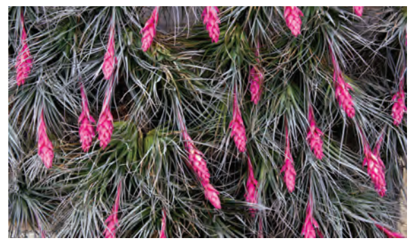
Figure 2. Tillandsias, the "air plants" chosen for the experiment.

Based on previous installations, the weight of a Tillandsia screen is estimated to be 3 kg/m<sup>2</sup>, which is minimal in comparison to adaptive systems that require plant growth substrates and supporting structures. The light weight of Tillandsia means they are perfectly suited for use on screens (Pérez 2011) and can be placed in arbitrary shapes on the building