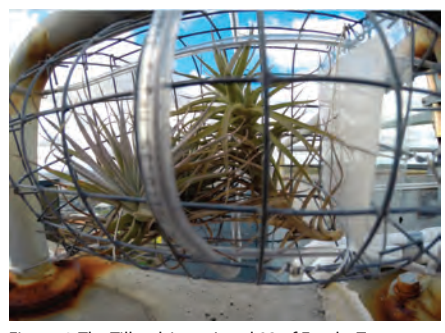
Figure 4. The Tillandsias at Level 92 of Eureka Tower on May 20, 2015. Pups can be seen on the rightmost plant.

Buildings within the urban environment are essentially pieces of refined geology, so when endeavouring to integrate plants into high-rise buildings, one must first observe plants that inhabit similar hostile environments in nature. Basically, buildings are high vertical cliffs of rock with no humus, often no water retention, and extreme temperature changes, which is the type of environment to which some species of Tillandsia have adapted and thrive in. Plants on tall buildings are subjected to high wind speeds and limited soil volumes, which places great pressure on irrigation systems to provide water to counteract transpirational losses. Such demanding ecophysiological environments mean that, for some plant species, no matter how much water is provided to the root system, they are simply not able to uptake water at the rate of transpiration. For adaptive systems the functioning of the irrigation is critical, and there have been high-profile cases of green walls dramatically failing (Klettner 2009). The advantage of selective systems is that they are insulated from this threat.