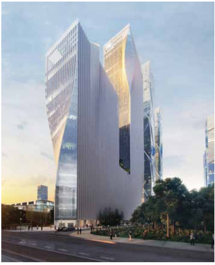
Figure 6. Shenzhen International Energy Mansion in Shenzhen, China

There is also much to be lauded in the increasing embrace of sustainability and environmentally sensitive technologies. But it is telling that some of the most progressive developers, who just a few years