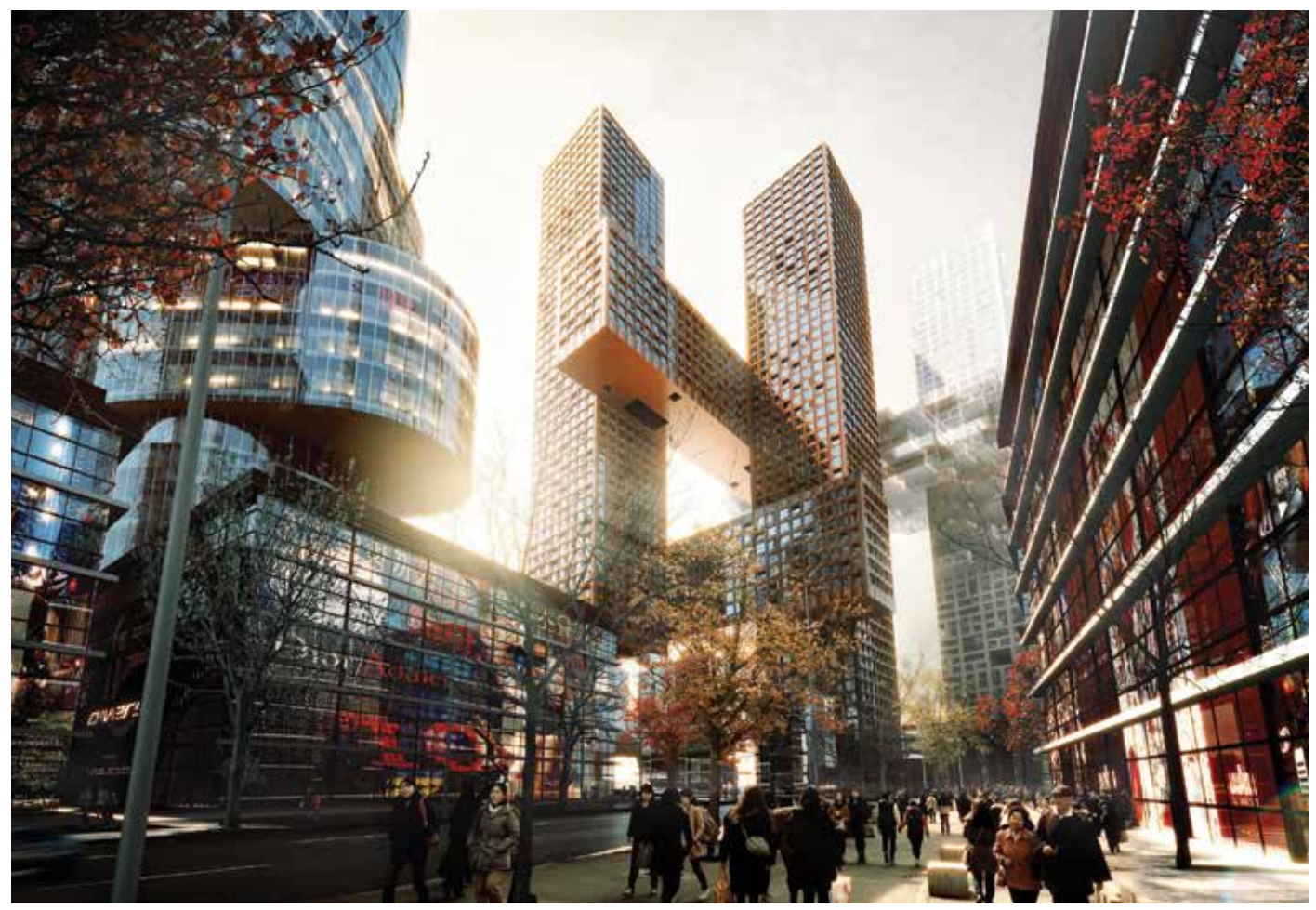
Figure 9. #Towers, Seoul (Source: BIG)

Yeah, I'm curious. We're doing one project in Korea, in Seoul, which is essentially twin towers (see Figure 9), but there are two towers stacked between them, sort of forming these hidden vertical communities with these Babylonian hanging gardens between the towers. I think maybe there's a tendency towards a more three-dimensional exploration of the life between the buildings, not only at street level, but higher. I think maybe also you will see a lot more effort in the transition from the streetscape to the tower. You might have a more gradual, more three-dimensional way of inhabiting space at the base of the tower.