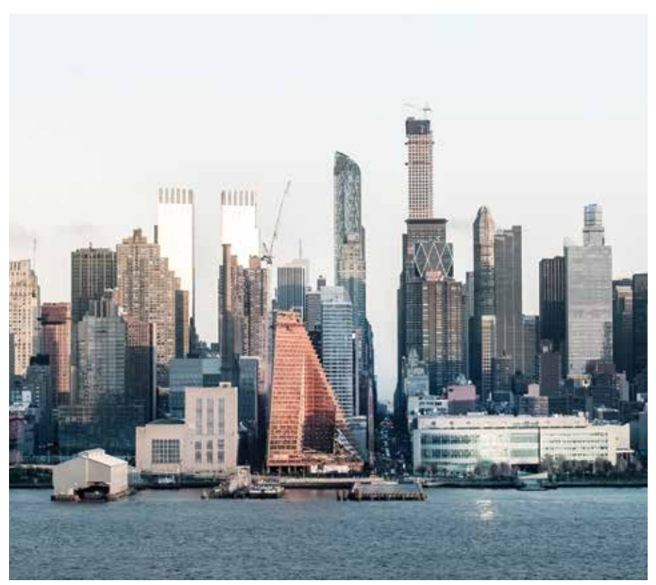
Figure 2. West 57, one of the projects for which the Bjarke Ingels Group was commissioned to design the interiors and exterior

The homogenized International Style neglected the usual environmental design responses. Adaptations to local environmental conditions developed over centuries were being replaced by giant mechanical systems. Essentially the buildings were now on life support – supplemented by air conditioning, central heating, and mechanical ventilation. Machines replaced the thicknesses of walls, solar orientation of the buildings, proximity to windows, the operability of windows. Electric lights even made us independent of daylight.