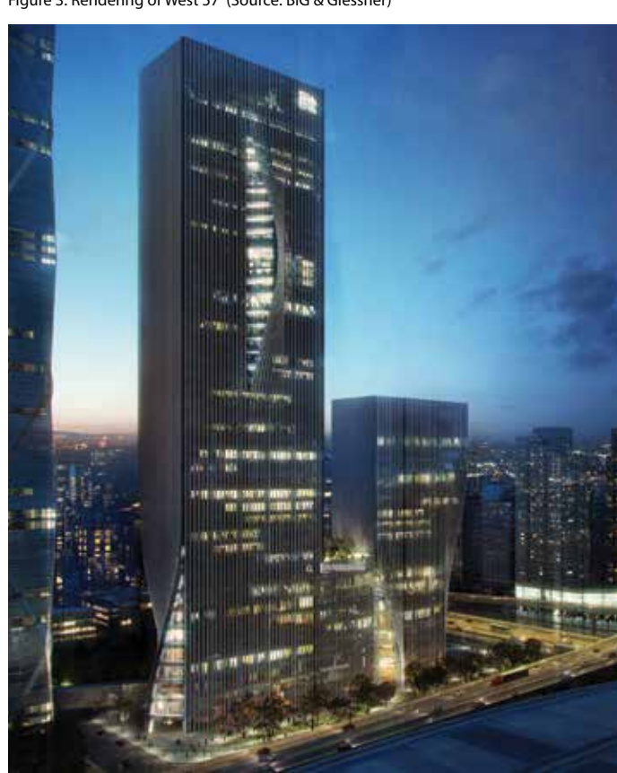
Figure 5. Shenzhen International Energy Mansion in Shenzhen, China

Clearly, we are not proposing that we return to old vernacular styles, but rather that we use all of the new machinery and computer information models that allow us to simulate and calculate the performance of the building before it is built. This includes everything from the thermal exposure of certain volumes, to the impact of air flow through structures. These tools allow us to