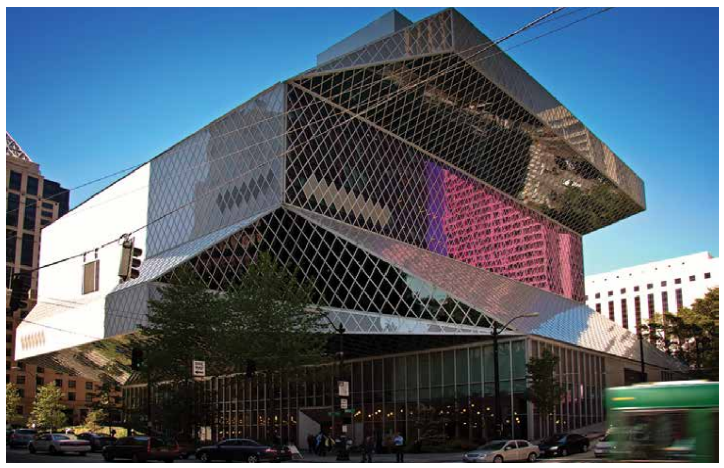
Figure 8. Seattle Central Library