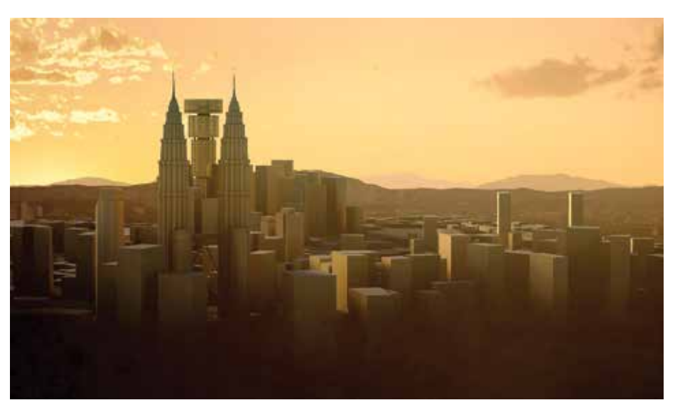
Figure 1. The proposed Signature Tower in Kuala Lumpur challenges the universal ideas of the skyscraper (Source: BIG)

What are the forces that shape the world around us? What are the bits of information that inform our design decisions? How can we use constraints – as design criteria – and in a Zen-like way – turn the resistance we meet into the driving force of our design? Architecture – like storytelling – strives through conflict. The greater the obstacle, the more engaging the design that overcomes it. So what conditions can inform our work?