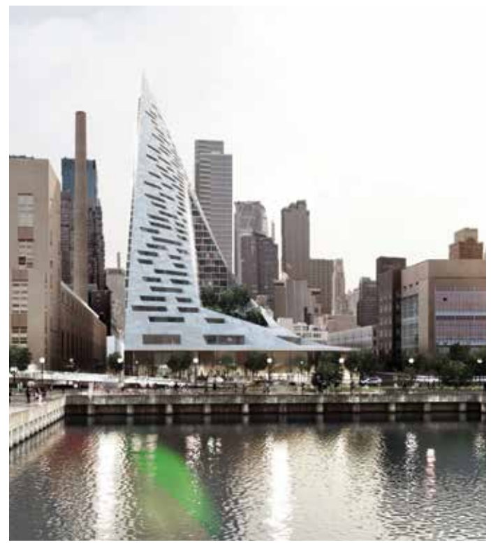
Figure 4. Rendering of West 57