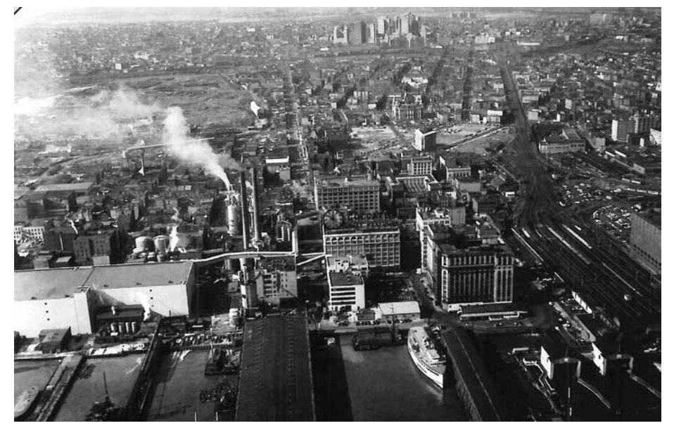
Figure 3. Gregory Park urban renewal site clearance, circa 1954

along the Hudson River waterfront. Seeking a way to revive the city, Mayor Thomas Gangemi called upon the state of New Jersey's Office of Planning for help in 1962. The plan that emerged was to create "Wall Street West." Situated one mile west and a five minute subway ride from New York's financial district, the city was primed for rebirth as a financial center. While it would take almost 40 years to build the 800 foot tall Goldman-Sachs building, within ten years of the Wall Street West plan, the first new office buildings in 50 years were built on Montgomery Street, and they became the locus of the Over the Counter stock market trading.