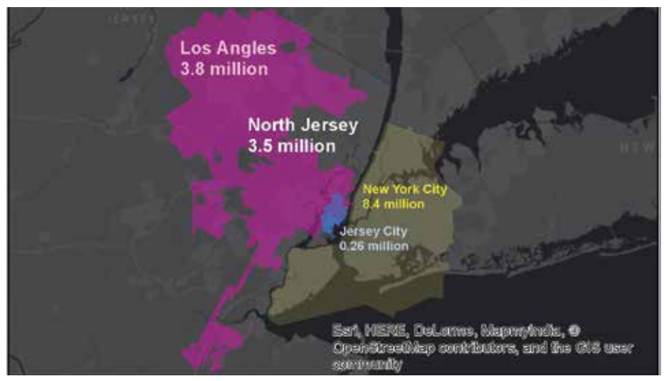
Figure 1. Map comparing the geographic area of Los Angeles overlain on the Northern part of New Jersey

And so it has been that Jersey City's history was one of living off the harbor. The Dutch recognized the strategic value of the harbor, one of the world's best, and promptly turned their colony into an internationally competitive port city. During the colonial period,