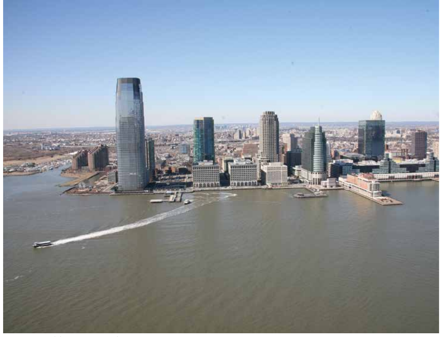
Figure 8. Jersey City skyline

and lot coverage. Recent redevelopment plans that have been enacted have done away with building height limits, density limitations, and parking requirements at Jersey City's most transit accessible locations. In their place are requirements for public plazas, ground floor retail, rooftop amenity areas, bike parking, quality urban design, and other public amenities such as theaters and arts space. Another priority has been a focus on Jersey City's economic development and job creation. By encouraging high rise residential and office construction, Jersey City has been able to maximize the growth of its ratable base from the limited supply of land with the best accessibility. This has produced a positive cycle of employment growth as high density residential and office development spurs nearby entrepreneurial business creation, making neighborhoods yet more desirable for office and residential development. Jersey City outpaces the State of New Jersey in job growth and business creation. Jersey City is also one of the few government entities in the world since the 2008 market crash to improve its bond rating due to rapid ratable growth.