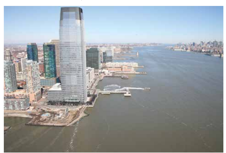
Figure 5. Goldman Sachs tower