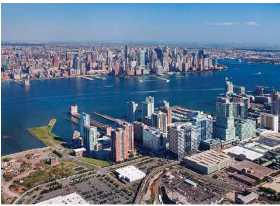
Figure 7. Newport project, redeveloped from freight yards

property tax structure to remain competitive and attract investment, despite New Jersey's over-reliance on real estate tax revenues. Developer designation contracts with the Redevelopment Agency have also secured necessary infrastructure improvements and other community benefits to support continued development which could not have been obtained through traditional zoning ordinances.