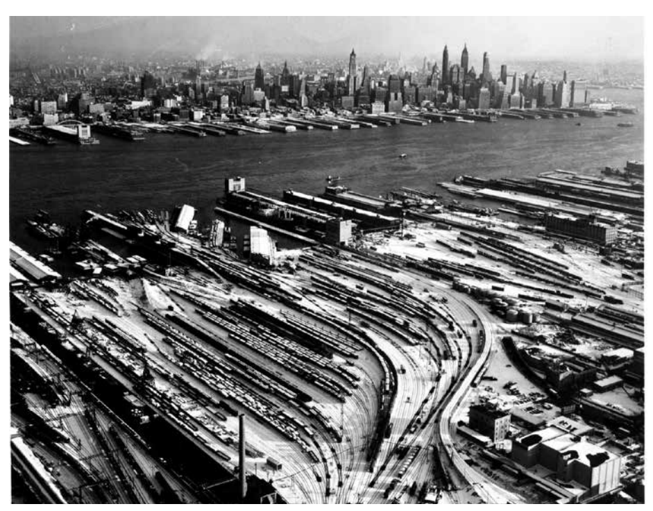
Figure 6. Freight rail era waterfront, now the Newport project