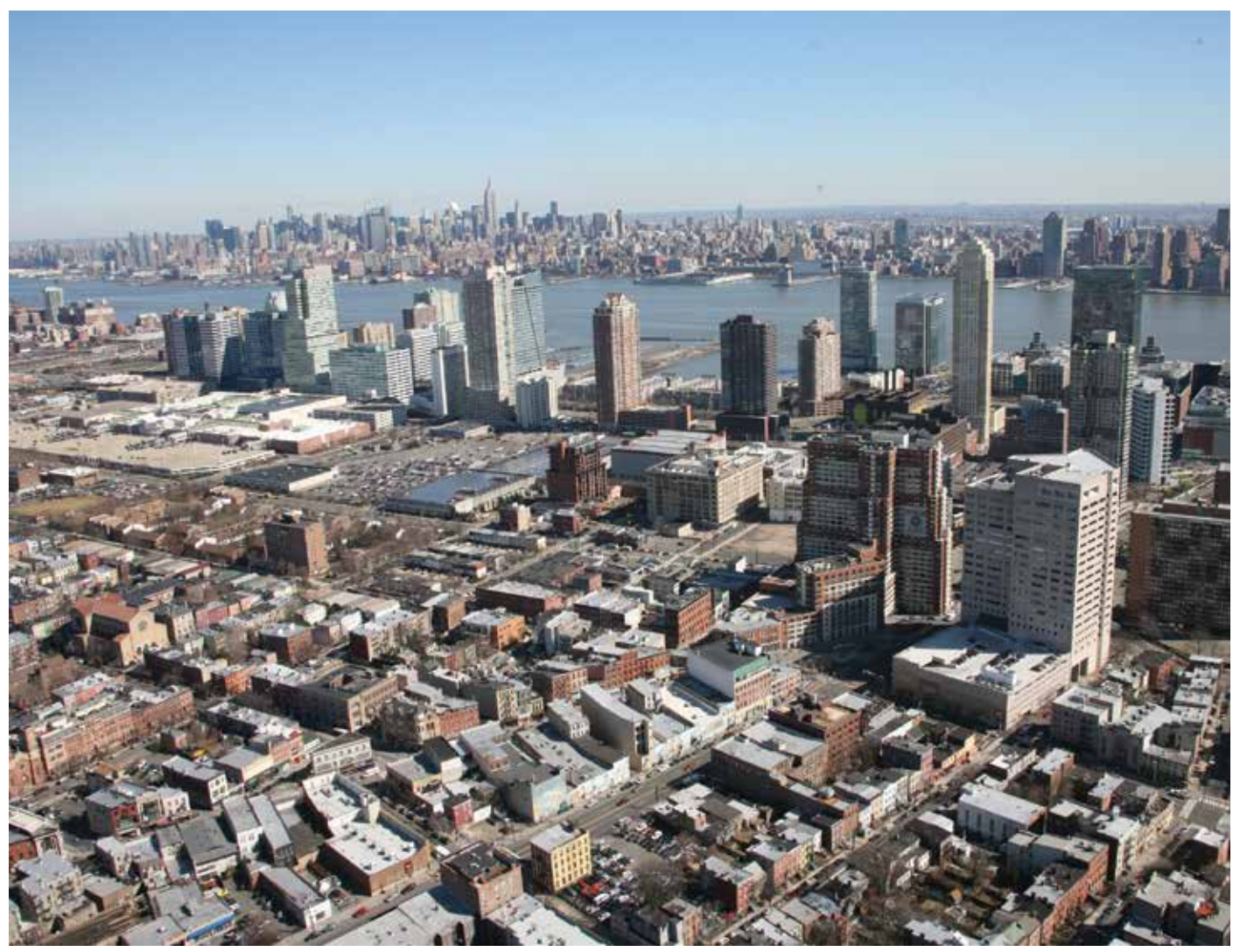
Figure 9. Jersey City skyline

Since 1980, 18 million square feet of office space have been developed on the Jersey City waterfront, generating the highest price per square foot office deals in New Jersey history and marking the success of the original "wall street west" concept. Currently over 6,000 housing units are under construction with another 20,000 units approved by the Planning Board. Much of this development is accommodated with high rise construction with approximately 28 buildings over 300 feet tall and 6 buildings over 500 feet with several more under construction. China Overseas has approvals for a new tower at 889 feet. Within a few years, Jersey City will overtake Newark as New Jersey's most populous city. As Jersey City grows upwards, skyscrapers on the Jersey side of the Hudson River will continue to evolve and make their mark in the Greater New York skyline (see Figures 8 and 9).