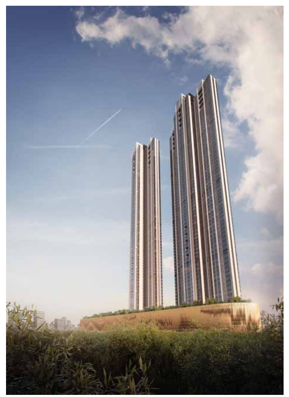
Figure 11: Aranya's pair of towers are aligned on a north-south axis with a cruciform floor plan, with four apartments per level for each tower to ensure each has generous views on three sides and the apartments at each end offering dual-aspect accommodation (Source: Make)