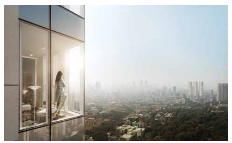
Figure 12: West facing apartments overlook the Botanic Garden with views over Mumbai to the Arabian Sea

the home are provided in a hierarchy from personal to communal: