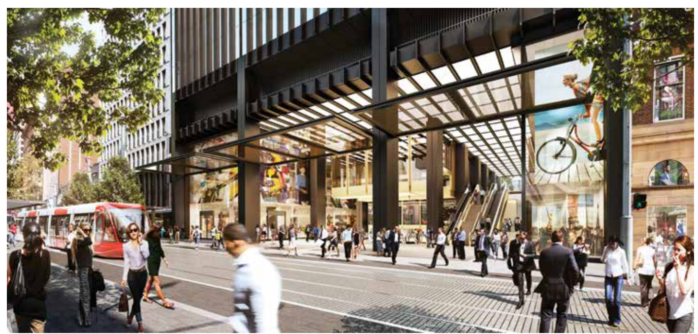
Figure 7: The new transit hall announcing Wynyard Station on George Street

Aranya comprises a pair of 300m-tall towers in the central area of Byculla adjacent to the Mumbai's Botanic Garden, one of the city's rare open spaces away from the waterfront. Mumbai is the agglomeration of a number of