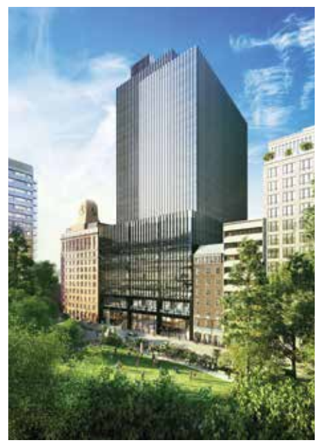
Figure 8: The new transit hall announcing Wynyard Station on George Street

Designed as a vertical campus, the office space enjoys great external awareness and opportunities for interconnected floors between 10 Carrington and the heritage buildings creating a rich blend of different workplace characters. The composition of interlocking rectangular blocks naturally generates external terraces accessed directly from 10 Carrington's