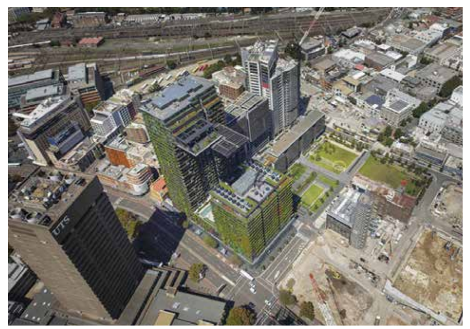
Figure 9: Atelier Jean Nouvel in collaboration with PTW Architects' One Central Park, Sydney, completed in 2014, is an iconic 34 story residential tower with a symbiotic relationship between occupants with the natural world delivered through multiple balconies for each residency oriented to views

Aranya allows real communities to be forged as the spaces for social interaction outside