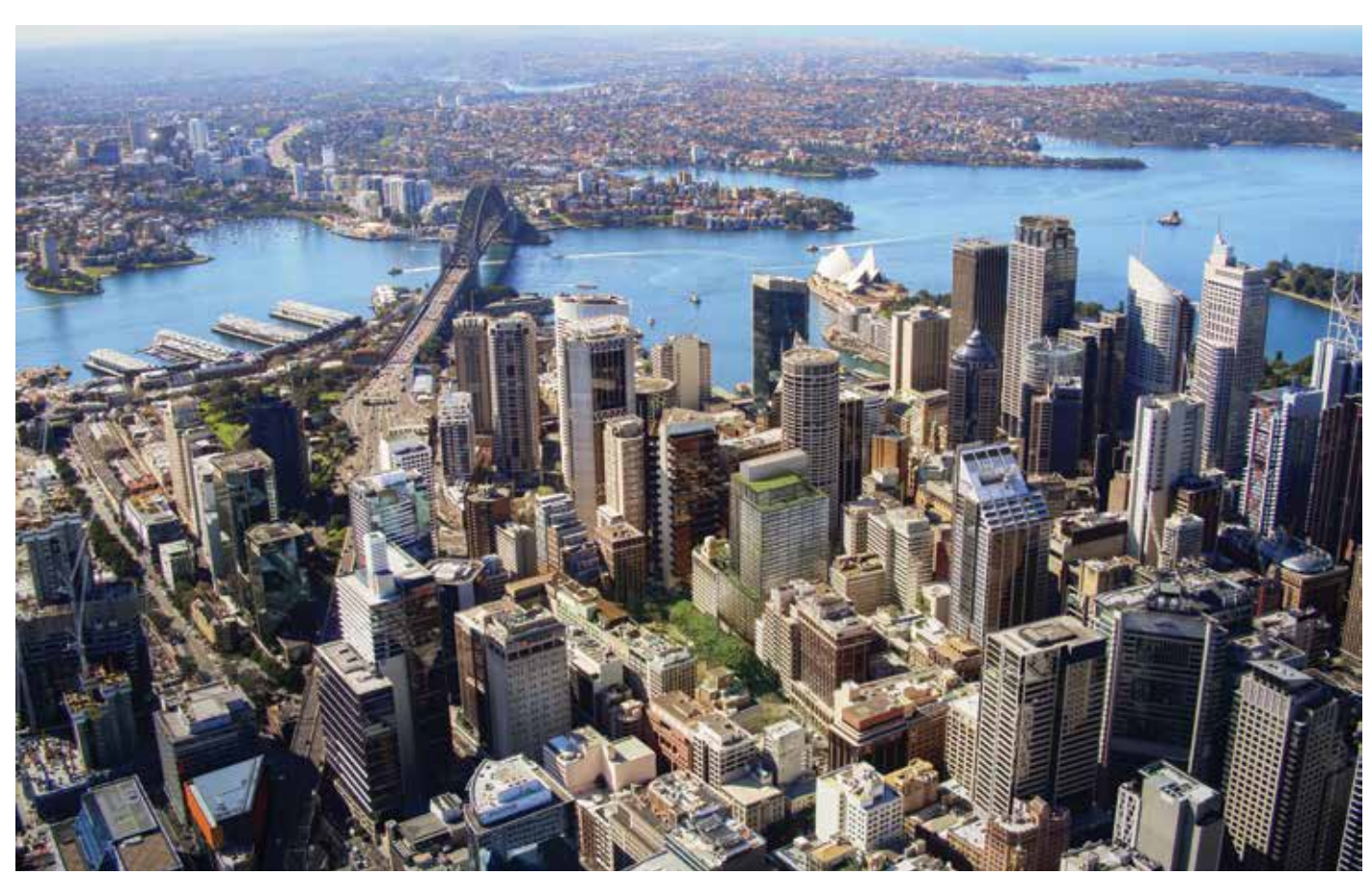
Figure 5: Wynyard Place in context with Sydney's CBD

At street level, 10 Carrington is deliberately designed to restate the urban grid and activate the street edge to improve the public domain and establish new connections with the nearby Wynyard Park. The entrances of 10 Carrington