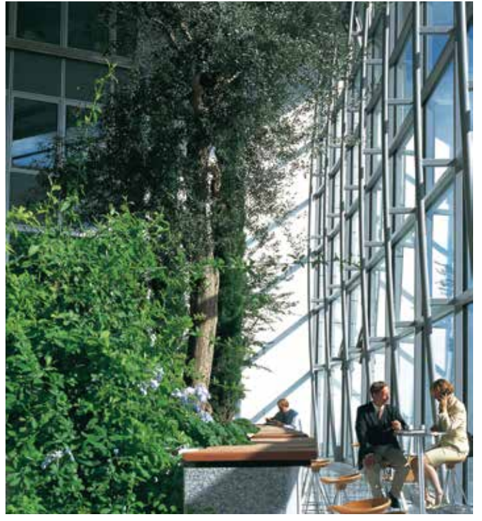
Figure 3: Commerzbank Headquarters' skygardens are protected from the elements by an openable single glazed façade to allow their use throughout the year