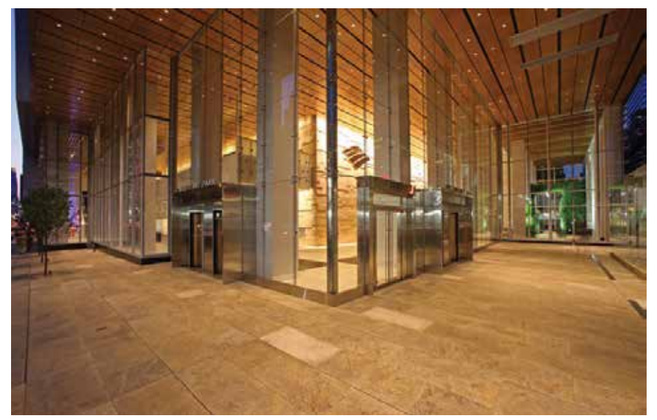
Figure 4: COOKFOX's 55 story One Bryant Park, New York and completed in 2010 is a tenanted office building that consciously draws on the concept of biophilia. The lobby typifies the design philosophy to create a variety of high quality spaces with great external awareness, access to high level external amenity space and use of materials such as oak, stone and leather panelling to connect its occupants with the outdoors