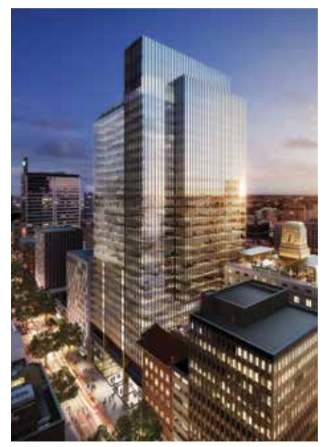
Figure 6: Wynyard Place viewed from George Street illustrating the composition of interlocking rectangular blocks and integration of amenity space set against the backdrop of Shell House's clock tower

and Shell House are located directly opposite the park offering occupants convenient access and use of this public open space which serves to integrate the development with its immediate urban context and provide a respectful setting for the surrounding heritage structures and streetscapes (see Figure 8).