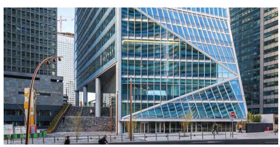
Figure 6. Tour Carpe Diem, La Défense, Paris, exploits a level change to grand effect, connecting street, upper level plaza and indoor winter garden in one gesture.

But a recent project, the Tour Carpe Diem, defies this paradigm while still finding an appropriate situation in the context of La Défense. Even as its faceted façade and height sets it apart from stodgier neighbors in the district, most importantly it incorporates design gestures that support pedestrians in this conflicted area, which was originally conceived as an extension of the famed Champs d'Elysee. A monumental stair descends from the building's winter garden and lobby to a public plaza on the Boulevard Circulaire, creating a new second entrance to the site in the process (see Figure 6). The double-height lobby at the plaza level communicates invitation and transparency,