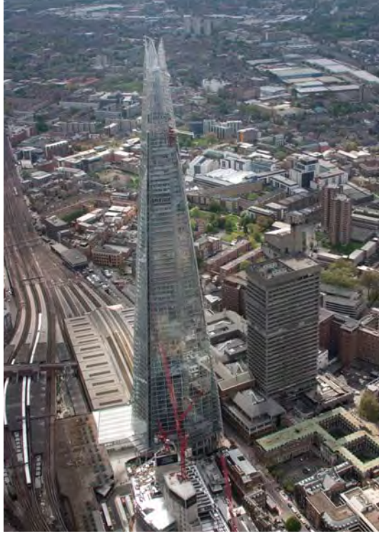
Figure 1. The Shard, London, integrates public transport at its base. © WSP Group

its program (see Figure 2). Abeno Harukas is a firm stake in the ground against the trends of dissipation and suburbanization that have characterized Japan in recent decades, despite its reputation as a compact country.