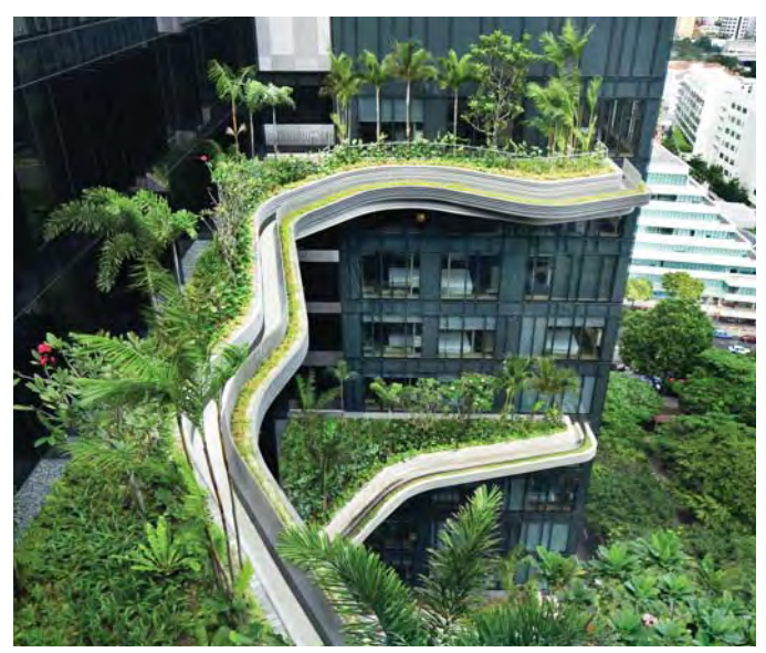
Figure 8. PARKROYAL on Pickering, Singapore dramatically brings the lush greenery of its surroundings into the sky with terraces, water features, and overhangs.