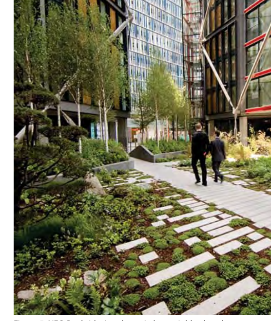
Figure 5. NEO Bankside, London, stitches neighborhood and riverfront together with space between "public" and "landscaped" path through its grounds. © Rogers Stirk Harbour + Partners

The challenge of overcoming gigantism doubles when the brief is to do so in the context of a skyscraper district on a raised plinth, threaded by highways and lying outside the traditional boundaries of a low-slung city such as Paris. The La Défense district is a reflection of the 1960s paradigm of urban planning, which attempted to protect pedestrians by physically grade-separating them from traffic, while still engineering the landscape to maximize ease of use by autos. It is, in many senses of the word, a "defensive" piece of city planning. Surrounded by plazas