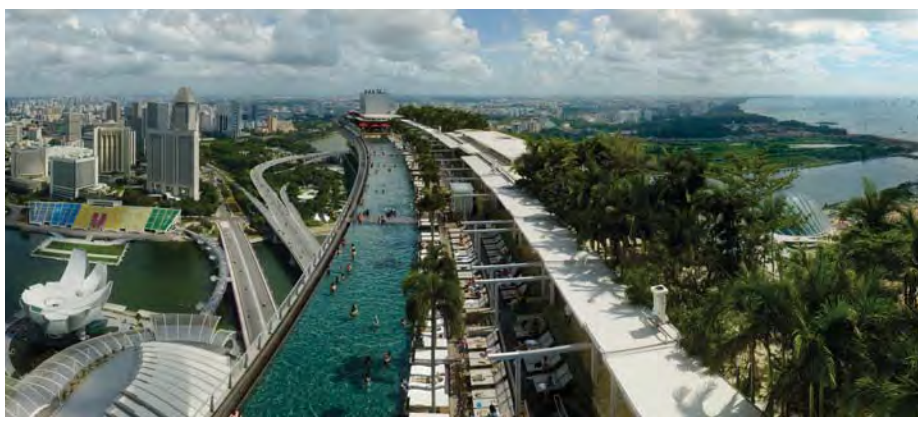
Figure 4. Marina Bay Sands, Singapore, takes full advantage of its connecting sky deck, including a spectacular infinity pool.

This multi-tower public housing project in Singapore is one of the best-known examples of horizontal space at height in tall buildings. Continuous sky gardens on the 26<sup>th</sup> and 50<sup>th</sup>