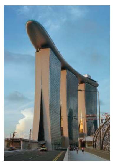
Figure 5a. Marina Bay Sands, Singapore

What the above demonstrates is the social, economic, environmental, cultural and spatial importance of sky courts and sky gardens which enhance the environment for collective health and well being by both improving human comfort levels and enhancing the overall experience of the urban setting. With rapidly densifying urban areas for a growing population, Singapore is faced with having to address the impacts of UHI in densely populated areas and also to provide alternative habitable social spaces which foster a sense of community. It is especially pertinent as the existing green spaces are potentially being depleted through urbanization unless it has been specifically planned for retention and enhancement. The challenge, therefore, lies in looking at alternative means to greening urban areas that explores diagonal and vertical planes in addition to the horizontal plane, podium, or rooftop for the predominant commercial, industrial, and residential land uses in Singapore where land is constrained. Furthermore, the ability to establish quantitative values for different types of greenery can help ascertain suitable ratio's for