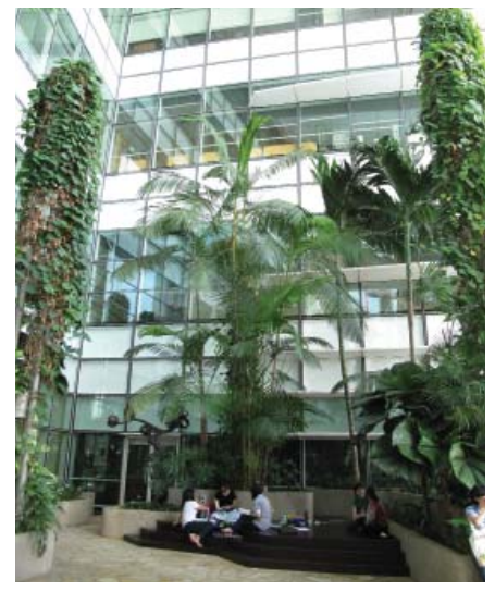
Figure 2. Singapore National Library – sky court

In addition to improving the internal environment, the inclusion of sky gardens at the top of tall buildings can also provide opportunities to view the skyline (and thus be income generating), or provide a place for segments of society with similar interests to interact, play or relax. The Marina Bay Sands project in Singapore is a resort complex crowned by a 1.2-hectare (3-acre) sky park 200 meters (656 feet) above the ground (see Figure 5a and 5b). Its rooftop bars, restaurants, and observation deck, set within a garden setting, has become a popular destination