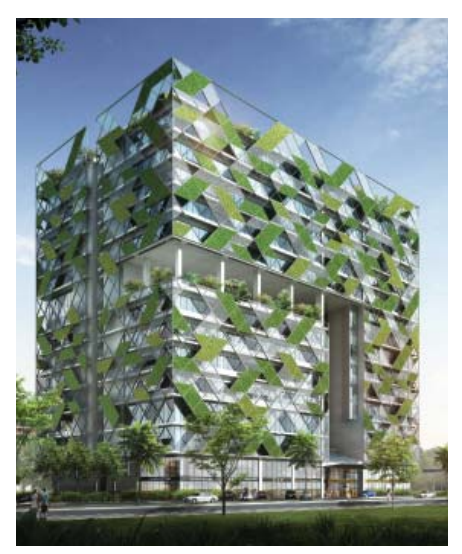
Figure 7. Ken @ TTDI © Ken Yeang

over space by the 20th century. While this has as much to do with slum clearance as it does technological advancements in transport infrastructure at the turn of the century (Hall 2002), it also highlights the increasing privatization of space and the decline of the public realm (Sennett 1976). The ability to provide a balance – the open spaces of sky courts and sky gardens with the built up area of the tall building object – allows us to therefore challenge the conventional 20<sup>th</sup> century tall building approach of self-same repetition in favor of a more hybridist form.