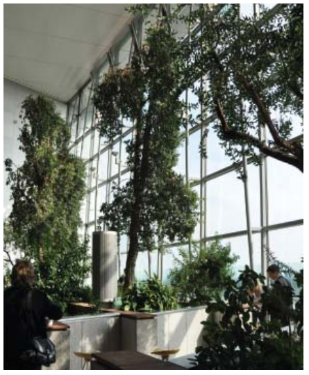
Figure 3b. Commerzbank, Frankfurt – sky court