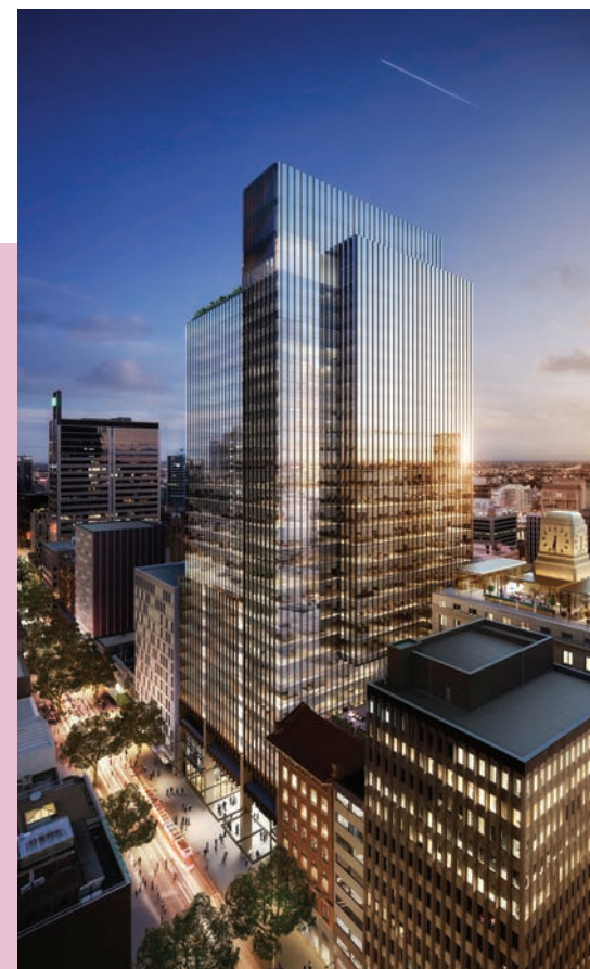
One Wynyard Place, Sydney. © Brookfield