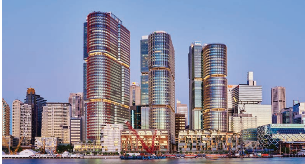
International Towers, Sydney.

In a world that is rapidly urbanizing, we need innovative approaches that not only sustain, but actively adapt and respond. Technology has the power to augment architecture: to turn an inherently static system into one that is responsive. Spaces, buildings, and even cities will have