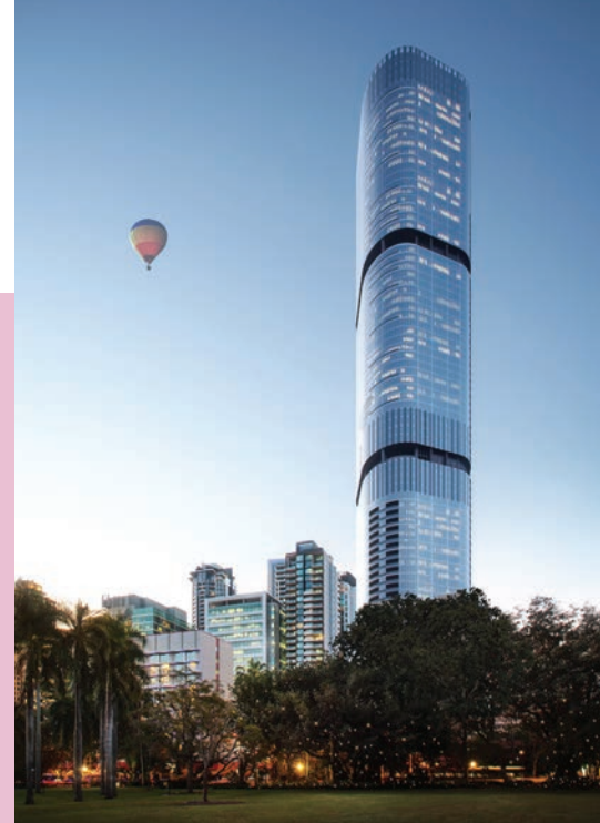
Brisbane Skytower, Brisbane.

Brisbane Skytower will be the latest addition and tallest apartment building in Brisbane's skyline, which is rapidly transforming into that of a world-class city. Set adjacent to the botanic gardens and steps away from the bending Brisbane River in two directions, the project contains 1,135 apartments and 1,877 square meters of commercial space. It features four podium levels and shares an eight-story basement with an adjacent hotel development. The structure is reinforced concrete and comprises a triangular core and a finely detailed high-performance glass curtain wall. The shape and aerodynamics of the design enable the tower to avoid the need