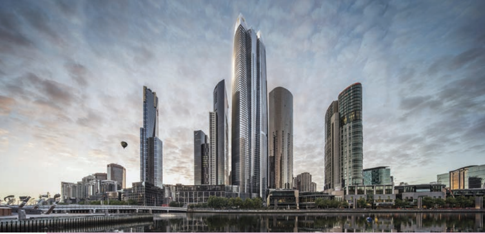
One Queensbridge, Melbourne.