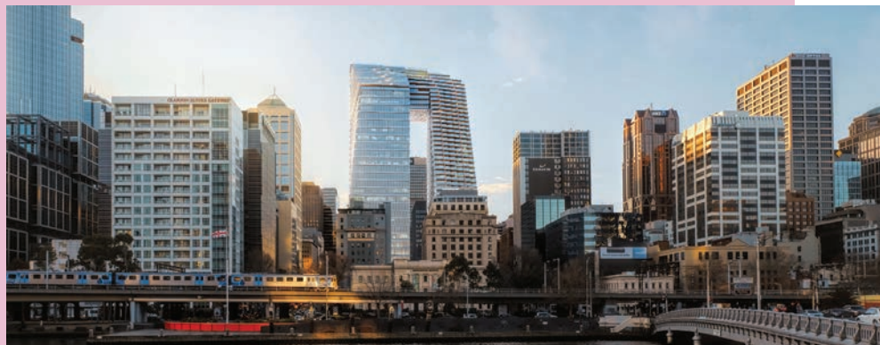
Collins Arch, Melbourne. © Woods Bagot

The design team placed an emphasis on the evolution of texture and materials, considering the building form's transition upward from the ground plane. The eastern façade articulates the relationship between the hotel and residential areas while breaking down the overall scale of the building. At ground level, the façade is defined by a series of frames, providing a sense of scaled-down strength and