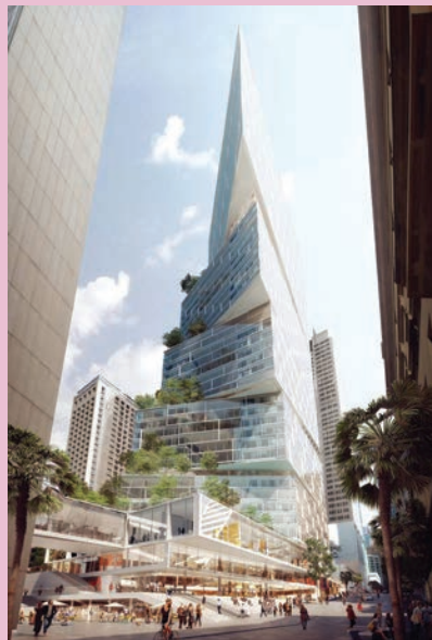
Quay Quarter Tower, Sydney. © 3XN