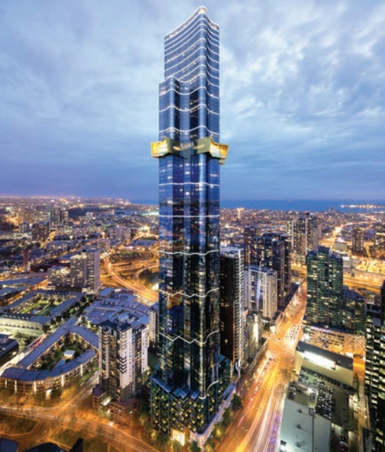
Australia 108, Melbourne. © Fender Katsalidis Architects