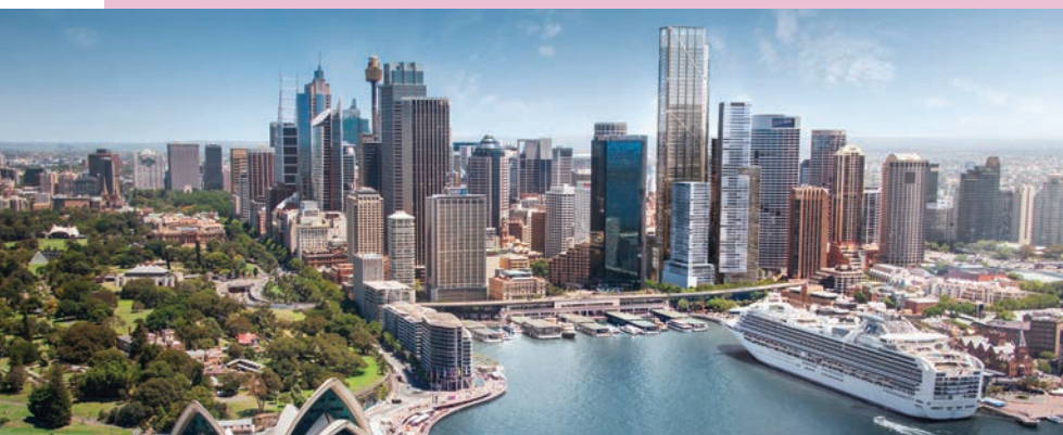
Circular Quay Tower, Sydney.