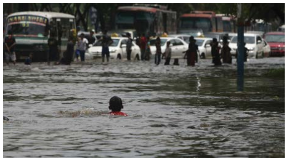
Figure 1. Urban flooding is a persistent problem in Jakarta.

This ecological crisis raises the question of how Jakarta can continue to grow as Indonesia's economic engine. Indonesian President Joko Widodo (see Figure 2) has proposed relocating the capital outside of