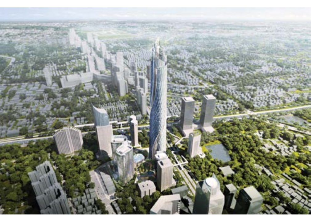
Figure 12. Menara Taspen project aerial rendering. © Woods Bagot

reach Fatahillah Square, potentially spurring development that can preserve the city's architectural roots. Steps toward rejuvenation have already been taken such as the closing of surrounding streets to vehicles and attempts to put the site on the UNESCO heritage list.