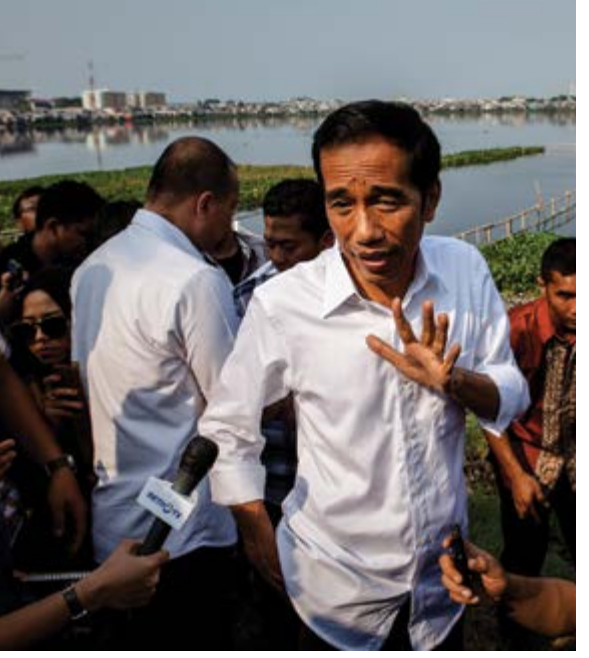
Figure 2. Indonesia president Joko Widodo.