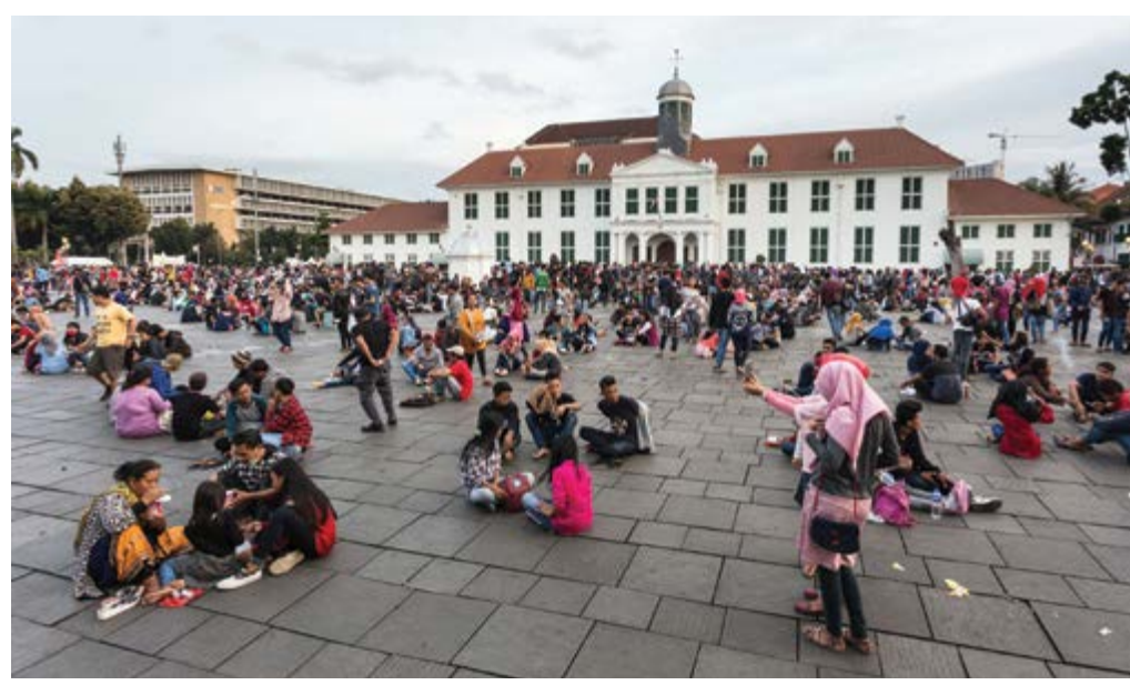
Figure 11. Fatahillah Square, historical center of the old Batavia.