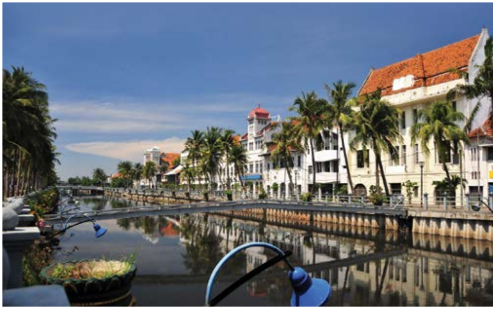
Figure 6. Waterways along Ciliwung River.

Storm water treatment: Instead of storm water discharging directly from streets and developments straight into canals and rivers, flows can aggregate across sites to form successively larger drainage ways.