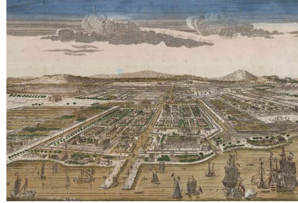
Figure 3. Historical Jakarta (then called Batavia) circa 1780.

Jakarta. But with 10 million current residents, Jakarta is too important to abandon, especially if solutions are available.