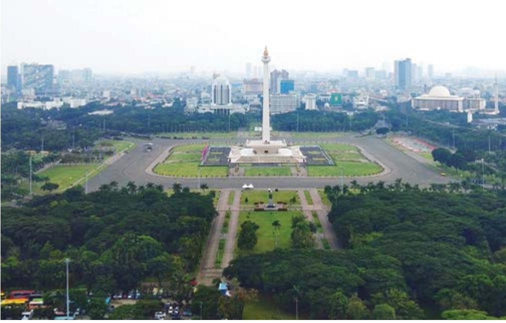
Figure 4. National monument Monas in Merdeka Square.

Jakarta is bounded on the south by Mount Gede and on the north by the Java Bay and Java Sea just beyond the inlet. Thirteen rivers