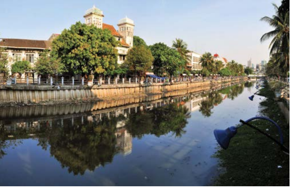
Figure 8. Historical colonial building along waterway.