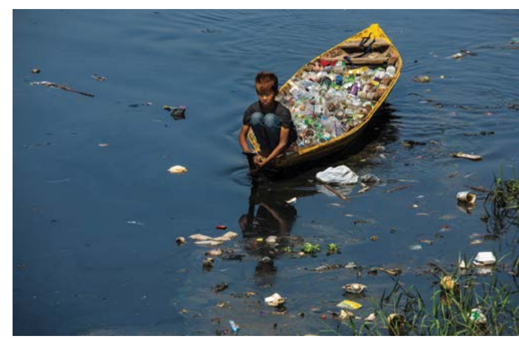
Figure 7. Pollution in waterways.

The water will then run through a series of low-impact development (LID) storm water management facilities, green streets, and wetlands, then into larger treatment areas before being discharged into the rivers.