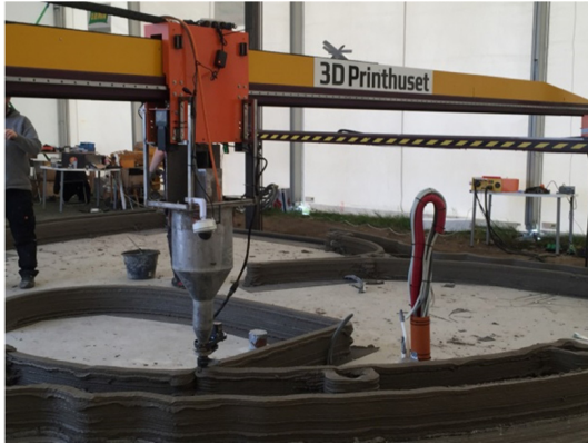
Figure 4. Construction 3D Printer.

technology is not commercially available. 3D printers can build with eco-friendly materials and they do not produce much waste since the materials are printed on-demand. On the other hand, they require an expensive initial investment and they can only build house walls so far; in fact, the printing operations are generally stopped to let the workers install rebars, plumbing, and wiring. So, even though these devices can have an important role in the revolution of the construction sector, they have not been considered robot within this paper, since they just reproduce the information of the digital model.