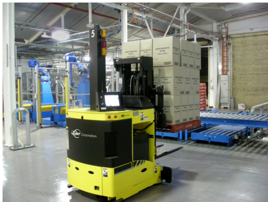
Figure 6. Logistics Robot.

These devices have been developed to facilitate the installation of heavy and fragile components such as facade panels, which need to be moved with extreme precision; unfortunately, the level of automation achieved to this day by facade installations systems is not sufficient to consider them as robots. Despite the considerable