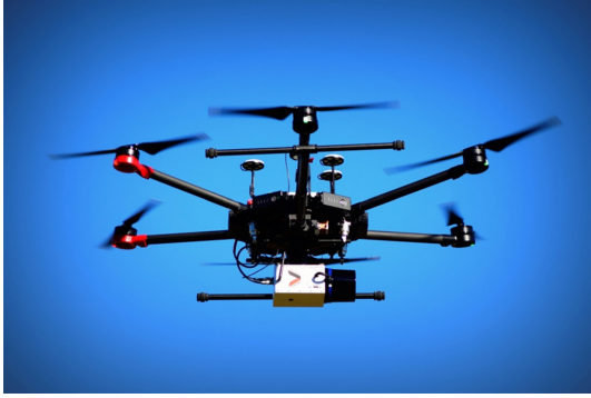
Figure 2. Site Measuring and Monitoring Robot.

and, at the same time, acquire a total number of data significantly greater than the one obtained with traditional methods. The application of these systems brings improvements to the overall productivity of construction as well, because the 3D information extracted from the multi-sensor robots can be incorporated into BIM technology and used in different design phases. Despite many substantial improvements can still be achieved in this task, the devices in this category can be considered robots, since they can be provided with numerous technologies, such as laser scanners, GPS receivers, cameras, magneto-meters or LiDAR (Light Detection and Ranging) systems, which also allow them to autonomously navigate and avoid obstacles when necessary. A subclassification within this category distinguishes terrestrial devices from aerial ones; the former are robotic platforms provided with wheels or chain tracks, while the latter are drones, also called UAVs (Unmanned Aerial Vehicles). In the second case, the robots can scan vast areas in a short time, but the number of equipped sensors used to increase accuracy largely affects the weight and the cost of the system, as well as the dimensions and the flight range.