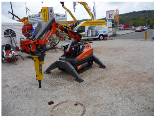
Figure 7. Teleoperated Demolition Machine.