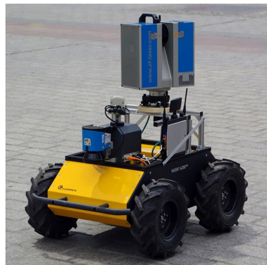
Figure 1. Site Measuring and Monitoring Robot

devices are developed to accomplish tasks that can vary from monitoring and measuring, to surveying and inspection. They reduce the time spent to carry out these operations