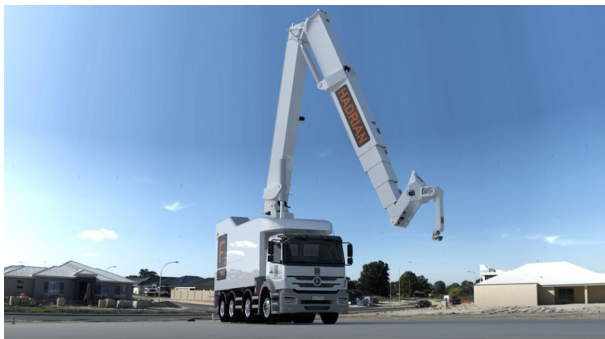
Figure 5. Bricklaying Robot.

These devices have been developed to obtain improvements on the quality of concrete by enhancing both compressive and flexural strength through mortar vibration. Timing requirements given by the curing process of the mortar are tight, and concrete floor compaction is a critical process that needs to be done within a limited time following pouring. Most devices belonging to this category are responsible for both leveling and compacting activities, which are usually linked because of the operating mechanism. The most advanced devices with these functions are laser-guided or satellite-guided robots; generally based on a body unit with integrated sensor elements