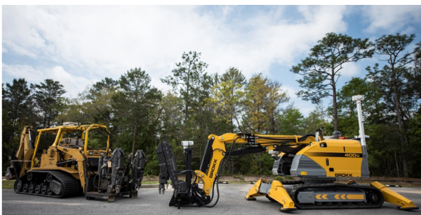
Figure 3. Earth and Foundation Work Robots.

These devices are capable of removing, loosening and lifting soil automatically; in fact, they are sufficiently developed to be considered as robots. The advantage brought by this equipment consists also in the possibility of connecting many robots to automate a variety of tasks