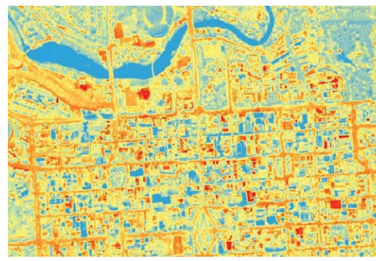
Figure 2. Adelaide heat map in March 2018.

The built environment (construction) industry has a large role to play in mitigating climate change, given the construction and operation of buildings can lead to significant carbon emissions (e.g., concrete manufacture and heating and cooling buildings). This industry can also contribute to adapting to climate change, particularly in our built-up cities. Reduced summer air temperatures will in turn reduce energy demands on building cooling, thus further driving down carbon emissions. For example, in urban environments, in