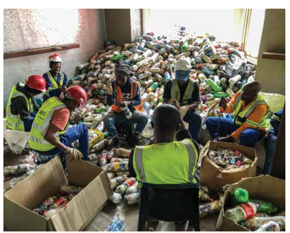
Figure 3. Ecobrick quality control and filling station at the Ridge.