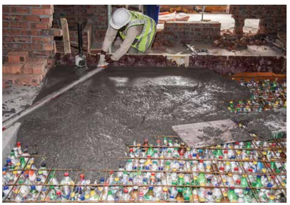
Figure 2. Ecobricks as void formers being filled with concrete in non-load-bearing areas of the floor at the Ridge where no services are required.