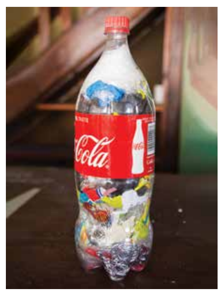
Figure 7. A detail view of a filled ecobrick.

negligible energy and carbon contribution to the project by the ecobricks, associated with transportation of the ecobricks from source to site, as transferred from the end-of-life boundary of single-use plastic. Likewise, the assumption is made that all handling, packing, cleaning, and transportation considerations are balanced out by those borne by either the EPS or concrete options.