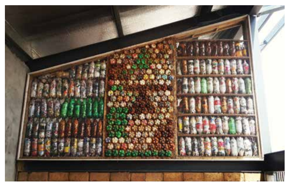
Figure 8. The Delft Early Childhood Development Centre, Cape Town, an ecobrick project facilitated by the Ecobrick Exchange.

According to the World Wildlife Fund (WWF) Living Planet report (Grooten & Almond 2018), plastic use is between 30 and 50 kilograms per person per year in South Africa. At the average of 40 kilograms per person per year, the void formers represent 110 South African citizens' annual use of plastic. Put another way, the project has diverted the equivalent of 110 people's annual consumption of single-use plastic from landfill and oceans.