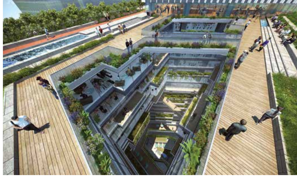
Figure 10. Communal terraces at the Gallium Valley Science Park let fresh air and sunlight into core spaces.

As flexible, hybrid work kicks in, occupancy of the office building will be distributed around the clock as people come to work at different times of the day. With demand for digitalization rising at the same time, energy demand will increase in our future workspaces. Optimizing user experience