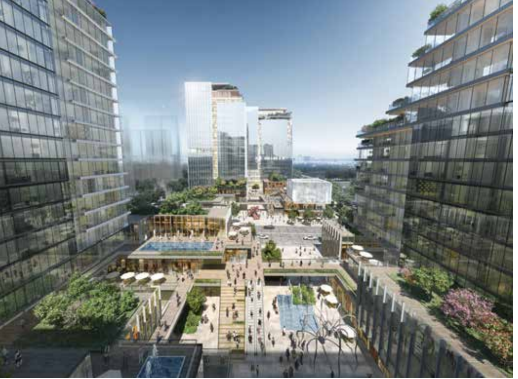
Figure 13. The FSH Plaza, a mixed-use development in Nanjing, goes beyond the considerations of the five-day working week to create an inviting space for community enjoyment.