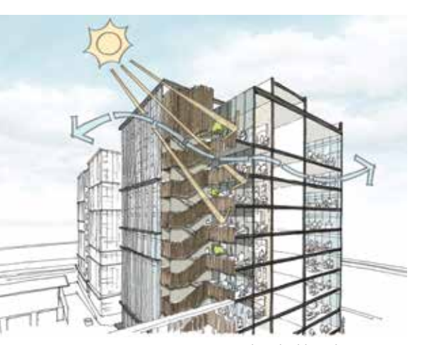
Figure 5. Recesses cut out along building elevations allow sunlight and ventilation to enter the buildings.

outdoor terraces, and floor plates cutting into each other can be good ways to draw ample fresh air into the office, while large, visible indoor staircases piercing through the main office space allow air to move from one floor to another. Chilled ceiling systems can also be installed to ensure even distribution of cool air.