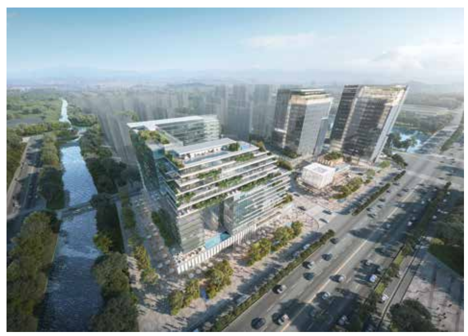
Figure 12. The FSH Plaza, a mixed-use development in Nanjing, includes two headquarters offices, apartments planned for staff accommodation, and a retail street with a cultural and family-oriented retail mix.