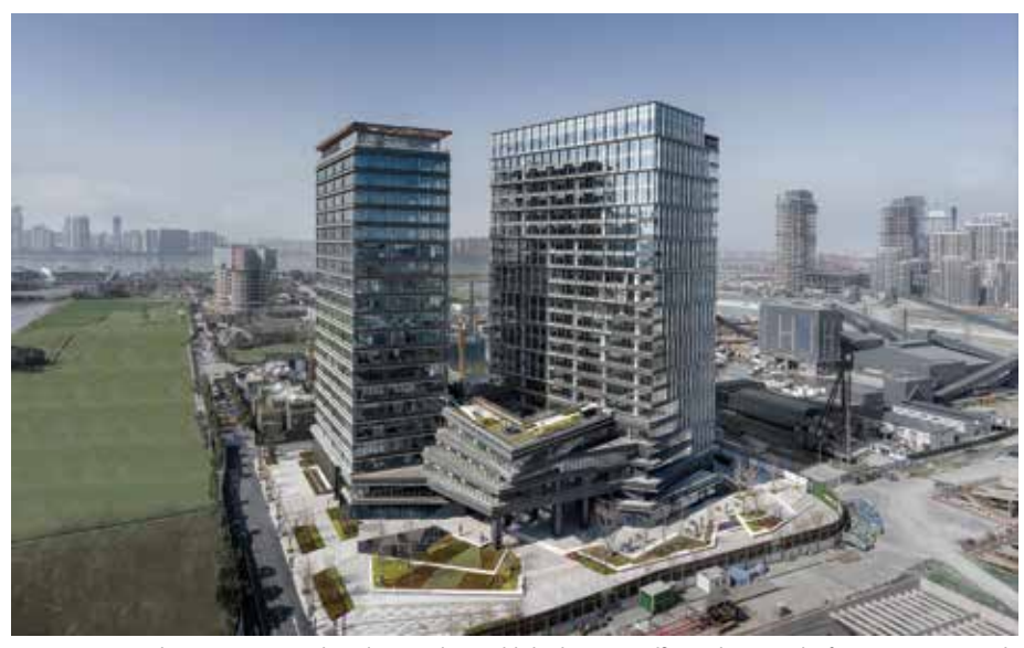
Figure 7. Aoti Vanke Centre in Hangzhou disrupts the established norm in office architecture by featuring a courtyard garden in the central core.

staff engagement activities can take place. While open-plan layouts may convey a sense of spaciousness and transparency, employees also need more secluded booths to voice out their concerns to management in private, undisturbed conversations. Forums, training, and team-building sessions with a larger number of participants can make use of open-air theatres and meeting rooms (see Figure 6).