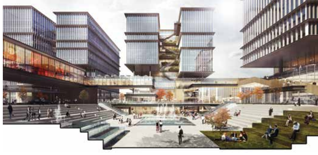
Figure 1. Gallium Valley Science Park in Hangzhou, China is designed as a flexible workplace with a variety of shared amenities, surrounded by a multitude of shared open spaces for greater social opportunities.

A sensible curation of amenity-rich mixeduse spaces is a valuable asset that helps companies adapt to a post-pandemic society and retain top talent. Under hybrid working, there will always be part of the workforce working remotely. Facilitating collaboration between those in and out of the office is a challenge, not only for employers, but also designers. Spaces must be designed to accommodate different workstyles, routines and modes of work—private work, face-toface meetings, virtual conferencing, brainstorming, cross-disciplinary collaborations, knowledge sharing, forum discussions, etc. To elevate the user experience, it remains a task for the architect to link these components seamlessly with