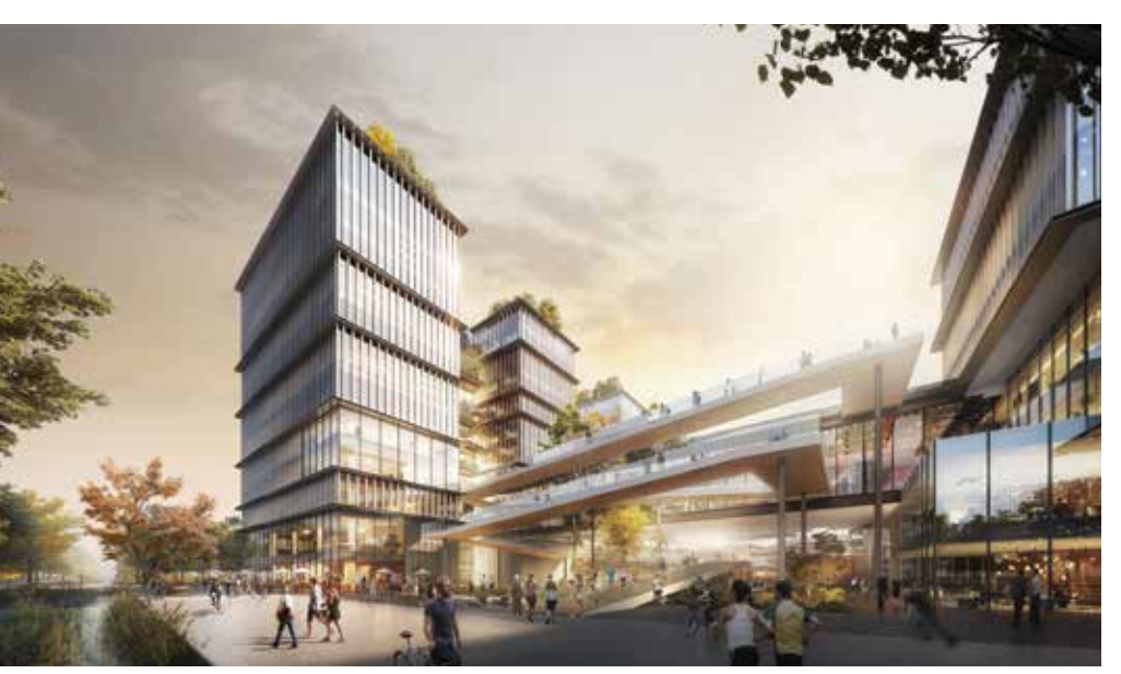
Figure 14. An effective, responsive environment brings about a well-curated user experience tailored to the needs and habits of different occupants. Shown here: a rendering of Gallium Valley Science Park in Hangzhou.

while pursuing environmentally-sound strategies is a challenge every office architect today must address, to which smart solutions that integrate building information modeling (BIM) will provide much assistance.