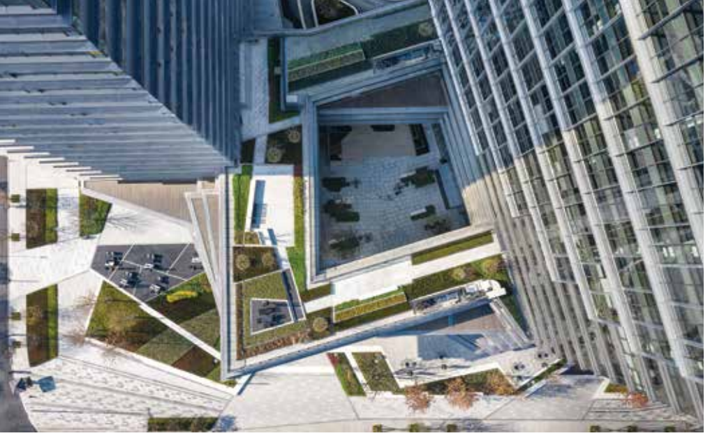
Figure 8. The central courtyard of Aoti Vanke Centre is a permeable social space that integrates with the surrounding streetscape.