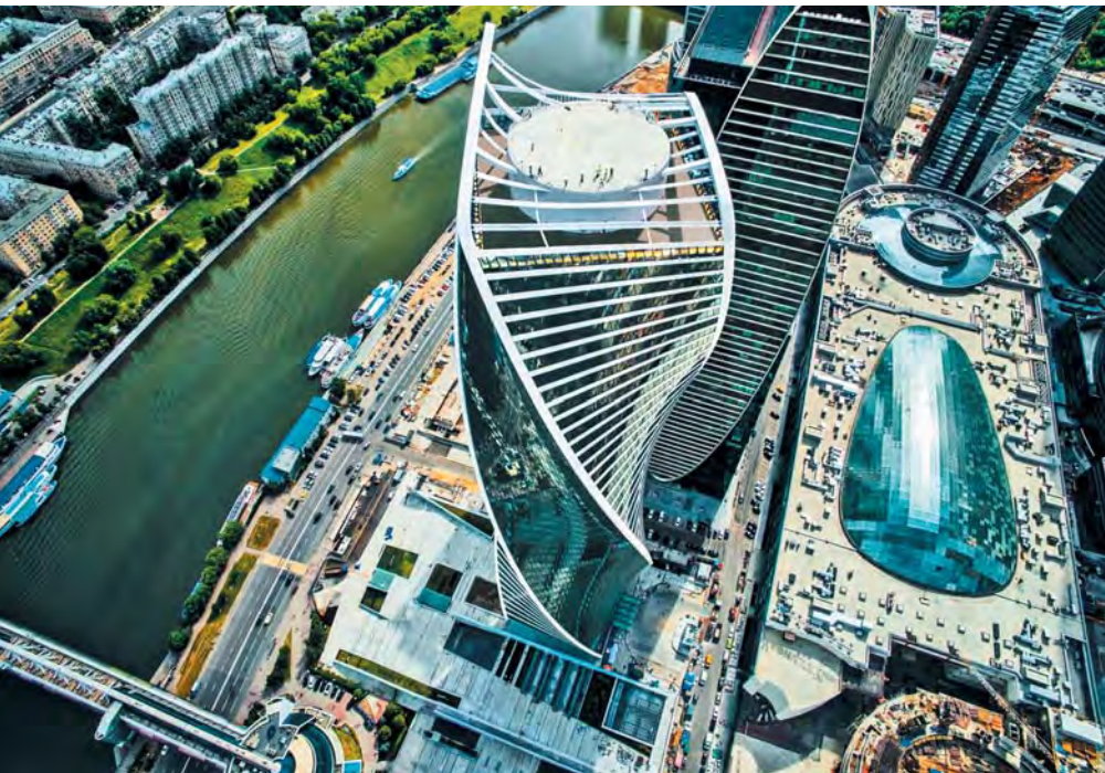
Figure 1. Evolution Tower, Moscow – aerial view

From the very beginning, the developer and architects set an ambitious goal: to create a recognizable and symbolic building that would be a new icon of contemporary