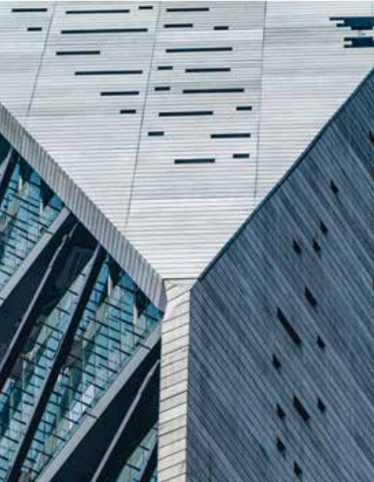
Figure 7. At Torre Reforma, Mexico City, concrete shear walls, perforated with slots, selectively admit light, while a double-layered glass façade supplies the building with natural ventilation.

bathrooms, and street-level irrigation needs. The water storage tanks are dispersed along the tower, so gravity can be taken advantage of, instead of energy-intensive pumps. Further emission prevention measures are taken by way of the building's automatic parking systems, which don't need to be lit or ventilated, and no toxic vehicular exhaust is emitted, as cars are moved by electric lifts instead of their own engines.