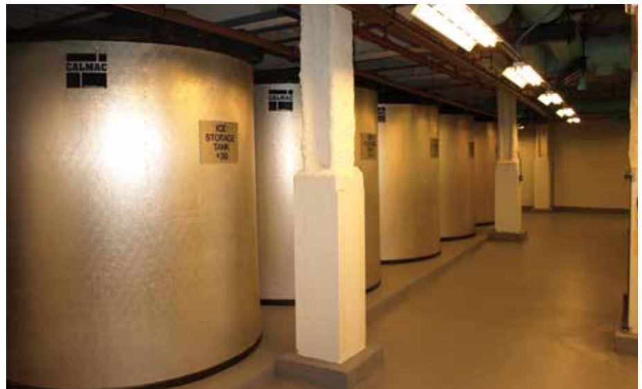
Figure 15. Ice storage tanks in the basement of Bank of America Tower, New York City. Ice created overnight is melted during the day to provide cooling.