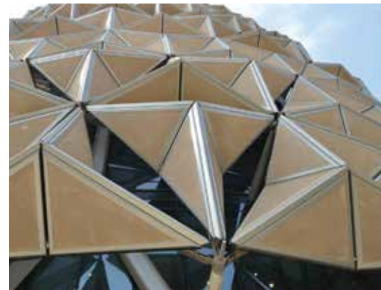
Figure 5. At Al Bahar Towers, Abu Dhabi, each panel opens and closes depending on the sun's position, allowing light to enter the building (and views out) while blocking direct glare and heat gain. © Terri Meyer Boake

Like One Central Park and the Al Bahar Towers, Torre Reforma (see figures 6 and 7) must look for innovative strategies to cool the space in a predominantly warm climate. In this building, all rain and wastewater is 100 percent reused, primarily for air conditioning,