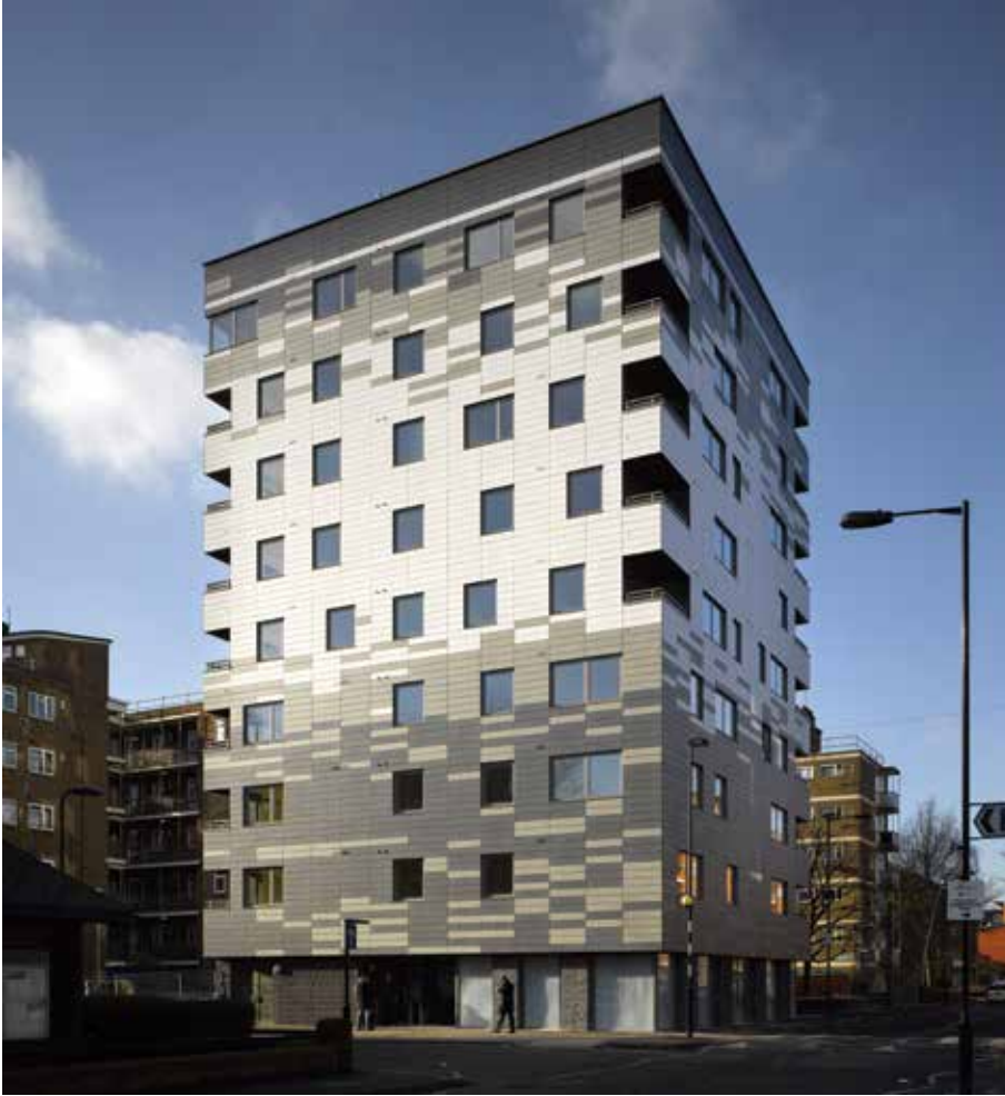
Figure 12. Completed in 2009, Stadthaus, London, was one of the first modern tall buildings to use cross-laminated timber (CLT) panels.