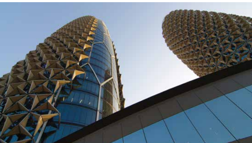
Figure 4. The façade panels of Al Bahar Towers, Abu Dhabi, are representative of a mashrabiya , a traditional lattice screen used to shade buildings in the Middle East.