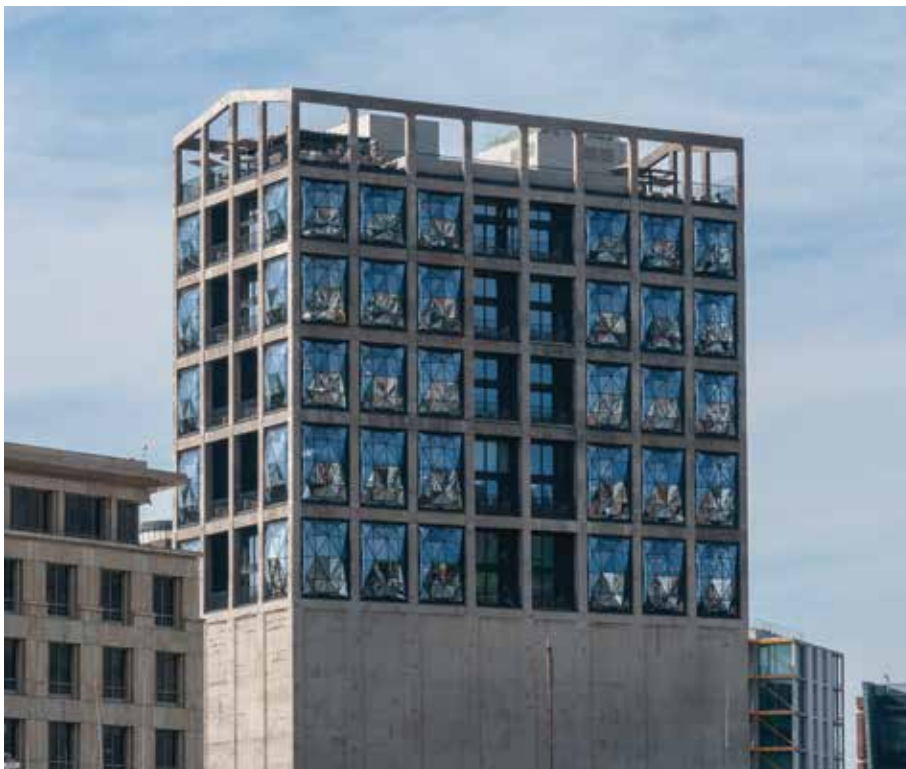
Figure 8. The Zeitz MOCAA project in Cape Town is an adaptive reuse of a former grain silo, significantly limiting the embodied energy required in its creation.

The façade, specialized mechanical engineering, and thermal inertia from exposed