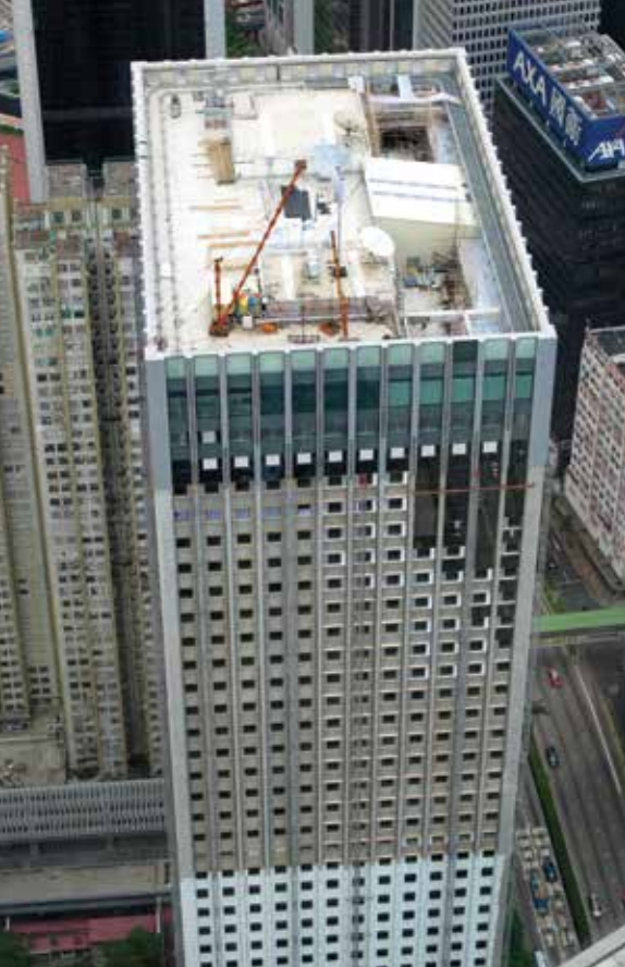
Figure 10. China Resources Building, Hong Kong, incorporates modern HVAC technology and operational standards into a reused, existing structure, meaning that 97 percent of the total building envelope, structural core, floors, and roof of the existing building could be retained.