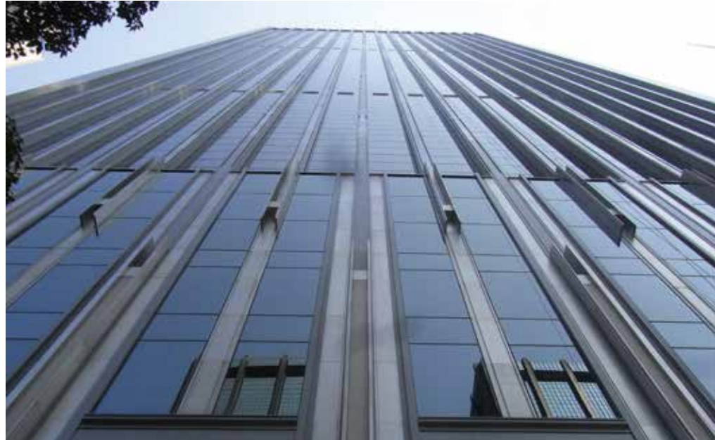
Figure 11. A façade detail view of China Resources Building, Hong Kong, which features a special low-e coating to limit solar gain.

concrete soffits all contribute to a precise system that reduces the power demand on the building and allows the humidity and temperature to be regulated, allowing particularly fragile artwork to be loaned to the museum and viewed in this space.