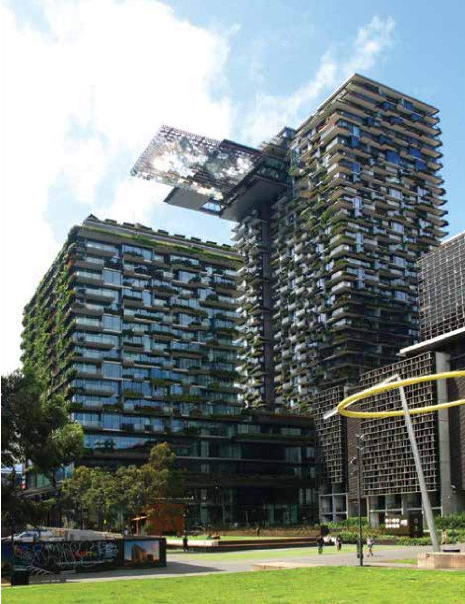
Figure 2. One Central Park, Sydney, is distinguished by its 5-kilometer-long system of hydroponic planters and 40 cantilevered heliostats that track the sun to optimally direct solar rays toward underheated and underlit areas.