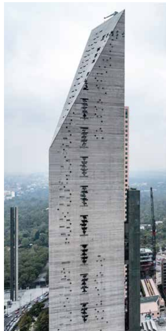
Figure 6. Torre Reforma, Mexico City, uses its concrete shear walls to limit solar heat gain. © HEXA