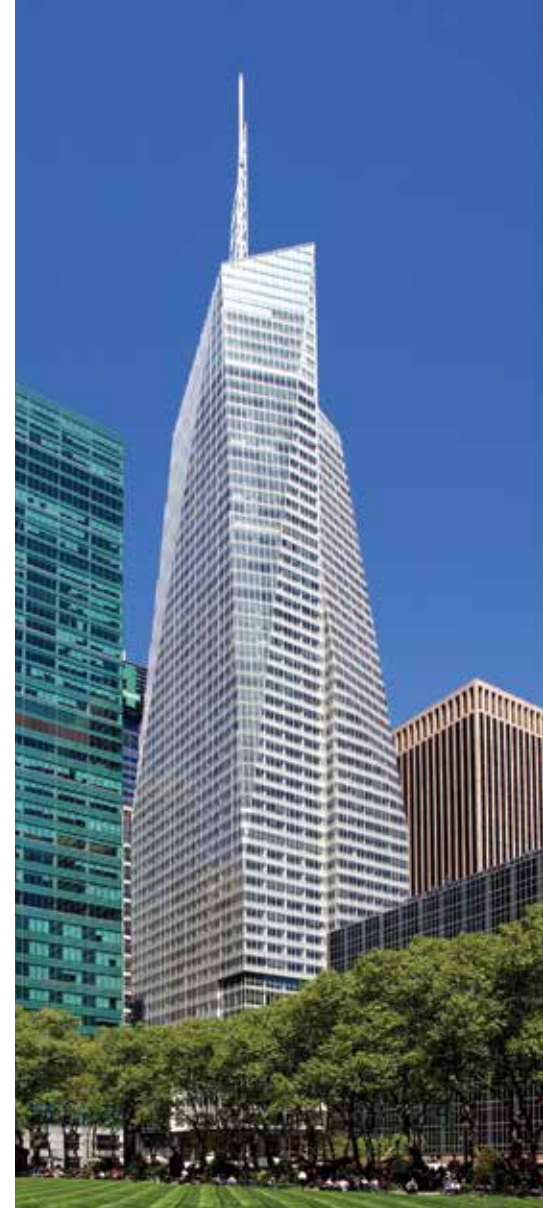
Figure 14. The high-performance curtain wall of Bank of America Tower, New York City, minimizes solar heat gain through low-e glass and a heat-reflecting ceramic frit. © Marshall Gerometta

World Green Building Council (WorldGBC). (2019). Bringing Embodied Carbon Upfront . London: WorldGBC.