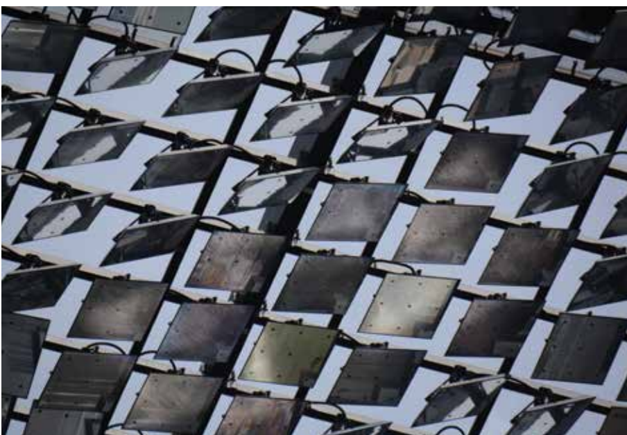
Figure 3. The heliostats on One Central Park, Sydney, provide hours of sunlight and heating to areas normally shaded. © Terri Meyer Boake

half of the building sector's total carbon footprint (WorldGBC 2019). As changes and improvements are made to operational carbon emissions, there should be a consideration of the embodied energy being consumed, in order to ensure that resources are used efficiently.