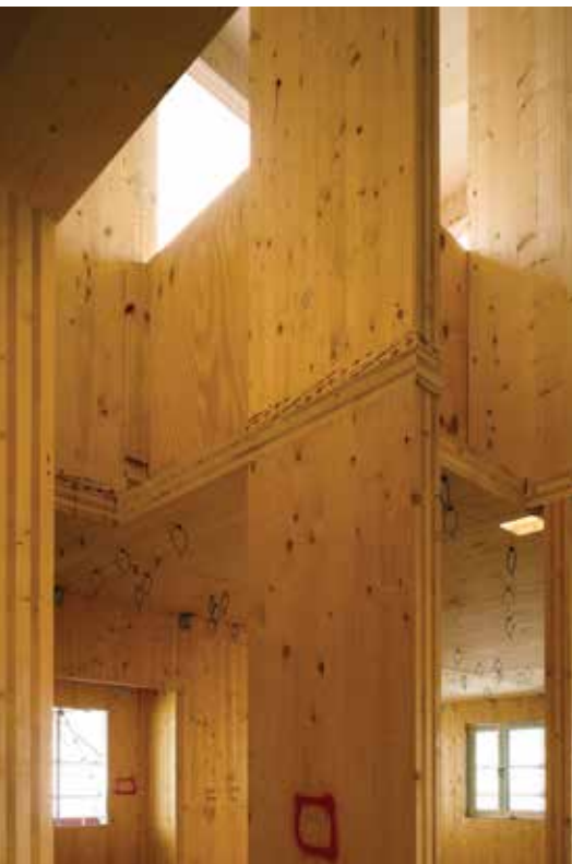
Figure 13. An interior, under-construction view of Stadthaus, London, reveals the aesthetics and simplicity of using timber paneling, panel construction, adding to its value as a carbon sink.

significant role in reducing embodied energy consumption.