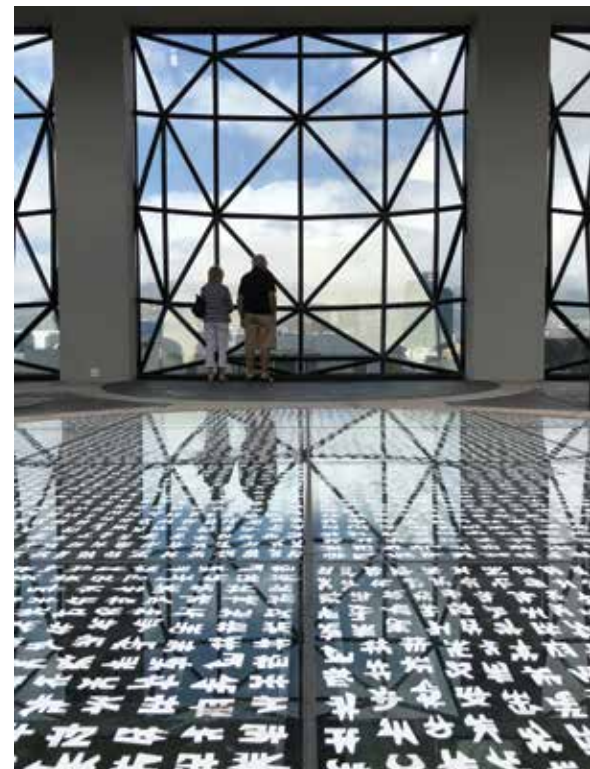
Figure 9. The cooling/heating requirements of the solar control glass at Zeitz MOCAA, Cape Town, were analyzed with computational fluid dynamics and effectively minimized the solar heat gain.