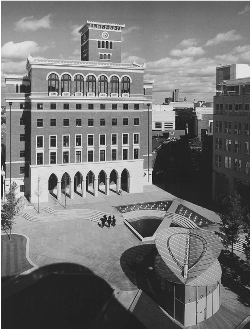
Figure 5 Brindleyplace Square, featuring award-winning coffee shop by Piers Gough/CZWG and No. 3 Brindleyplace office building (with clocktower) by Porphyrios Associates, with pedestrian link (shaded) to footbridge, International Convention Centre and city centre via Centennial Square.