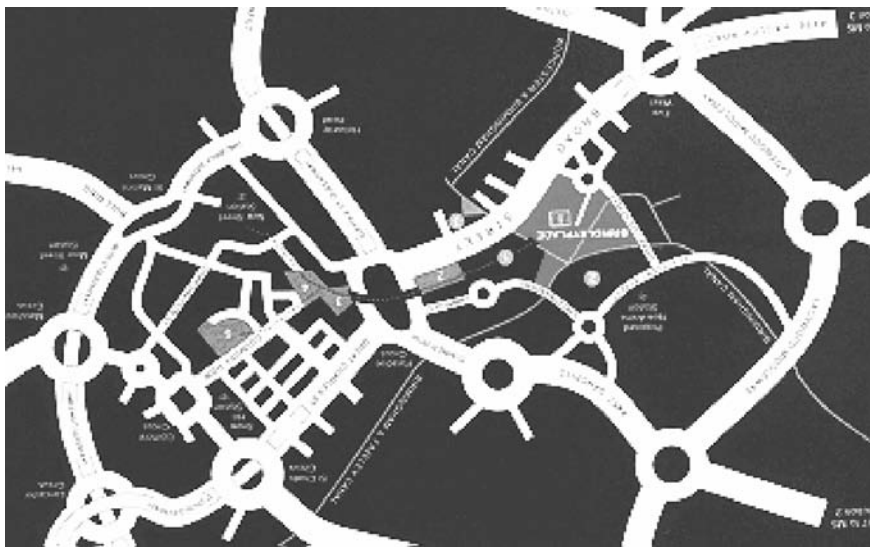
Figure 1 Central Birmingham (encircled by inner ring road at right).

Whilst perhaps good luck, good fortune, fortuitous circumstances and location may have helped, there has clearly been a lot of clever work to ensure that when the opportunity arose it was seized, and then maximised. Birmingham's thorough forward-planning and focus on quality in design and urban environments ensured that redevelopment of the Brindleyplace site was elevated from just another office complex to a landmark development that has repositioned the city for the new millennium.