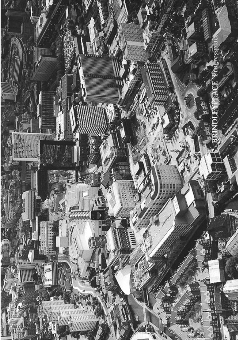
Figure 4 Aerial view of Brindleyplace during construction (1998) facing east, showing relationship to central city area (central middle and rear ground) and Broad Street arterial on right. [Argent Properties]