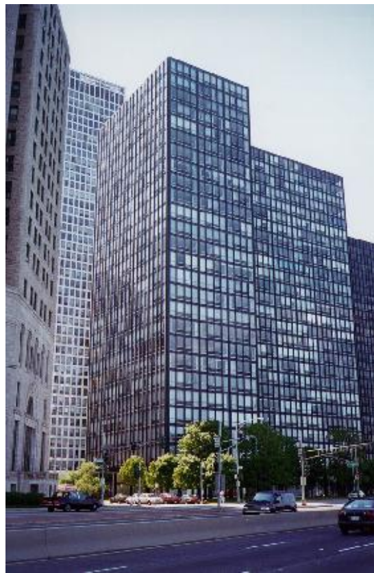
Fig. 1 860–870 Lakeshore Drive Apartments,

dential prototype soon became an international archetype for the tall modern office building. The twin towers of the Lake Shore Drive Apartments are identical prismatic shafts with recessed loggias at their bases expressing the structural columns of the glass-infilled frame above. The vertical array of metal mullions emphasises the verticality of each tower. The architectural expression of the towers is both rational and ideological. The glass and steel structure expressed in the façade represents an ideal proportional order governed by the constraints of material and technology. (Saliga, 1990). By choosing to use structural steel in his design, Mies was faced with the problem of fire-proofing the exposed structural steel and at the same time expressing the nature of the material from which the structure was formed. To solve this dilemma he conceived an "organic approach to detailing" by developing his vocabu-