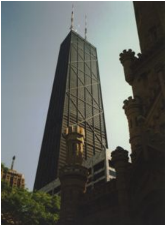
Fig. 3 John Hancock Center, Chicago, Illinois.

The Sears Tower (Fig. 4) consists of nine equally