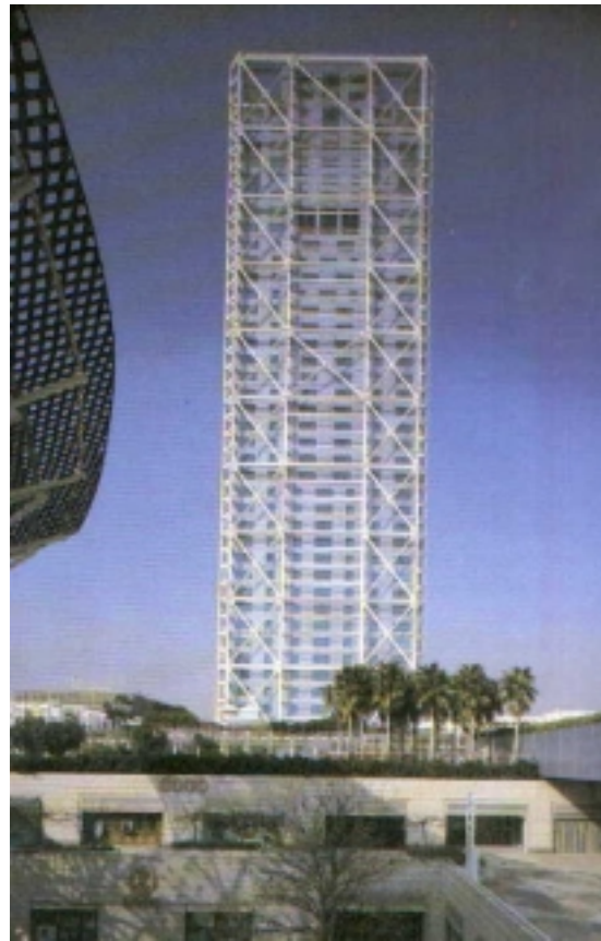
Fig. 6 Hotel De Las Artes, Barcelona, Spain.

clear expression of all members and joints allows for interesting shadows and changing views. While the positions of the trusses accentuate the height of the building, the middle truss at a higher elevation emphasizes its top whereas the lower one accentuates its base.