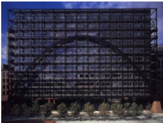
Fig. 5 First Exchange House, London.

This 45-story hotel-apartment exo-skeletal tower (Fig. 6) is square in plan and is elevated on a base of columns. The fully exposed structural frame is pulled out from the main building, as in the case of the First Exchange House. The cross bracing is concentrated at the corners. These corners are connected at three separate levels to create a partial trussed-tube form. The attention to details gives the building its visual appeal. The