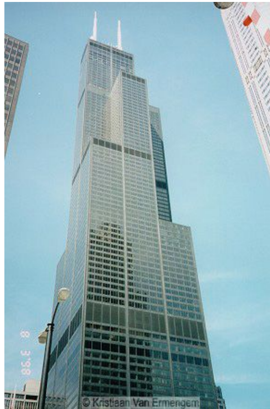
Fig. 4 Sears Tower, Chicago, Illinois.

sized 22.9-m. square tubes, some of which are cut off at different levels. This expression of each tube's independence is contrasted by the mechanical levels, which are placed at the same level on each tube. Steel belt trusses enclosing these levels wrap around the building, bundling the individual tubes together. The mechanical levels also cap many of the tubes. The barrel-vaulted entrance of the tower (which was added later) is not integrated with the overall structure and the aesthetic intentions of the building. The Sears Tower tapers and steps skyward providing different images from different vantage points as one moves around it in the city. The Sears Tower, because of its large scale and minimalist detailing, is most impressive when viewed from afar whereas the Hancock is more expressive at close range, because the X braces are not as visible from a