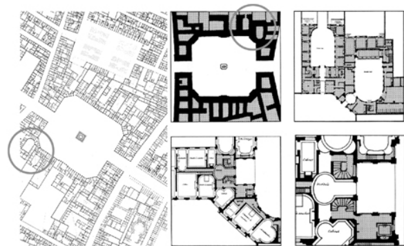
Figure 1: Hotel Corzat, off Place Vendome, Paris, France.

The figurative (semi-public) void within the urban infill of the hotel is a microcosmic analogy of the Sky court and an attempt to recapture open space for the greater good of civil society (Dennis, 1988).