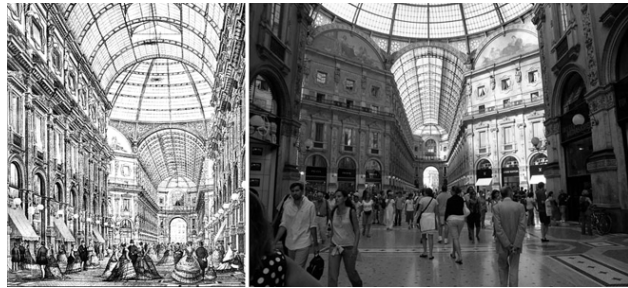
Figure 2: Galleria Vittorio Emanuele II, Milan, Italy

city, placing circulation and ease of movement at the heart of the design and the opportunity for a discourse regarding spatial configuration and movement. Just as civil society is provided with both choice of route and mode of transport on the ground (the ability to walk, cycle, drive, or take public transport through a variety of axes), the occupant or visitor to the tower will be faced with a multiplicity of circulation routes and modes in the sky, stemming from and activating the court as a transitional space that is integrated with the pedestrian movement of the city.